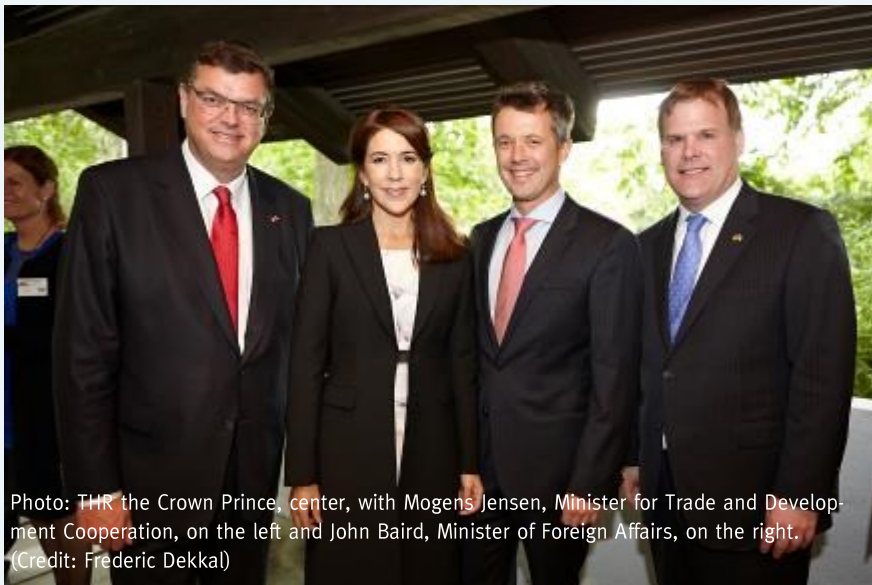
Photo: TRH the Crown Prince, center, with Mogens Jensen, Minister for Trade and Development Cooperation, on the left and John Baird, Minister of Foreign Affairs, on the right.

Before TRH the Crown Prince Couple headed to Toronto they participated in a reception to meet and greet Canadian politicians, local stakeholders and Danish business people.