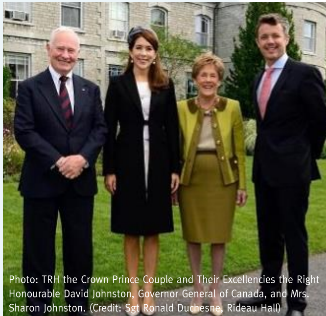
Photo: TRH the Crown Prince Couple and Their Excellencies the Right Honourable David Johnston, Governor General of Canada, and Mrs. Sharon Johnston.

Rideau Hall has been the official residence and workplace of every Governor General since 1867. This national historic site has welcomed several members of a royal family, heads of State and other dignitaries. The tradition of ceremonially planting a tree began over a century ago. Since that time, planting ceremonial trees on the 79-acre grounds has become a Canadian tradition, symbolizing the living friendship and co-operation of nations.