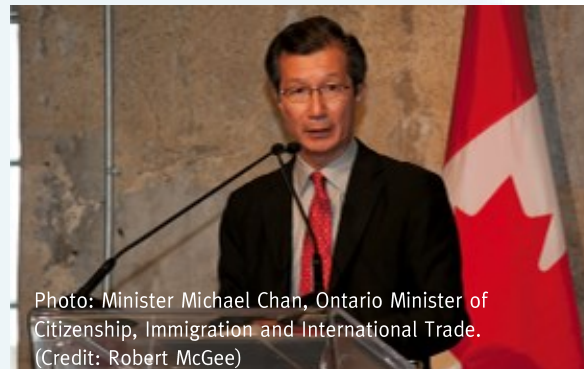
Photo: Minister Michael Chan, Ontario Minister of Citizenship, Immigration and International Trade.