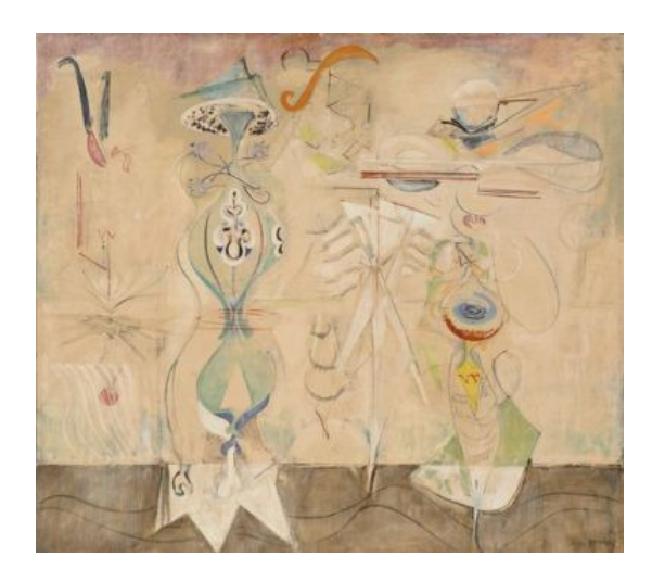
Mark Rothko, Slow Swirl by the Edge of the Sea, 1944, Museum of Modern Art, New York.

Thus, Rothko attempted to depict the inner self in his portraits, rather than a specific likeness. He felt that by abandoning the human figure, he could create a more realistic image of a person's true being. Solow Swirl by the Edge of the Sea (Museum of Modern Art, New York), one of Rothko's paintings from 1944, is a double portrait, presumably of Rothko and his second wife, Mell. His portrait represents a change from Rothko's portraits of the 1930s, before he was influenced by Surrealism, which contain recognizable human figures. In Slow Swirl , the humans are depicted as a series of odd shapes, curved lines, and spirals. Though unidentifiable, these figures are drawn from Rothko's instincts; they represent how his psyche truly identifies itself with his wife.