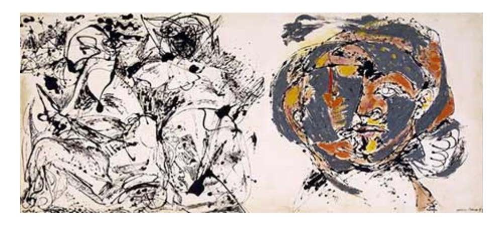
Jackson Pollock, Portrait and Dream, 1953, Dallas Museum of Art.

word "portrait" is obvious, the dream displays Pollock's knowledge of Jung. Archetypes are, according to Jung, produced by the collective unconscious. The collective unconscious, however, is usually only reached through dreams or art. Though Pollock, arguably, gained contact with the collective unconscious through his art, he displays a recognition of the ability to connect with the collective unconscious through dreams, as seen through the use of the word "dream" in the title.