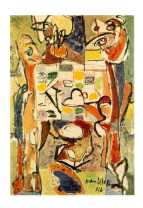
Jackson Pollock, The Tea Cup , 1946, Collection Frieder Burda, Baden-Baden.

While Pollock's new found use of bright color was short-lived, the effects of his new lifestyle continued to transform his work. This transformation is clearly seen in Galaxy (Joslyn Art Museum), one of Pollock's paintings from 1947. This painting is included among Pollock's first set of drip paintings; however, it contains some remnants of the style employed in the "Accobonac Creek Series" beneath the splatters, presumably added later. 92 Amorphous, brightly-colored shapes are veiled by a series of drips, mostly white. In the same year, Pollock created Reflection of the Big Dipper (Stedelijk Museum, Amsterdam) and Full Fathom Five (The Museum of Modern Art, New York), both of which were entirely covered with the drips that appeared in Galaxy . Specific shapes reminiscent of those used in the "Accobonac Creek Series" or in his earlier works, however, are not present on the surface of these two drip paintings.