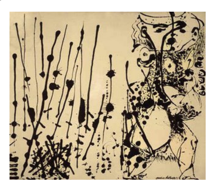
Jackson Pollock, Number 7, 1951, 1951, National Gallery of Art, Washington D.C.

1951 (1951, National Gallery of Art, Washington D.C.), created completely in black, displays a series of long poured lines interspersed with blotches of paint. A dense square of interwoven drips is situated under this series of blotchy lines. The right side of the painting shows the greatest departure from Pollock's allover drip paintings. The figure of a woman can be easily discerned amongst a cluster of curvilinear lines and splotches. The woman has a face with two eyes, a nose, and a mouth. Her breasts and torso are prominent in the painting. This sudden return to the depiction of the female form can be explained in Jungian terms. It is likely that with the return of his alcoholism and mental problems, Pollock's mother complex, as described by Doctor Henderson, returned in full force. Thus, the repressed terror that Pollock harbored in regard to his mother, Stella, was unleashed once again in his art.