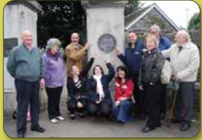
Stanhope Park - QEII Jubilee Field Plaque