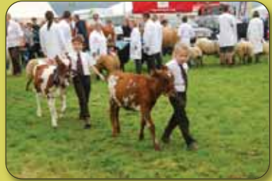
Holsworthy & Stratton Agricultural Show

St Peters Fair – in the first week of July each year, the town comes spectacularly to life with an annual fair that has taken place for centuries. The highlight of the week is “Fair Day”, on Wednesday, when a whole range of traditional rituals and activities take place - including the ceremony of the introduction of the Pretty Maid, at noon, to the people of the town. During the entire week, there is an array of musical performances in the Square, displays in the churches and other associated events, such as the meeting of the Court Leet, which is led by the Portreeve and his officers.