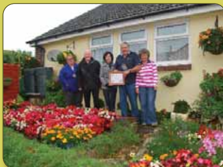
Holsworthy in Bloom