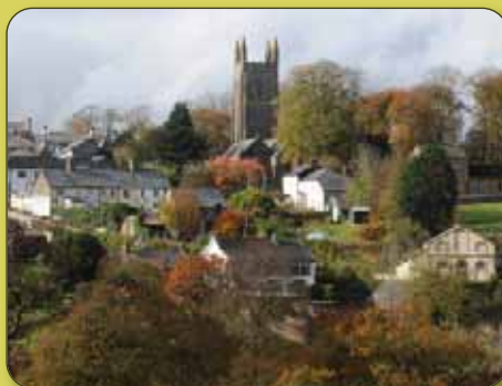
Holsworthy Parish Church of St. Peter and St. Paul

North Road Community Centre Holsworthy, Devon EX22 6HJ Tel: 01409 254078 Fax: 01409 259008