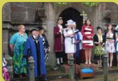
Pretty Maid Ceremony 2012

Holsworthy can be dismissed at first glance as a town where time has stood still, where the centuries have passed with little change, but such an impression is misleading. Our ancient settlement has seen plenty of excitement over the years and many changes, whilst still maintaining its traditions and steady pace of life: qualities much sought after in these hectic modern times. Our new Town Guide will show that Holsworthy has much to offer while still fulfilling its age-old role as a functioning, almost quintessential Market Town in the centre of a deeply rural agricultural district.