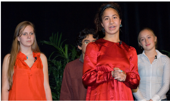
Students from Wheeler's award-winning Theater Program performed at the kickoff to The Campaign for Wheeler in vignettes about the need for gifts for financial aid, faculty support and capital improvement.