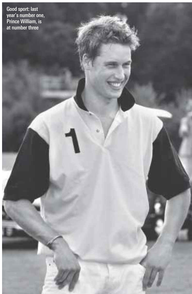
Good sport: last year’s number one, Prince William, is at number three

Don’t ask for co-star Viggo Mortenson’s phone number, or mention Julie and the Cadillacs . Well, have you ever seen it?