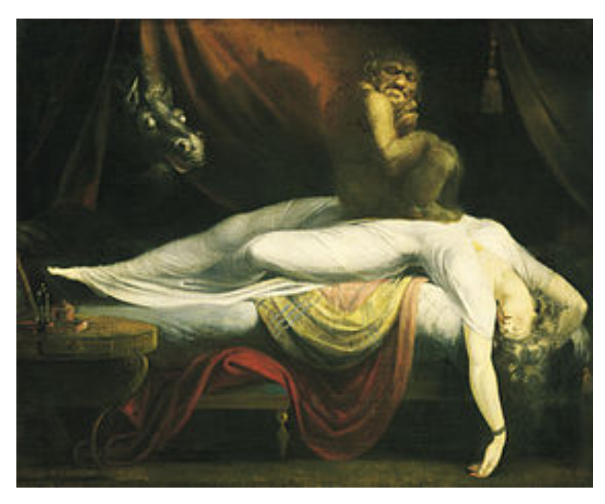
Figure 1: The Nightmare , by Henry Fuseli (1781) is thought to be one of the classic depictions of sleep paralysis perceived as a demonic visitation.

Since Carl Jung coined the term "Collective Unconscious," those who have been exposed to western psychology have been consciously aware of the theory. This theory, suggests that within each person exists, not only a personal reservoir of unique individual experiences, but also a collective universal system of inherited cognitive remnants, identical in all individuals. Much in the same way, and for thousands of years longer, Australian Aborigine dream beliefs are not far from Jung's hypothesis of an 'all-at-once' unconscious world. Assuming that the hypothesis and beliefs about a collective unconscious warrant some truth, how then can we as human beings not only be aware of this potential reservoir, but also act upon these inherent inclinations as tools during the creative process when ideas manifest in a conscious space? I will acknowledge and compare the unconscious philosophies of the Australian Aboriginals with those of the psychologist Carl Jung, and their methods of pursuing those philosophies in a consciously creative state. With these findings in mind, I hope to discover what makes these two tribes of thought so vulnerable to thrive on intuition, in an attempt to reassess the unconscious relationship I believe to have with my father. Although both Jung and