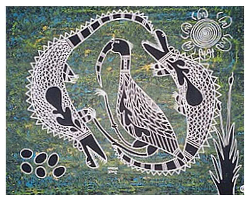
Figure 4: Ungambikula, Early Aboriginal painting depiction of Ancestral beings, two beings, self-created out of nothing.

In a land far from Aboriginal Australia, in a distinctly dedicated period of time (1875-1961), Swiss psychologist, Carl Jung toyed with the concept of the collective unconscious. The collective unconscious, he theorized, is the aspect of the unconscious mind, which manifests inherited, universal themes, which run through all human life. The contents of the collective unconscious are archetypes and primordial images that reflect basic patterns common to us all, and which have existed universally since the dawn of time.