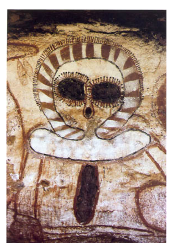
Figure 2: Wandijina. The Australian Aboriginal dreamtime sacred creator.

The Dreamtime also explains the creation process. According to Aboriginal belief, ancestor beings rose and roamed the initially barren land, fought and loved, and created the land's features as we see them today. After creating the sacred world the spiritual beings turned into rocks or trees or the landscape. Not only does Dreamtime explain the creation process, but its principles also very obviously transcend into the Aboriginal's creative process. In the early 1970's Geoff Bardon, was originally assigned as an art teacher to the government settlement at Papunya in Australia's Western Desert. Bardon found more than 1000 Aboriginal people living in a state of dislocation, their culture being systematically wiped out through "assimilation." He encouraged the Aboriginal people to paint their traditional designs using western materials rather than copying European imagery. What he observed during their process was something quite different from the white man's approach to painting. From the first stroke to the last of a Papunya Tula (commonly known as "dot painting"), Bardon watched as an Aboriginal painter approached the canvas and began painting without hesitation. "There wasn't that initial uncertainty." (Bardon, Geoff [6]). They would sit on the ground looking only at