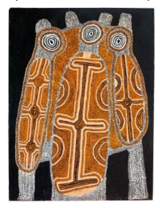
Figure 3: Uta Uta Tjangala Pintupi , (1972), Women's Dreaming.

the canvas in front of them, and complete the painting, without breaking, until it was completed. It seemed that the Aboriginals didn't have any need to draw inspiration from anywhere other than what was already seemingly mapped out in their minds.