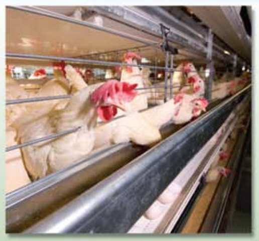
Conventional Cage System