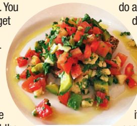
Bruschetta with pumpkin bread

bowl full of beautiful goodness with their salads. I don't normally like the new health food on the block, quinoa, but the rainbow salad at One O