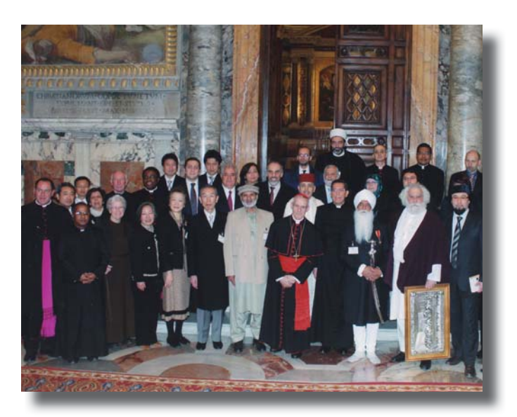
Audience with Pope Francis, 20 March 2013

In EXCEPTIONAL CASES , Nostra Aetate Study Grants may be made for study or research outside of Rome. There is also a limited amount of financial aid for such efforts as publications, purchase of books and organized study sessions with the singular focus of promoting interreligious dialogue.