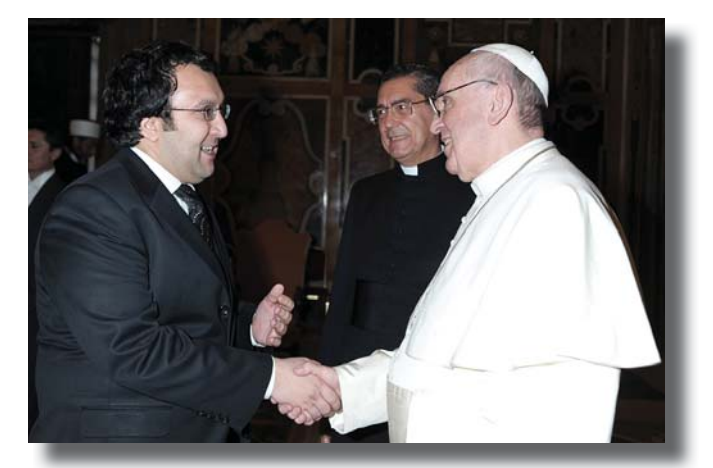
Nostra Aetate Foundation Former Scholarship Student

The PONTIFICAL COUNCIL FOR INTERRELIGIOUS DIALOGUE offers study grants to qualifying persons who have a proven experience working in the area of Interreligious Dialogue. Our focus is on helping eligible students to deepen their knowledge of Christianity through study at one of the Pontifical Universities in Rome. By studying in Rome at the center of the Catholic Church, it is the hope that these persons can return to their country of origin with an enriched awareness of Christianity so as to be better prepared to participate in the on-going dialogue there among believers.