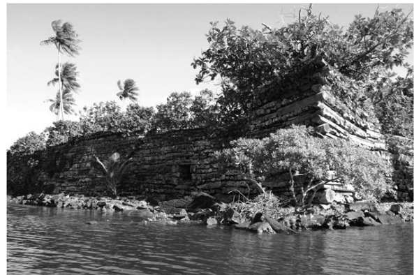
Fig. 1 Artificial islets of Nan Madol. (T. Ishimura)

The UNESCO Office for the Pacific Region (Apia, Samoa), acknowledging that international support is needed to protect and inscribe the site on the World Heritage List, approached the Japan Consortium for International Cooperation in Cultural