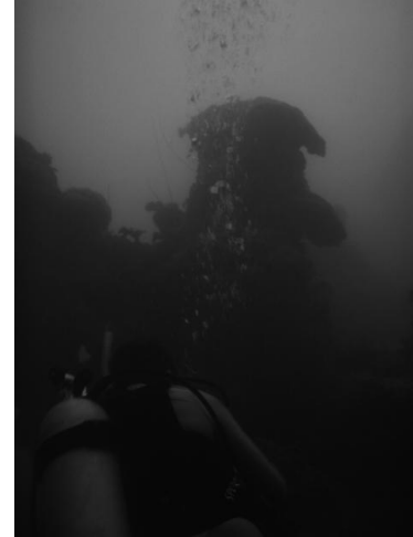
Fig. 6 (right) An erect, columnar object at a depth of approximately 30m.