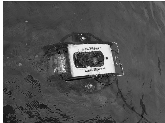
Fig. 3 (left) Multibeam sonar (SeaBat 8125) equipped with boat. (Y. Matsumoto)