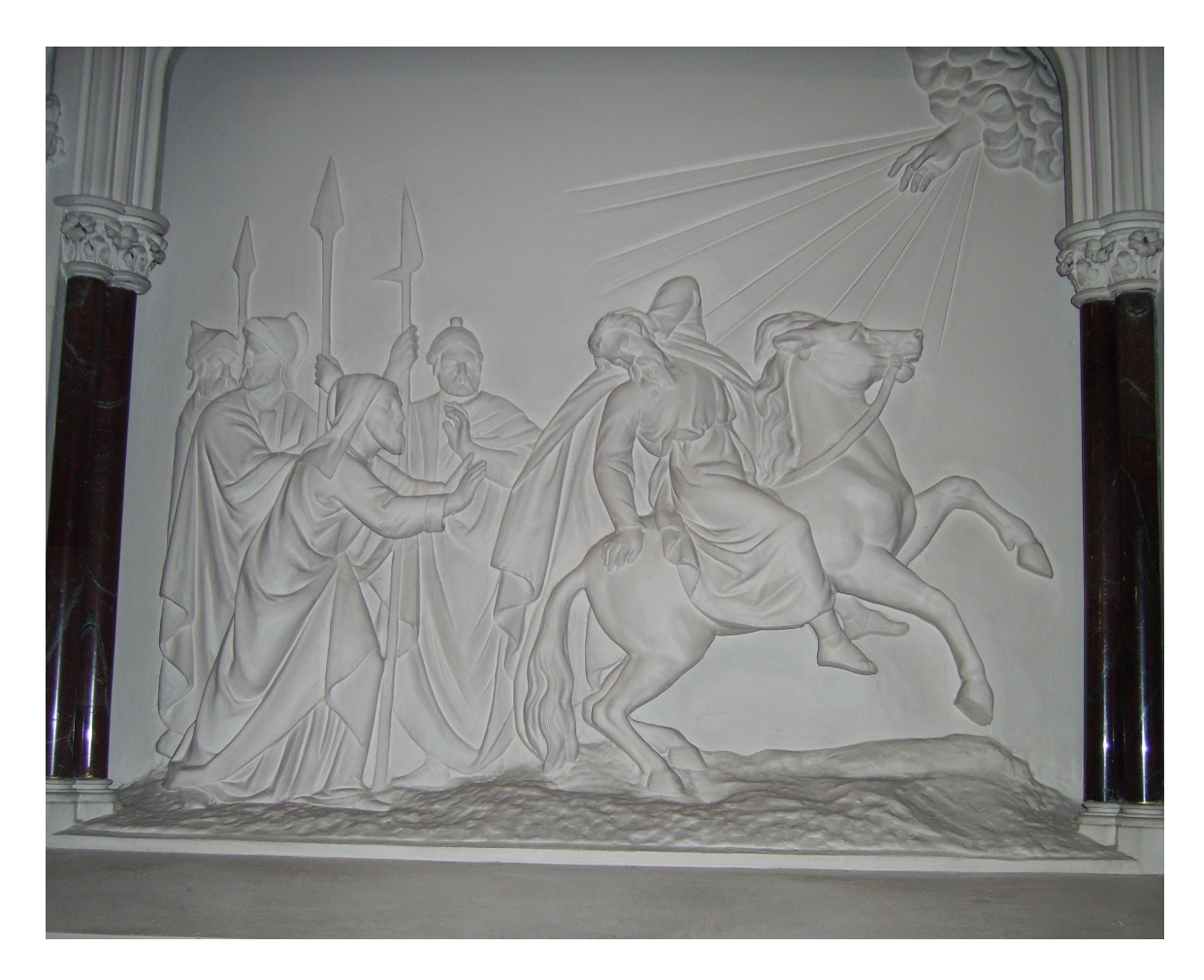
Stone carving of the Conversion of St Paul from the altar in St Paul's chapel.