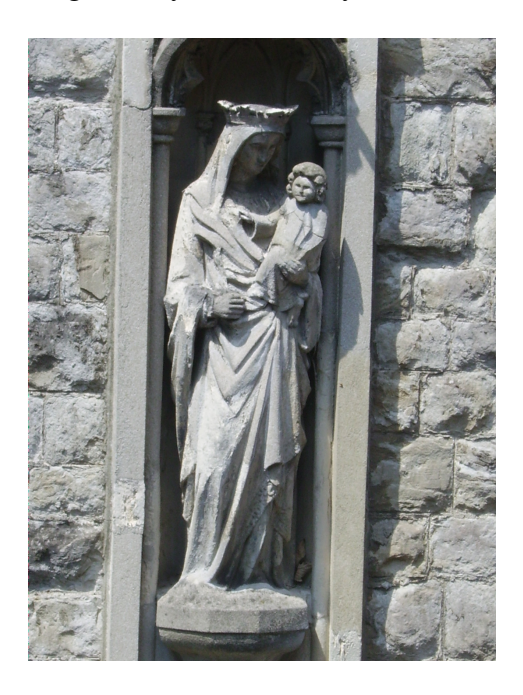
This statue of Mary and the infant Jesus stands above our side door

Rosary Prayer Group meets in the Church daily after the 6 pm Mass, Monday to Friday. Everyone is welcome to join them to meditate on the saving mysteries of Christ and pray with the Virgin Mary for the many needs of our world.