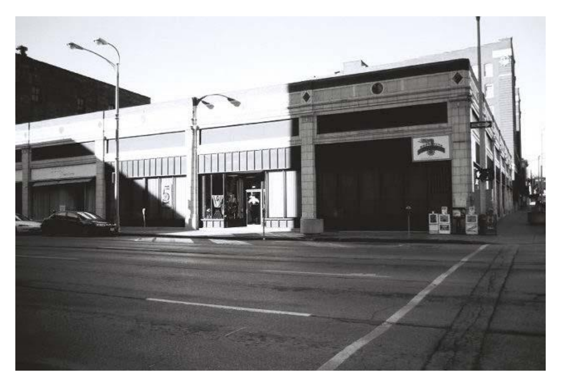
View of south elevation, looking north across West Third Street.