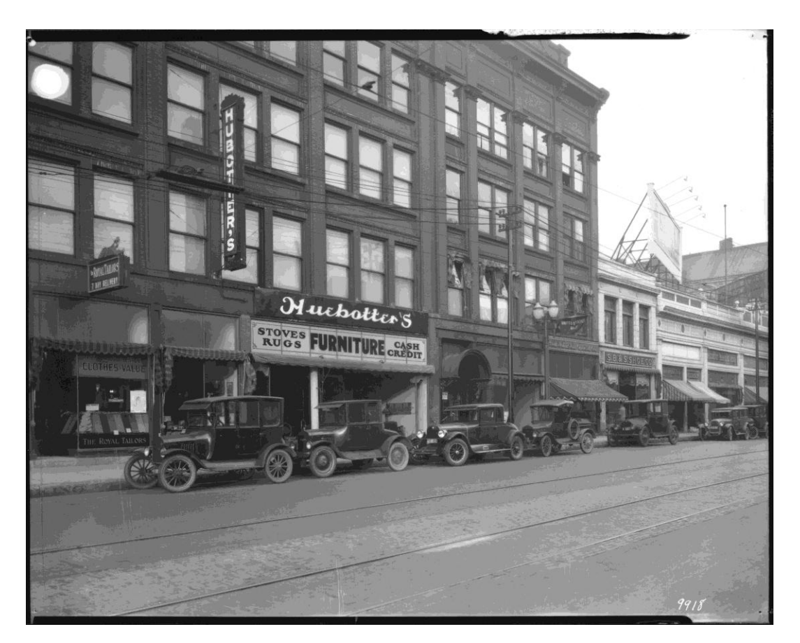
This 1926 image of the Central Office Building in 1926 shows a glimpse of the building at 202 W. 3rd sited the east end of the block (see right.)