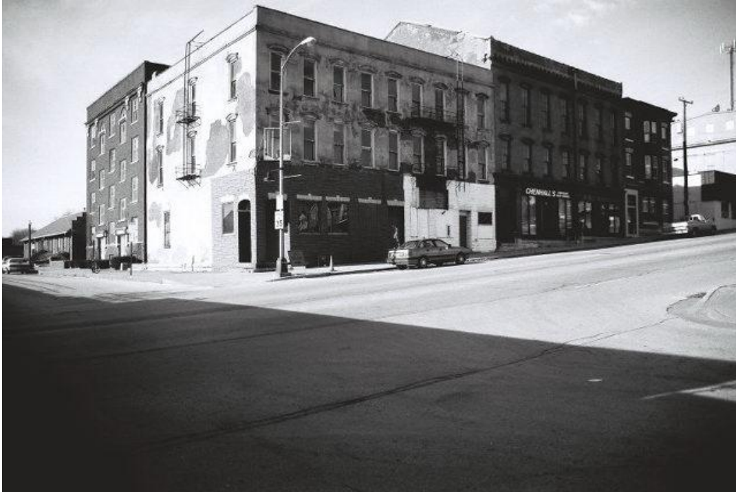
View of the primary (east) and south elevations, looking northwest across the intersection of Brady and W. 5th Streets.

Address _____ 502 (502-506) Brady Street _____ City _____ Davenport _____