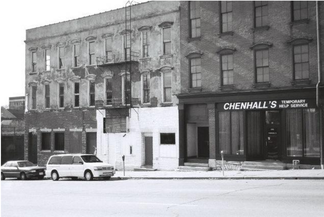
View of primary (south) elevation, looking west across Brady Street.

Address _____ 502 (502-506) Brady Street _____ City _____ Davenport _____