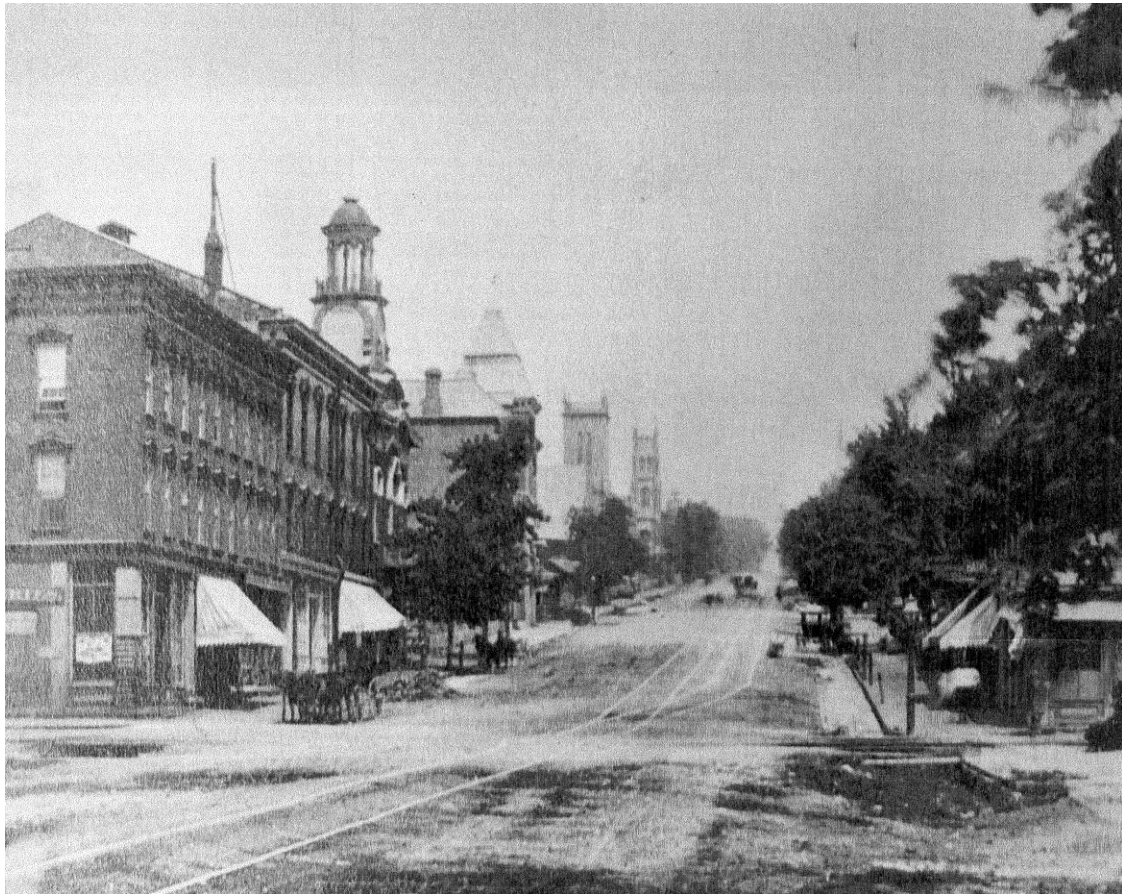
This 1880s view looking north on Brady Street from West Fifth, documents the Col. Young Block within the context of its original streetscape. Note the heavy, Italianate cornice, now lost.

Address _____ 502 (502-506) Brady Street _____ City _____ Davenport _____