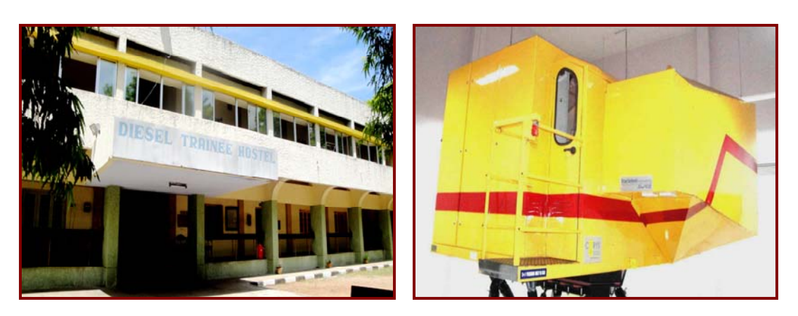
HOSTEL - DTTC