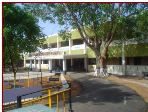
DIESEL TRACTION TRAINING CENTRE (DTTC)