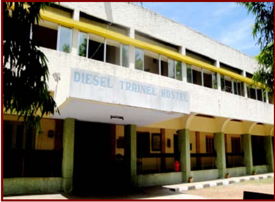
HOSTEL - DTTG