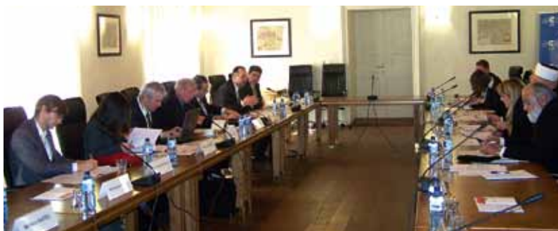
EMUNI at the Task Force on Intercultural Dialogue