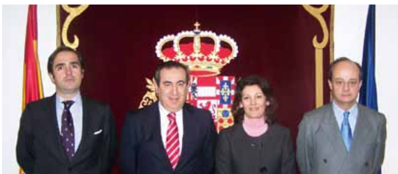
Meeting with AoC representatives from Spain

Embassy of the Kingdom of Spain to Ljubljana. The participants stressed the importance of the future development of the AoC and discussed the possibilities of possible co-operation and common projects of institutions involved in AoC. EMUNI plays a visible role in Slovenia's AoC National Action plan for 2009, including EMUNI's activities in the fields of higher education and intercultural dialogue.