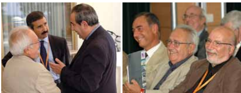
EMUNI Conference on Higher Education & Research

The 1 st EMUNI conference on Higher Education and Research was held in Portorož on the occasion of the inauguration of the Euro-Mediterranean University on 9 June 2008.