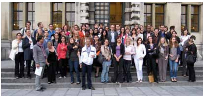
Summer School on EU Law and Policy on Immigration and Asylum

EMUNI Summer School "European Union Law and Policy on Immigration and Asylum" took place in Brussels from 29 June to 10 July. The course's aim was to provide its participants with a comprehensive understanding of the immigration and asylum policy of the European Union from a legal point of view. It was offered by the Odysseus Academic Network from Brussels.