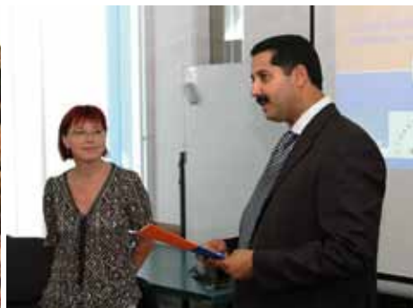
Closing Ceremony of IGU Conference