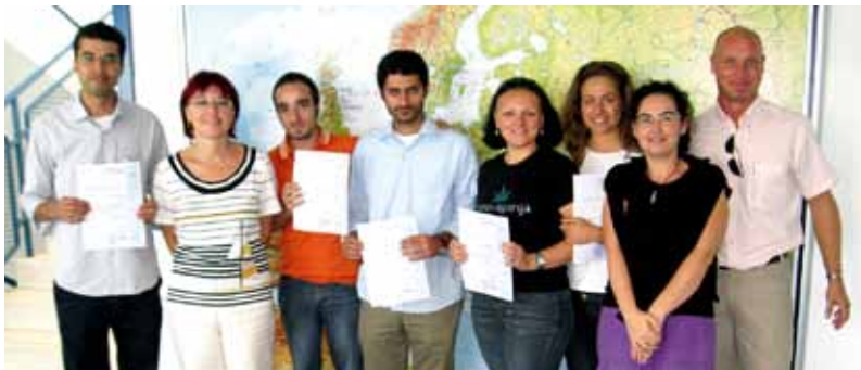
Summer School in Management in Higher Education

As part of the summer school different events were organised: official opening on 16 September at the EMUNI seat, round table "Challenges in Higher Education" on 23 September, seminar "Strategic Management in Higher Education" on 25 September in the Congress Centre Bernardin and seminar "E-learning in Higher Education" at EMUNI on 28 September.