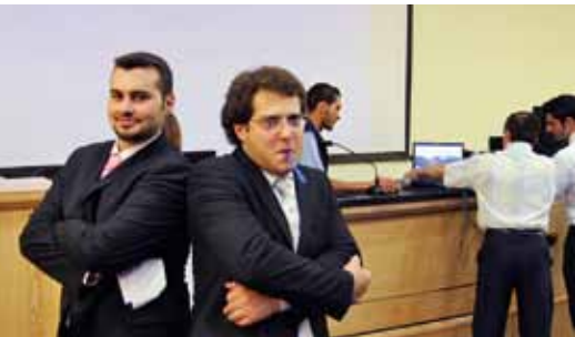
Research Souk at the Beirut Arab University