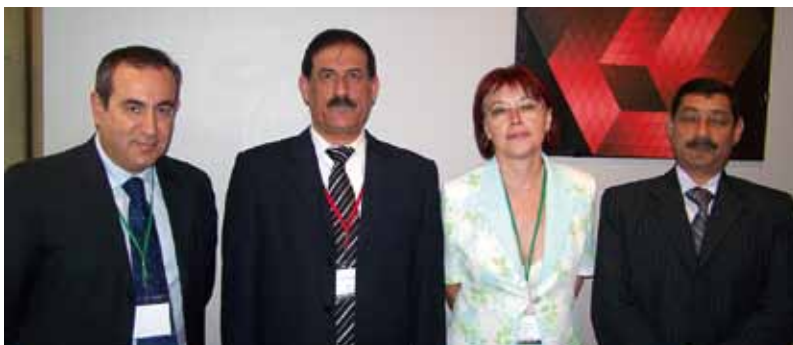
Meeting with the Minister Abid Al-Ajeeli

EMUNI delegation attended the 2009 World UNESCO conference on Higher Education: The New Dynamics of Higher Education and Research for Societal Change and Development.