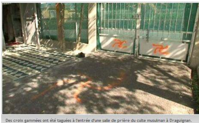
Des croix gammées ont été taguées à l'entrée d'une salle de prière du culte musulman à Draguignan.

Related: Three French mosques vandalized, Muslim group urges politicians to speak out – A