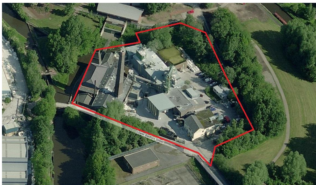
Image shows some buildings which have subsequently been demolished

Site Area : 1.69 Acres Development potential subject to planning Useful Offices, Laboratory Space, Workshops and Storage Buildings Price : On Application