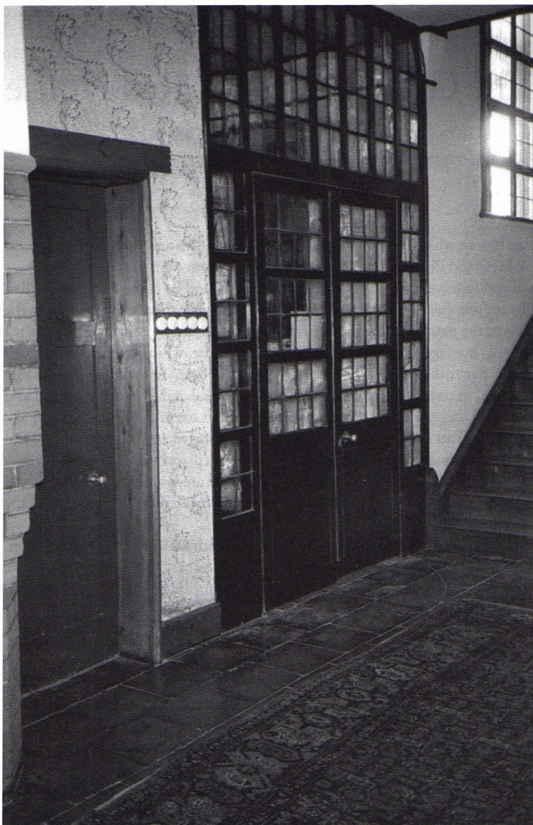
Figure 1: The glazed screen at Red House