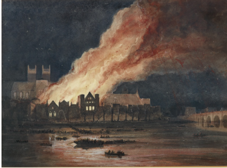
The Palace of Westminster on fire, 16th of October 1834 by William Grieve, 1834.

In the weeks following the fire, the enterprising seized on the commercial opportunities provided by this great national calamity. As well as the many cheap prints of the fire which circulated, souvenirs were created out of salvaged stone, lead and wood from the destroyed buildings. A number of stage representations and dioramas (a kind of 19th century virtual reality show) of the fire were advertised in the newspapers, and this watercolour by William Grieve, a stage designer at Covent Garden Theatre, bears all the hallmarks of his profession. WOA 1054