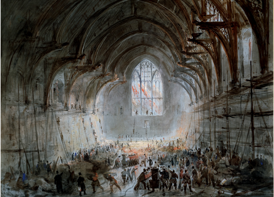
Westminster Hall on fire, 1834 by George B. Campion (watercolour on paper, 1834). WOA 1669

By the middle of the evening it was clear that the fire was uncontrollable in most of the Palace. Westminster Hall became the focus for the firefighters and hundreds of volunteers. Its thick stone walls provided an excellent barrier against the spread of the fire, but the 14th century oak roof timbers were in great peril and were saved only by repeated dousing with water from the hoses.