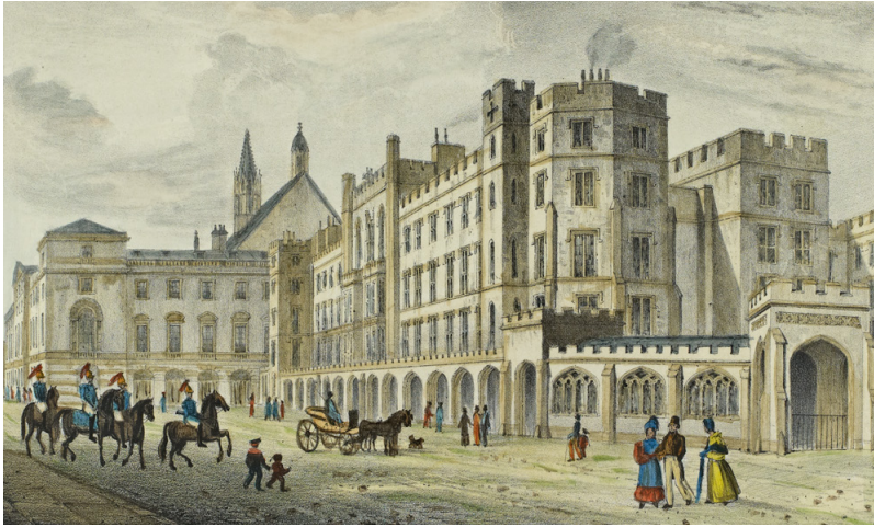
Old Palace Yard before the fire. The Lords is in the middle, with John Soane's Royal Entrance on the far right. The block on the left contains Commons committee rooms and Bellamy's restaurant, with the south gable of Westminster Hall peeping out behind. WOA 1329

They were mistaken. A huge fireball exploded out of the building at around 6.30pm, lighting up the evening sky over London, and immediately attracting hundreds of thousands of people. It turned into the most significant blaze in the city between 1666 and the Blitz and burned fiercely for the rest of the night. The fire could be seen from across the home counties and at least 44 artists are known to have painted the catastrophe itself or the ruins of the ancient building it left behind.