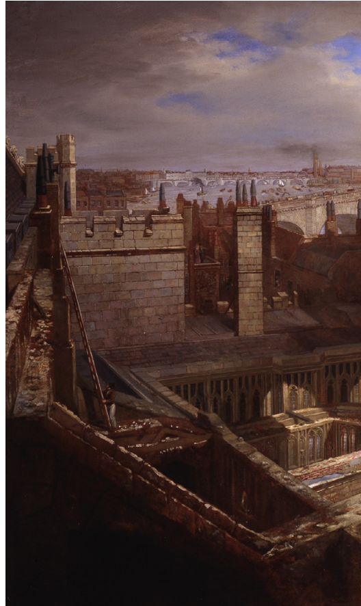
Panorama of the Ruins of the Old Palace of Westminster In this panoramic view of St Stephen's Chapel and the Cloister, Pugin is shown damping down the embers in the Cloister, and dazed Palace

"Truly astonishing...from the the flames were rushing out or six minutes and the effect and awfully grand" Pugin