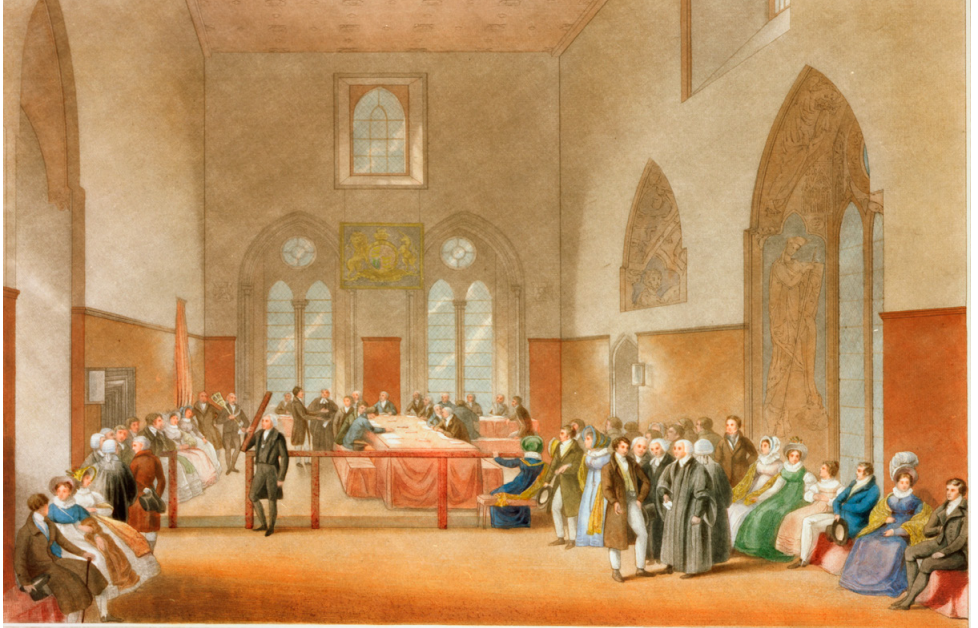
The Painted Chamber around 1820. WOA 922

The Painted Chamber was perhaps the greatest artistic treasure lost in the fire. When constructed in the thirteenth century by Henry III (1216-1272), it took its name from the magnificent paintings which decorated its walls. In the middle ages, the opening of Parliament took place in this room, and it was the venue for the signing of Charles I's death warrant by Oliver Cromwell and the other regicides in 1649. But over the centuries the famous and beautiful walls were whitewashed, papered over, and forgotten. It is tantalising to speculate what might have happened to the wonderful medieval art if the 1834 disaster