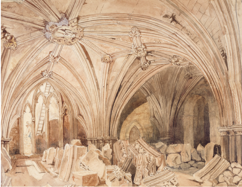
The Undercroft Chapel shortly after the fire: the state dining room was turned into a store for salvaged stone from the ruined House of Commons directly above it. G. Moore, "St Stephen's chapel ruins, after the fire, 1834", Watercolour on paper. WOA 5195

Adjoining St Stephen's Chapel was a tiny but perfectly-formed perpendicular cloister, with its own miniature chapter house, dating from 1526. At the time of the fire it was part of the Speaker's residence, and although half was badly damaged by the fire it was restored by Charles Barry. One of the great treasures of late medieval gothic architecture, the cloister and chapter house still survive today, wrapped inside the new Houses of Parliament.