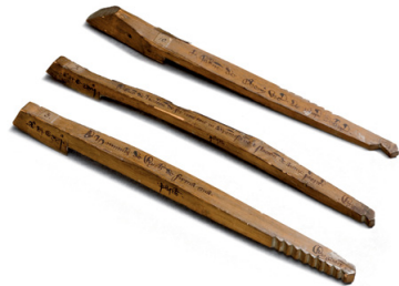
Wooden tallies, 13th century. Parliamentary Archives, HLI/PO/RO/11/195/4-6

There was panic within the Palace for the next 25 minutes but no-one seems to have raised the alarm outside, perhaps imagining that the fire - which had now taken hold and was visible on the roof - could be brought under control quickly.