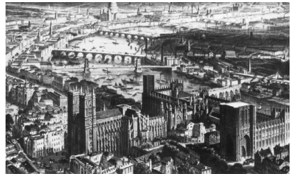
This poignant drawing from the Illustrated London News shows the gigantic new Palace rising up around the old, just before the final remnants disappear forever in the early 1850s. WOA 2389 (Detail)

The damage to the wrecked and uninsured Palace was estimated at £2 million. No-one however was prosecuted, though the public inquiry which followed found various people guilty of negligence and foolishness. The fire ultimately resulted in the establishment of the first public London Fire Brigade and the creation of a National Archives for the United Kingdom.