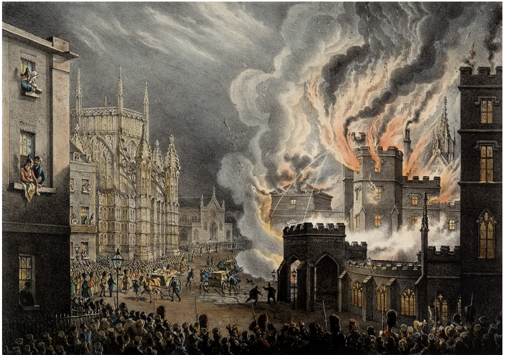
‘The Destruction of the Houses of Lords and Commons by Fire on the 16th of October 1834’ Hand coloured lithograph, 1834, by William Heath.

“Damn the House of Commons, let it blaze away!” cried the Chancellor of the Exchequer, “But save, O save the Hall!”