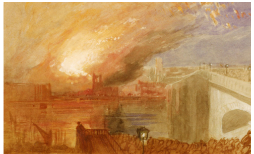
Fire in the Palace of Westminster by Hercules Brabazon Brabazon, 1834. WOA 273

the pumps on the night, and were paid in beer for their efforts. Contrary to popular opinion, the thousands of onlookers in the vast crowds did not generally stand around cheering. Most were awestruck and terrified by the spectacle, others were injured in the crush, and plenty were pickpocketed.