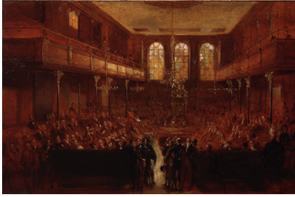
'The first reformed House of Commons, 1833' by Sir George Hayter, oil sketch.

This is one of the last images executed of the interior of the old House of Commons before its destruction in the fire of 1834, and shows the wooden panelled interior, cramped, hot and smelly which MPs had been complaining about for years. There is nothing on display of Edward III's gothic chapel hidden underneath. WOA 363