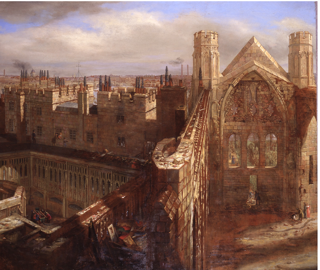
er, 1834 by George Scarf (oil on canvas, 1834)

time of the House of Commons first taking fire till of every apperture [sic] it could not be more than five of the fire behind the tracery &c was truly curious