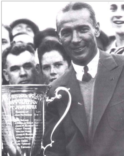
Leo Diegel Won PGA Championship 1928 & 1929 Won Canadian Open 4 times Played on first 4 Ryder Cup Teams Won 29 PGA Tour titles