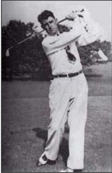
Henry Picard Won 1938 Masters Tournament Won 1939 PGA Championship Played on 3 Ryder Cup Teams

British Open. While at Reading he won eight PGA Tour events, and finished in the top 25 on 48 other occasions. In his career he won two PGA Championships, two Masters, one U.S. Open, a Canadian Open, a Western Open and he was the leading money winner four years. In 1945 he won eleven straight tournaments on the PGA Tour. This is a record that probably will never be touched. He played on two Ryder Cup teams and was the non-playing captain in 1965. He retired from the tour in 1946 at the age of 34 with fifty-two career victories and thirty-six second place finishes. Nine years later he won the French Open. Nelson was selected for the PGA Hall of Fame in 1953.