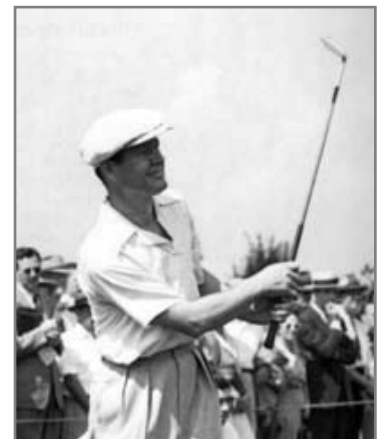
Byron Nelson Won U.S. Open Won 2 Masters Tournaments Won 2 PGA Championships Won 11 straight on 1945 PGA Tour