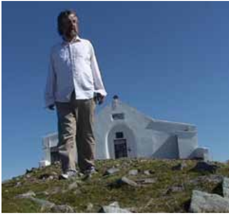
The Tinker's Curse