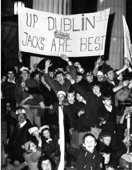
The 'Dubs' victory parade