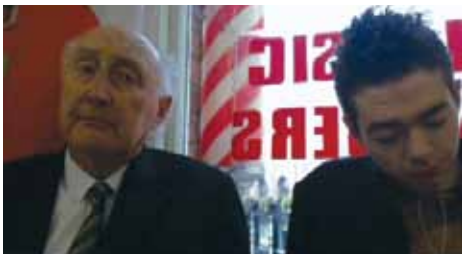
Scene from 'Ray'

Admission Free. Booking essential for all events at relevant library