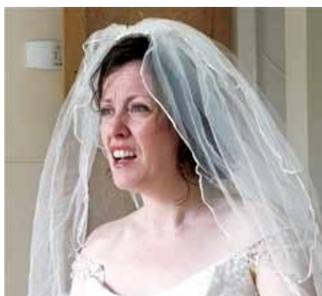
Noah's Wife Missed the Boat

Carnation Theatre's Bealtaine offering is a highly interactive play about inclusivity, about standing up for each other because who we are and what we do is important even if it is just remembering the washing on the line! Noah's Wife Missed The Boat is a parable for the country we live in today, the world is changing but can we keep afloat? Can we weather the storm? Can the raggle-taggle collection of creatures aboard pull together to push our little boat out? Or will the hippo just get drunk and slur on the radio?!!!! As with all Carnation Theatre productions, Noah's Wife Missed The Boat is suitable for audiences of all cognitive abilities with plenty of opportunities to interact and participate. Like the ark, it is packed with bursting with songs, jokes, stories and craic. Bring your own umbrella! Dublin City Arts Office have organised for Carnation Theatre to visit three centres during May (see above).