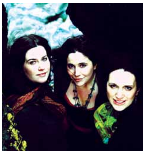
The Henry Girls