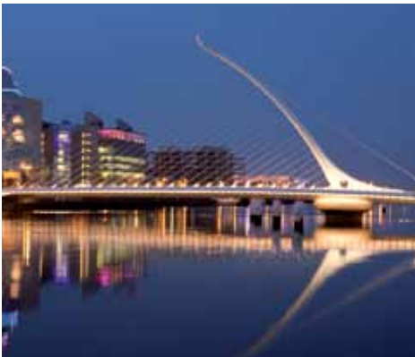
Samuel Beckett Bridge