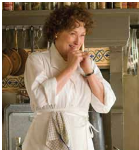
Julie and Julia