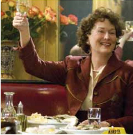
Julie and Julia