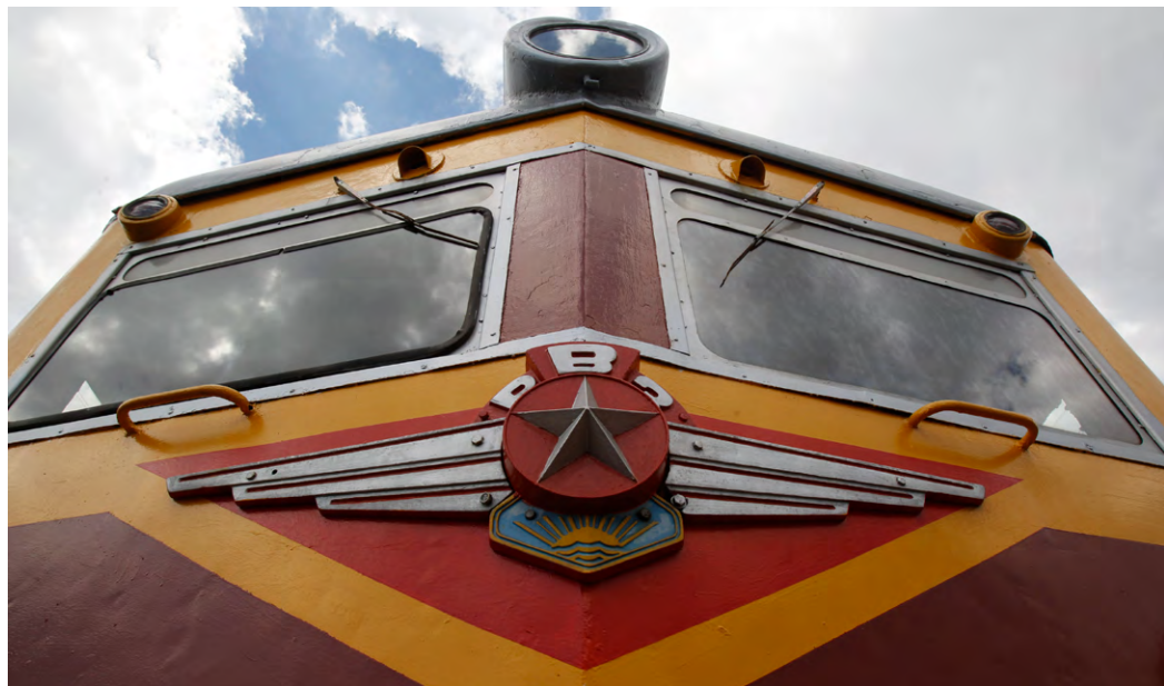
INVESTMENT NEEDED: Russian Railways is seeking billions to upgrade its infrastructure and rolling stock.

But Vladimir Yakunin's statement that neither he nor Russian Railways had a financial interest in FELB is contradicted by statements