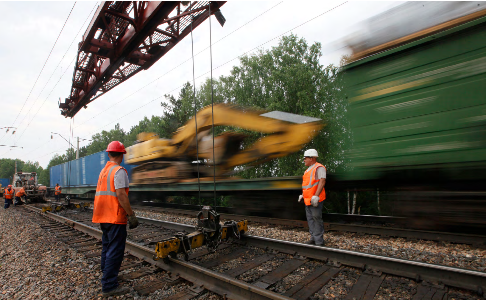
LINE MANAGEMENT: Workers replace track in the Taiga district of the Trans-Siberian Railway, which some envisage as an alternative route for transporting goods from China to Europe.