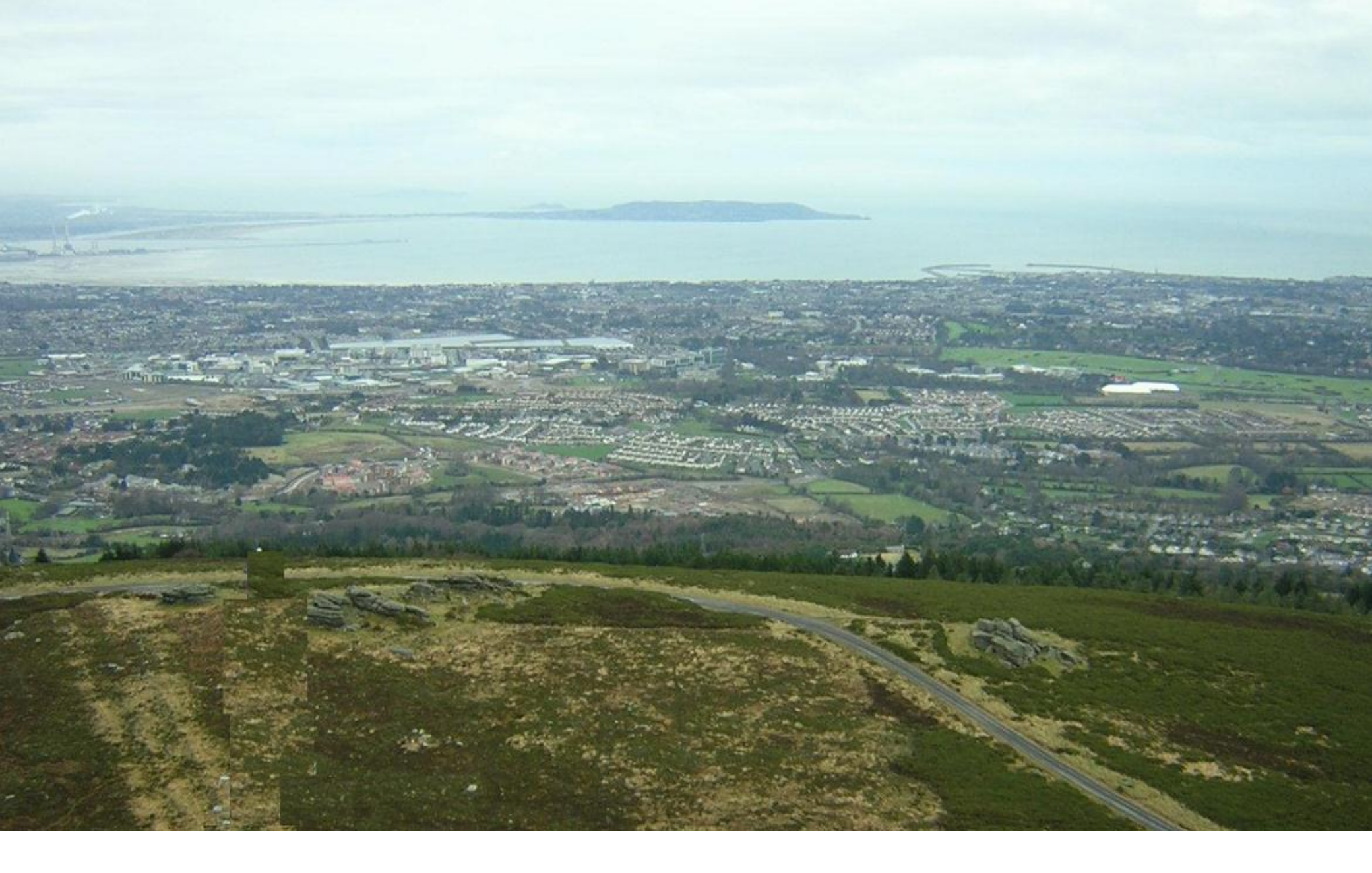
Dublin Bay – the vista from Three Rock to Howth