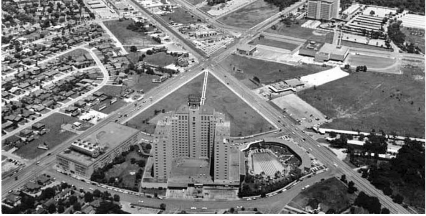
Shamrock Hotel

master of ceremonies for the evening was actor Pat O'Brien, and Dorothy Lamour's radio show broadcast was part of the entertainment for the party. The aspect of the grand opening that endeared the hotel to Houston was McCarthy's inclusiveness. Three thousand guests (including the Hollywood crowd) were invited to the party in the hotel and some 50,000 Houstonians showed up to watch the festivities. The evening evidently became so rowdy that an expletive was heard on the Lamour broadcast and the network cancelled the rest of the show.<sup>19</sup> The local newspapers dripped with stories about the stars, McCarthy, the hotel and anything related to it. Congratulatory ads took up entire pages, and regular ads identified their product with the hotel, capitalizing upon the event.<sup>20</sup> The Shamrock's grand opening was one of its finest hours.