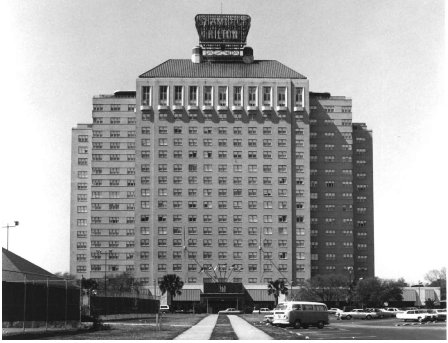
Shamrock Hotel, photo courtesy Metropolitan Research Center.

follow Main Street through the city and south where it turns into State Highway 90 as illustrated in the Houston Freeway Planning Map for 1949.<sup>11</sup>