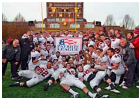
2013–2014 Patriot League Football Champions