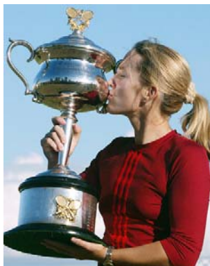
Justine Henin (BEL) Champion 2004