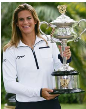
Amélie Mauresmo (FRA) Champion 2006