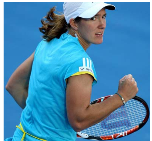
Henin is seven wins away from tying the longest win streak of the millennium - Venus Williams' 35 in 2000.

Rounding out the Top 8 seeds are No.6 seed Anna Chakvetadze , No.7 seed and defending champion Serena Williams and No.8 seed Venus Williams . Chakvetadze is one of the Tour's newest Top 10 players, putting together a breakthrough 2007, which included a