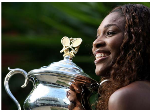
Serena Williams (USA) Champion 2003, 2005, 2007