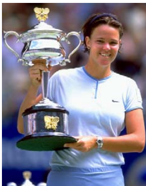
Lindsay Davenport (USA) Champion 2000

Three one-time champions and one three-time champion among those chasing 2008 title glory