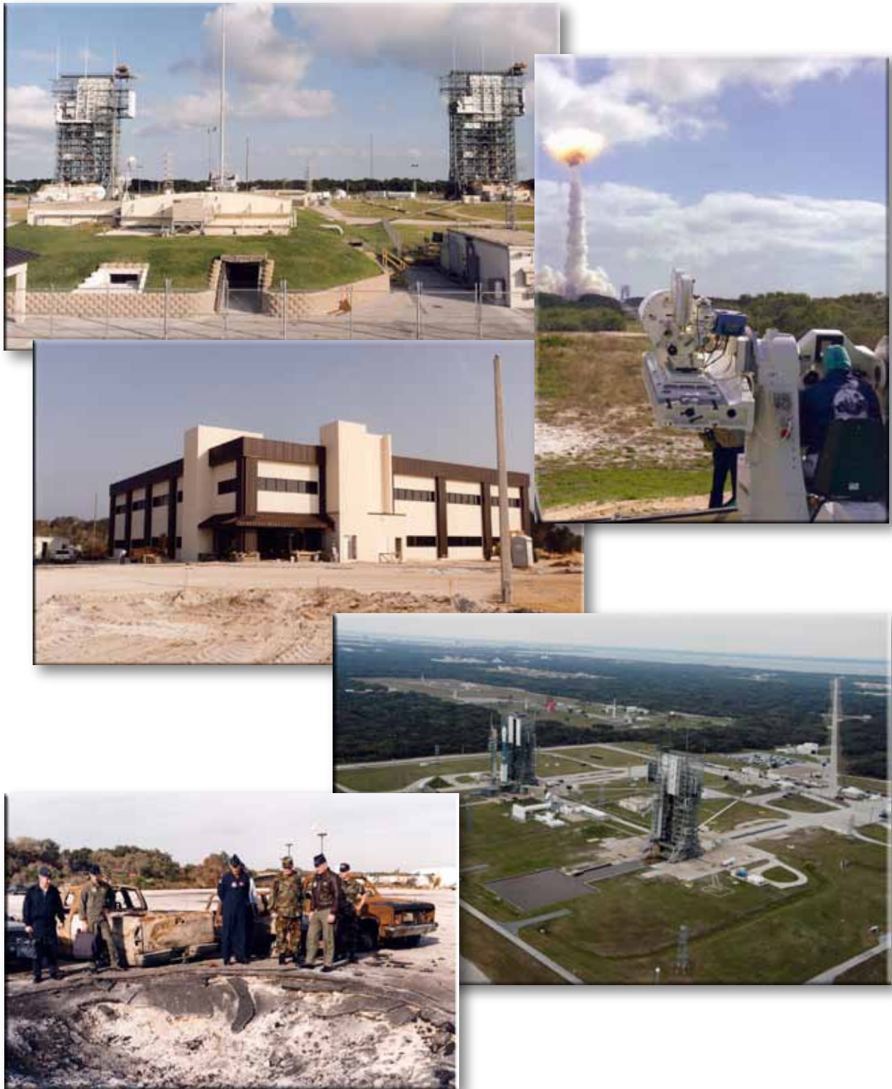
Clockwise from top left: 1) Complex 17 as it appeared on 28 Oct 1996; 2) the DELTA II carrying the GPS IIR-1 spacecraft explodes seconds after lift-off, 17 Jan 1997; 3) an aerial view of Complex 17; 4) Brig. Gen. Hinson (Center) and General Fogelman (2nd on Right) survey impact crater damage during the latter's visit, 14 Feb 1997; 5) 1 SLS Operations Building construction nears completion on 26 Feb 1996.