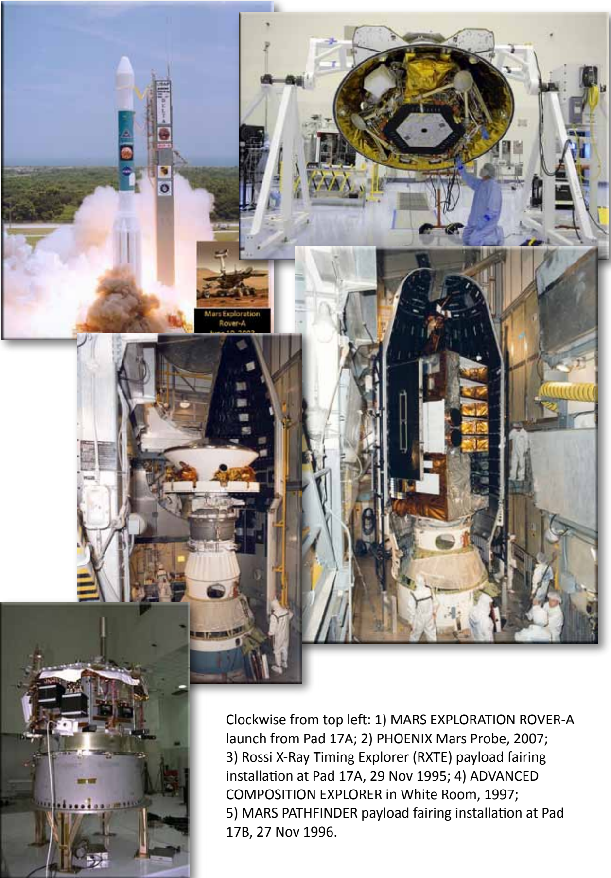
Clockwise from top left: 1) MARS EXPLORATION ROVER-A launch from Pad 17A; 2) PHOENIX Mars Probe, 2007; 3) Rossi X-Ray Timing Explorer (RXTE) payload fairing installation at Pad 17A, 29 Nov 1995; 4) ADVANCED COMPOSITION EXPLORER in White Room, 1997; 5) MARS PATHFINDER payload fairing installation at Pad 17B, 27 Nov 1996.