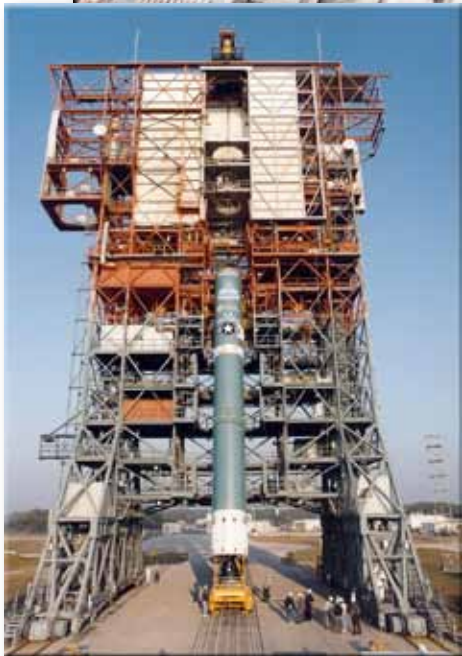
Clockwise from top left: 1) GPS IIR-19 spacecraft and its lift-off from Pad 17A on 15 Mar 2008; 2) 1 SLS Operations Building consoles and displays, 25 Mar 1997; 3) DELTA II GeolITE launch, 18 May 2001; 4) a DELTA II first stage and interstage are erected on Complex 17, 26 Feb 1996; 5) Blockhouse 17 consoles and displays, 25 Oct 1996.