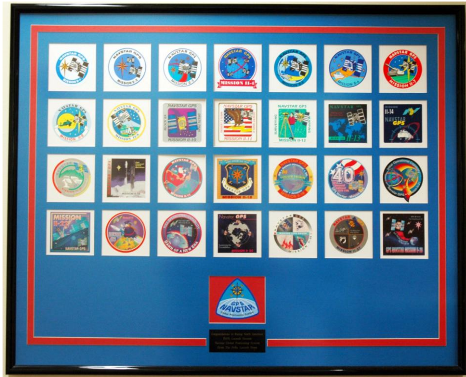
DELTA II NAVSTAR GPS MISSION PATCHES