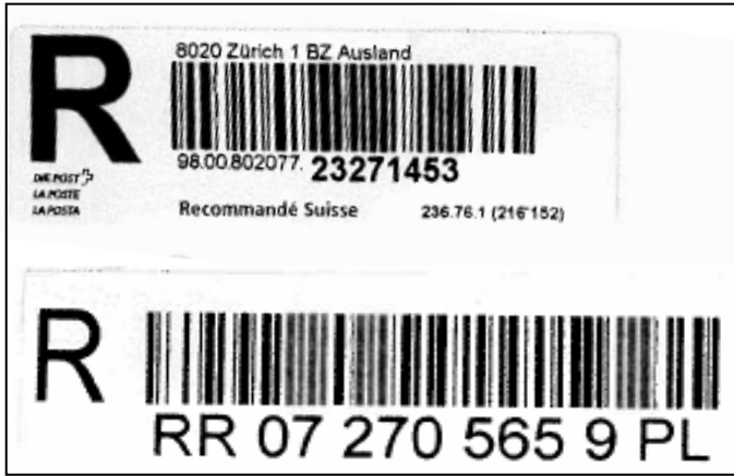
Non S10-format identifier applied at destination

In this case, the destination operator has applied a non S10-format item identifier (98.00.802077.23271453) for internal purposes and has established a cross-reference with the original S10 identifier. If this item had been returned to sender, it would not have been necessary to remove or obliterate the item identifier applied at destination, since it does not use an S10-format.