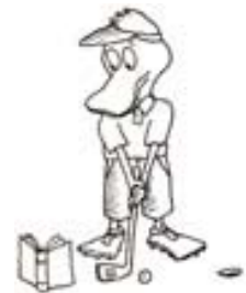
Texas Reading Club artwork © Frank Remkiewicz