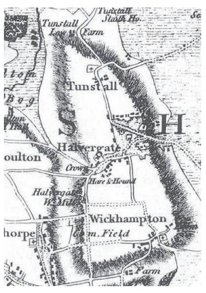
Halvergate and Tunstall on Faden's Map of Norfolk, 1797