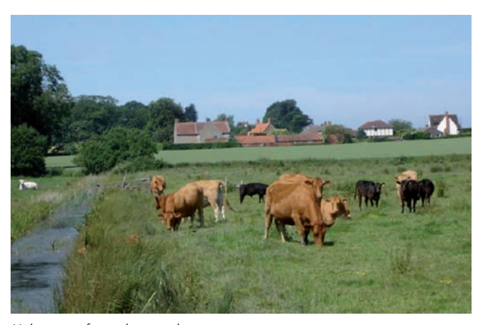
Halvergate from the marsh