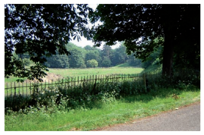
The Sandhole field from The Street

Important landscape features include (a) the curve and gentle fall of the Street, (b) the pond, the small green in front of the Church, (c) the trees round the Church and behind the Pond and Stone Cottage, (d) the trees and extensive grounds of the Rookery, (e) the green round the War Memorial and the Village Sign, (f) the trees bordering the field east of the War Memorial, (g) the trees in the former entrance to the Hall and (h) the trees and grounds of Beechwood.