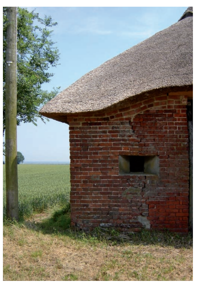
WWII Loophole in Whiteacres barn

The pillbox and Home Guard Post on Marsh Road and the loopholes in the barn at Whiteacres are reminders that in World War II Halvergate was part of the second line of defence in the event of the enemy breaching the east coast defences.