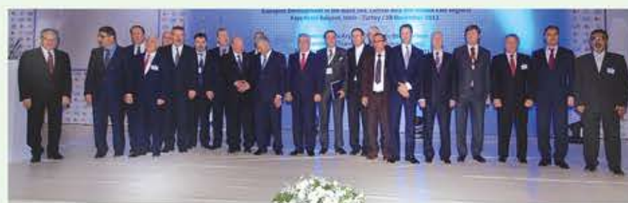
The Ministers of Transport of the BSEC Member States met in Izmir, Turkey, on 28 November 2012.

The project on the development of the Motorways of the Sea in the BSEC region, on the other hand, is about strengthening the maritime links among the ports of the BSEC Member States. The project on the Facilitation of Road Transport of Goods in the BSEC Region and its sub-