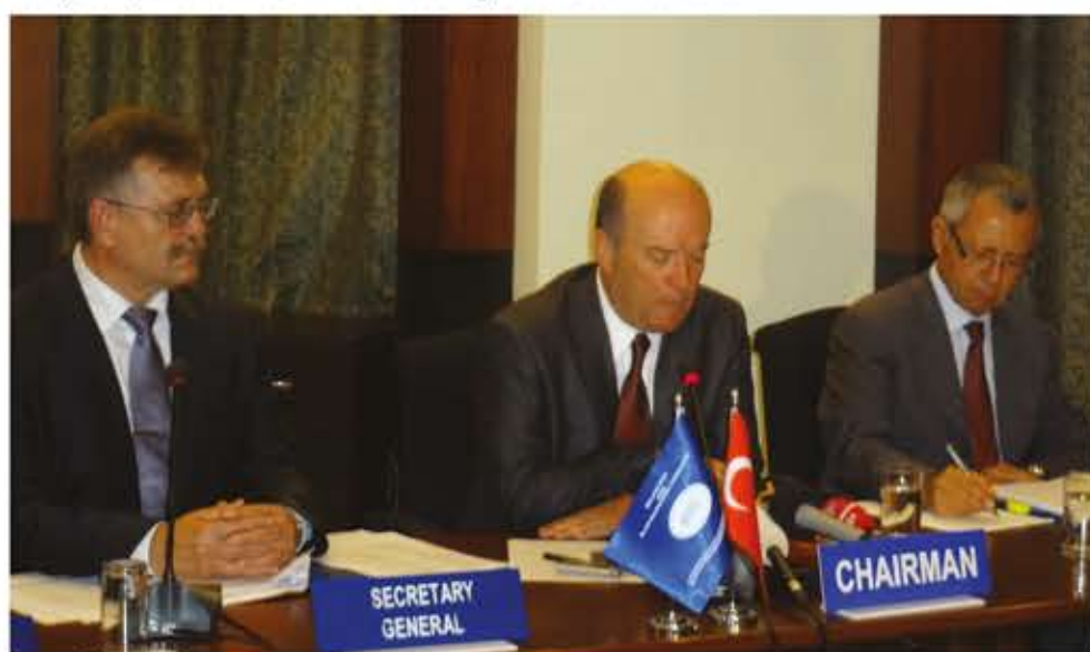
Deputy Minister of Foreign Affairs of the Republic of Turkey H.E. Ambassador Naci KORU announcing the priorities of the Turkish Chairmanship-in-Office of BSEC.

Deputy Minister H.E. Ambassador Mr. KORU underlined that the Turkish Chairmanship will pay special attention to further strengthening cooperation with partners such as the United Nations, the European Union, the OECD as well as with BSEC Observers and Sectoral Dialogue Partners, with the objective to increase the potential of the region. In this context, Deputy Minister H.E. KORU announced the readiness of the Chairmanship to launch the initiative for signing a Memorandum of Understanding with the United Nations Alliance of Civilizations. Meetings of the Ministers of Transport, Ministers of Interior and the BSEC Tax Forum were listed among the highlight events of the Chairmanship. The second training program for Junior Diplomats from the BSEC Member States, the first of which was organized again by Turkey in 2010, was also announced by Deputy Minister KORU. As is known, the Republic of Turkey has assumed the Chairmanship-in-Office of BSEC as of 1 July 2012, for a term of six months ending on 31 December 2012.