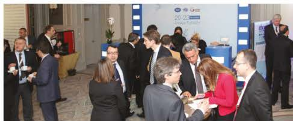
The BSEC Tax Forum held in Antalya, Turkey, on 20-23 November 2012, brought together more than 60 decision makers in tax policy and administration from the BSEC region, tax experts, academia and representatives of international organizations.

The event constituted the first Tax Forum held under the auspices of BSEC. The organizers expressed their hope that from now on it will be organized on a regular basis in the same regional framework. The outcomes of the BSEC Tax Forum were shared with the members of the BSEC Working Group on Banking and Finance at the meeting of the Working Group held on 5 December 2012, at the BSEC Headquarters in Istanbul. All presentations made during the Tax Forum can be accessed from the website of the General Directorate of Revenue Policies of the Republic of Turkey ( www.gdp.gov.tr ).