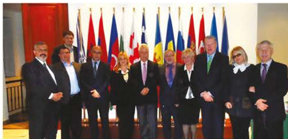
Participants of the enlarged final meeting of the Coordinating Group for the joint BSEC-GIZ project "Legal Framework for a Green Economy within the BSEC Member States - Regional Review and Dialogue on Systems and Perspectives" at the BSEC Headquarters in Istanbul, on 4 December 2012.

As is known, the first joint project between BSEC and GIZ titled the "Legal Framework for a Green Economy within the BSEC Member States" was initiated by the Working Group on Environmental Protection and launched in June 2010. GIZ provided BSEC with a grant for the project's implementation. In the framework of the said project, three thematic workshops were held in succession in Kiev on 17 June 2011, in Baku on 5 September 2011 and in Moscow on 6 March 2012.