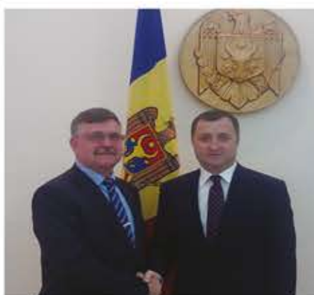
The Secretary General of the BSEC PERMIS Ambassador Dr. Victor TVIRCUN met with the Prime Minister of the Republic of Moldova H.E. Mr. Vladimir FILAT, in Chisinau.

The Secretary General of the BSEC PERMIS Ambassador Dr. Victor TVIRCUN paid a working visit to Chisinau, Moldova, where he met with the President of the Republic of Moldova H.E. Mr. Nicolae TIMOFTI as well as Prime Minister H.E. Mr. Vladimir FILAT and Deputy Prime Minister, Minister of Foreign Affairs and European Integration H.E. Mr. Iurie LEANCA, on 27-30 July 2012.