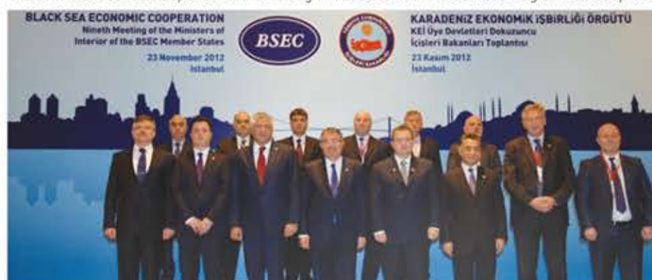
9th Meeting of the BSEC Ministers of Interior was held in Istanbul, on 23 November 2012.

A Network of Liaison Officers on Combating Crime has been established in compliance with the Additional Protocol of 2002. In 2008, the BSEC Regional Action Plan for Strengthening the Criminal Justice Response to Trafficking in Persons in the Black Sea Region was adopted.