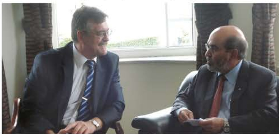
BSEC PERMIS Secretary General Ambassador Dr. Victor TVIRCUN met with Mr. José Graziano da SILVA, Director-General of FAO, at the BSEC Headquarters in Istanbul, on 12 September 2012.

As is known, agriculture is one of the spheres of cooperation in BSEC. In the framework of the vast agricultural potential of the Black Sea region and the wide ranging prospects it offers for agro-industry business, the BSEC Working Group on Agriculture and Agro-Industry was established in 1993.