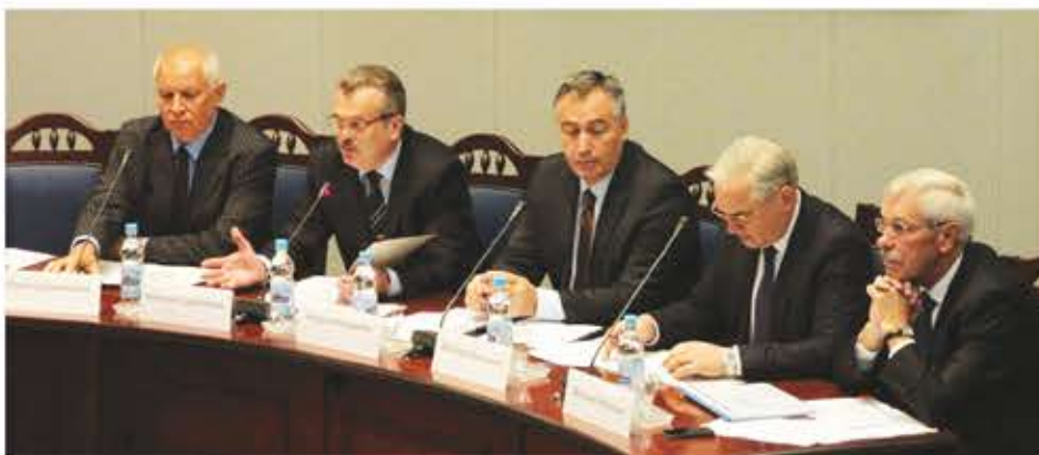
BSTDB presentation to the business community in Ukraine.

Ukraine ranks third in the BSTDB portfolio accounting for 16% of the Bank's signed operations. BSTDB operational priorities in Ukraine include supporting manufacturing, infrastructure,