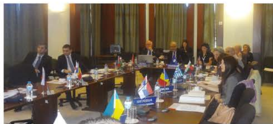
First Coordination Meeting of the Communication Officers of the BSEC Member States for the Implementation of the BSEC Public Communication Strategy, held at the BSEC Headquarters in Istanbul, on 15 October 2012.