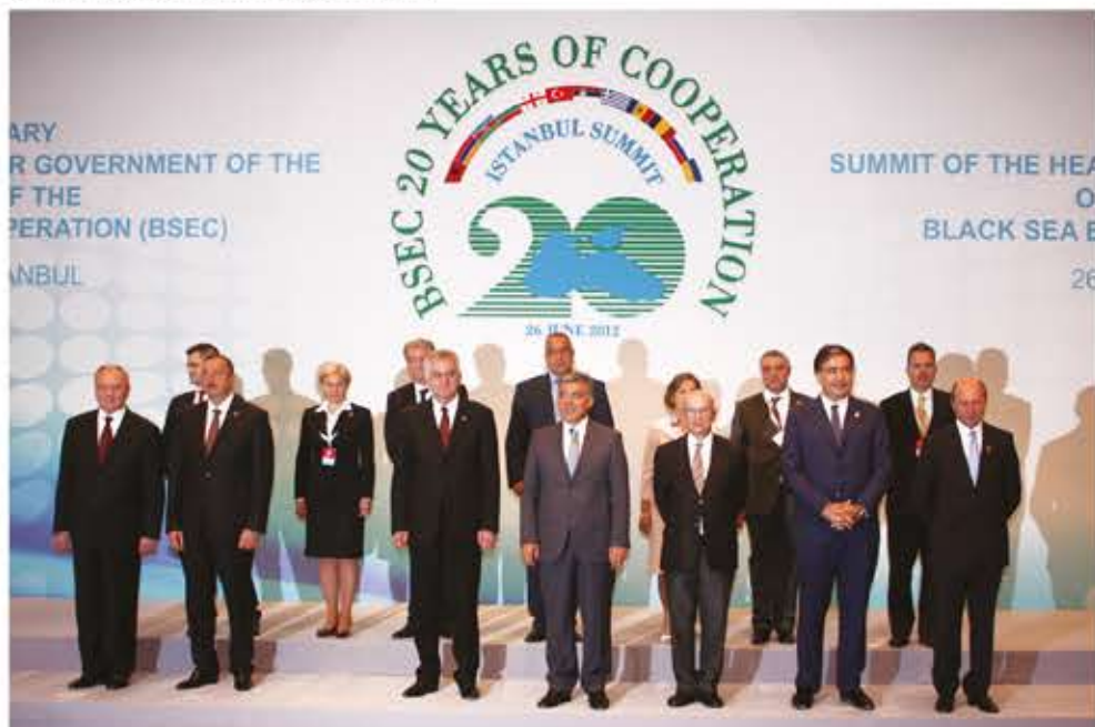
Family photo from the BSEC 20th Anniversary Istanbul Summit on 26 June 2012.

The 20th Anniversary Istanbul Summit also endorsed a new Economic Agenda for the region. More than a decade ago, in 2001, the BSEC Economic Agenda for the Future was adopted. It was designed as a roadmap, outlining the action needed to meet the goals set by the BSEC Charter. A new Economic Agenda Towards an Enhanced BSEC Partnership has been introduced to face the new challenges and opportunities in the global and local environment. The new regional strategy sets goals in 17 priority areas of action and provides recommendations to further strengthen the Organization.