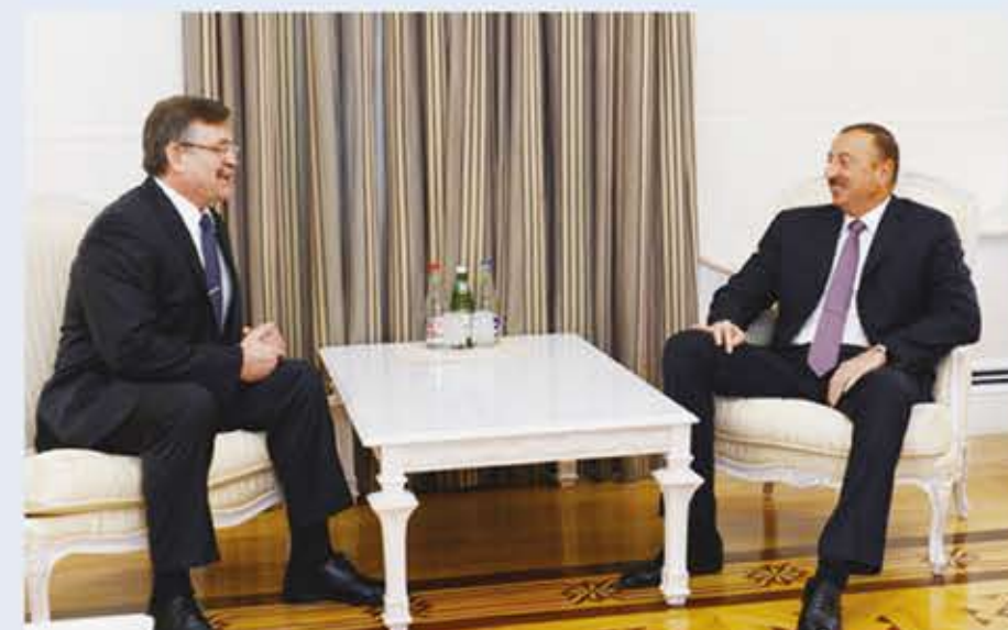
Secretary General received by the President of the Republic of Azerbaijan H.E. Mr. Ilham ALIYEV, in Baku.