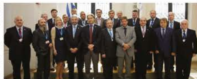
40th Meeting of the PABSEC Legal and Political Affairs Committee was held in Athens on 17-18 October 2012.