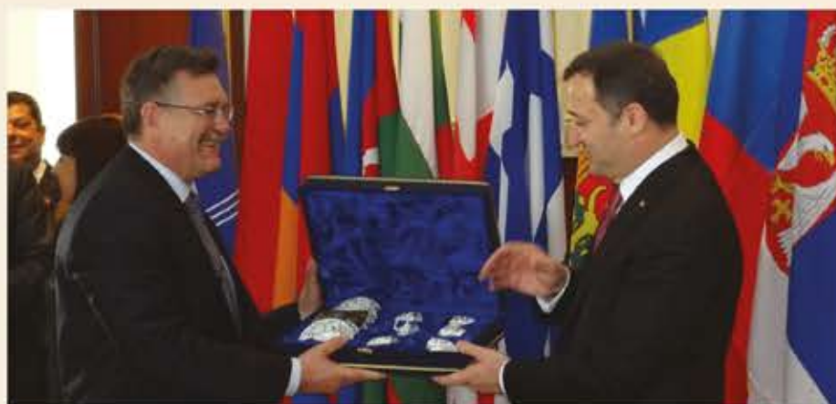
BSEC PERMIS Secretary General presenting a memento to the Prime Minister of the Republic of Moldova H.E. Mr. Vladimir FILAT on the occasion of his working visit to the BSEC Headquarters.

The visit was concluded with a reception hosted by the BSEC PERMIS in honor of Prime Minister Vladimir FILAT at the BSEC Headquarters, with the participation of the representatives of the Missions of the BSEC Member States, Related Bodies, Observers and Sectoral Dialogue Partners in Istanbul.