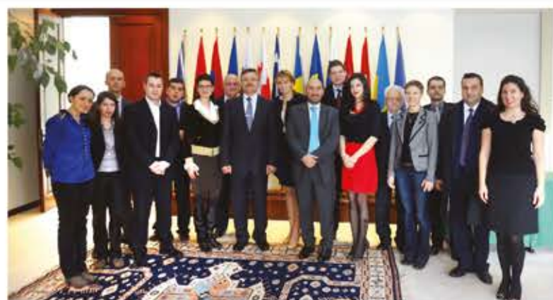
The participants of the 2nd Training Programme for Junior Diplomats from the BSEC Member States visited the BSEC Headquarters in Istanbul, on 30 November 2012.

As is known, a Memorandum of Understanding was signed in 2007 with a view to develop cooperation among the diplomatic academies and institutions of the Ministries of Foreign Affairs of the BSEC Member States, in accordance with Article 23 of the BSEC Charter. The Memorandum covers organizing training programmes, granting scholarships and exchanging trainers and trainees on a reciprocal basis for diplomats. The document aims at contributing to the career development of diplomats and experts working in the field of international relations and thus promotes understanding and mutual trust among the Member States.