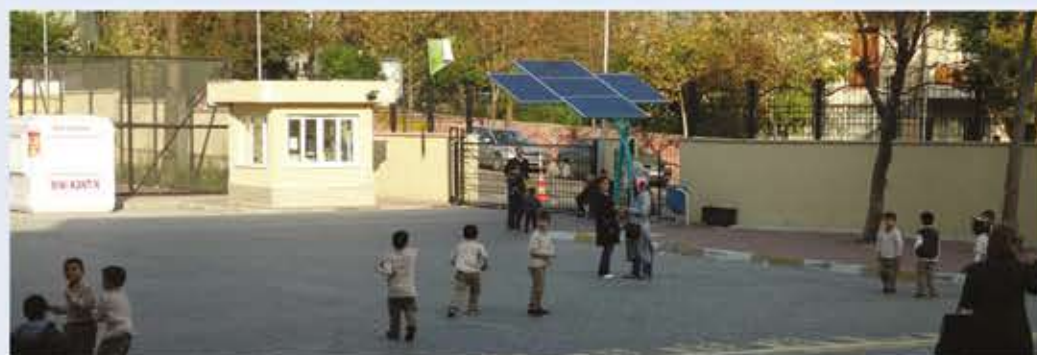
The Kazim Karabekir School in Istanbul where a solar panel system has been installed at the roof and a "Solar Tree" in the school's yard in the framework of the "Energy Efficient Smart School" project funded by the BSEC-HDF. The Solar Tree is intended to promote the use green energy among students, staff, parents and visitors.

More information on the BSEC-HDF is available at www.bsecprojects.com or by sending e-mail to kzaimis@bsec-hdf.org .