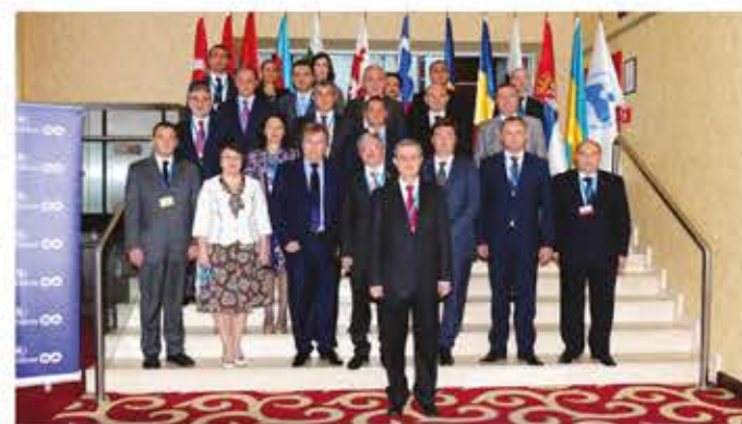
39th Meeting of the PABSEC Economic, Commercial, Technological and Environmental Affairs Committee in Ankara, on 17-18 September 2012.