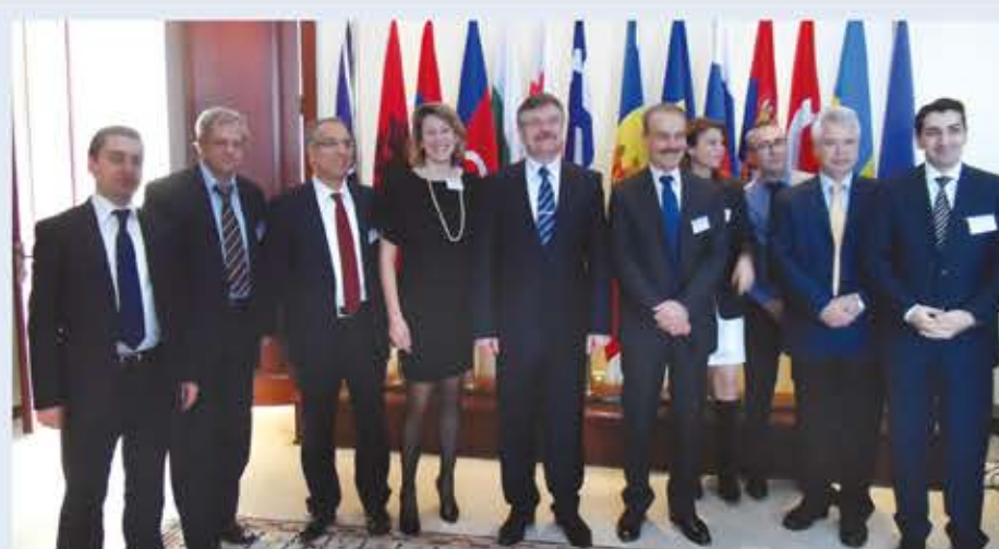
Joint BSEC-France-BRAF Seminar on "New Audiovisual Broadcasting Technologies and the New Economic Models Arising from Them" held at the BSEC Headquarters, on 3 December 2012.

France, on the other hand, as a BSEC Observer, organized a seminar jointly with BSEC and the Black Sea Broadcasting Regulatory Authorities Forum (BRAf) on "New Audiovisual Broadcasting Technologies and the New Economic Models Arising from Them" on 3 December 2012, at the BSEC Headquarters in Istanbul. During the BSEC-France-BRAF Seminar, participants made presentations and discussed different aspects of the present state of affairs, including the legal, technical and financial aspects of the analogue to digital switchover. Participants also exchanged experiences and best practices and addressed the opportunities for cooperation.