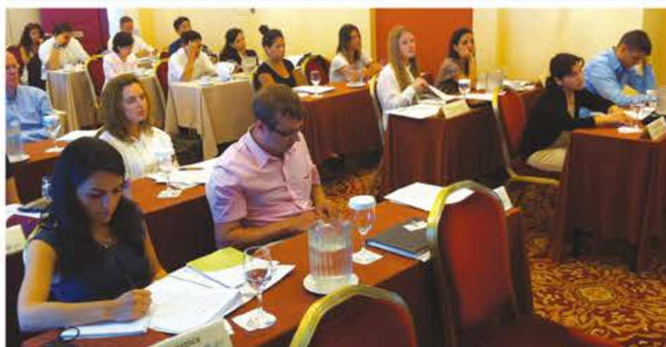
ICBSS 5th International Black Sea Symposium in Athens.

On 2-4 July 2012, the ICBSS successfully organized its 5th International Black Sea Symposium on "The Black Sea region as an influential crossroad between East and West: A path towards extroversion" in Athens, Greece. Fifteen young professionals from the Black Sea countries, the EU Member States and the US attended an intensive three-day course where 22 renowned international experts addressed a wide spectrum of issues, such as energy efficiency, environmental governance, security, innovation, science technology, economic relations, culture and education that currently form the framework within which many cooperation schemes and synergies have been promoted.