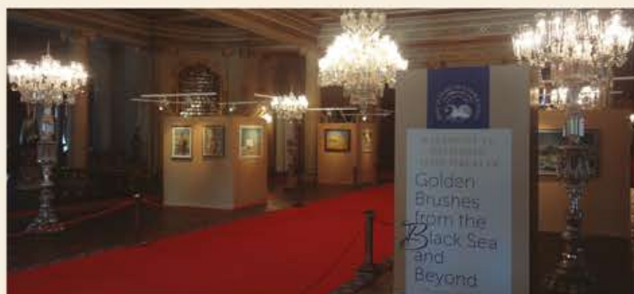
"Golden Brushes from the Black Sea and Beyond" painting exhibition was viewed by more than 30 thousand visitors.

Sabancı Museum and Akfen Holding. While the exhibition underlined the deeply-rooted and rich tradition of art and culture that is a part of the shared identity of the region, it also aimed to emphasize the unifying role of this tradition among the countries and peoples of the region which has undergone political and socio-economic turmoils during different periods of history.