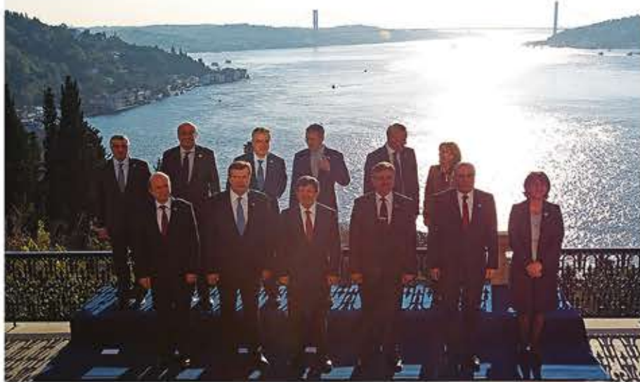
The 27th Meeting of the BSEC Council of Ministers of Foreign Affairs was held on 15 December 2012, in Istanbul, under the Turkish Chairmanship-in-Office.

The 27th Meeting of the BSEC Council of Ministers of Foreign Affairs was held on 15 December 2012, in Istanbul. H.E. Prof. Dr. Ahmet DAVUTOĞLU, BSEC Chairman-in-Office and the Minister of Foreign Affairs of the Republic of Turkey, chaired the meeting. The representatives of the BSEC Member States, as well as BSEC Related Bodies, Observers and Sectoral Dialogue Partners participated in the meeting. The Ministers exchanged views on issues of common concern to the region. In their statements, they highlighted the need to continue the ongoing reform efforts to further increase the efficiency, effectiveness, visibility, institutional capacity and human resources of BSEC, its Permanent International Secretariat and Related Bodies.