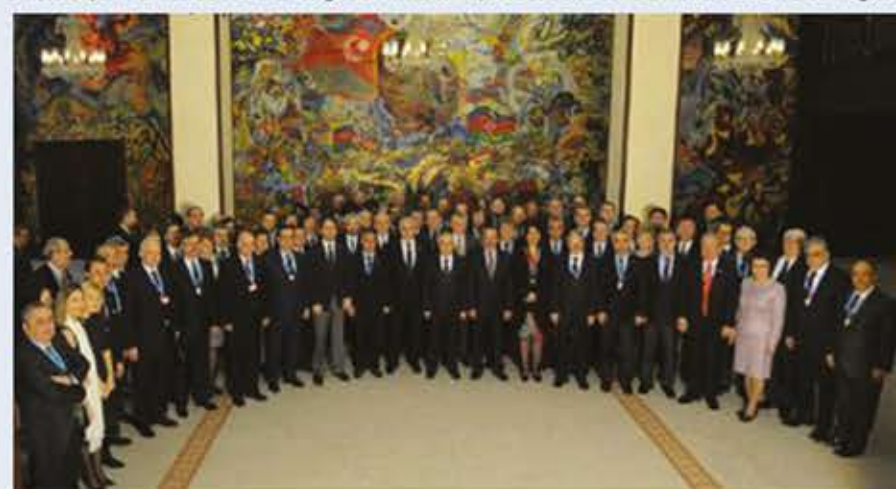
40th Plenary Session of the PABSEC General Assembly in Baku.

Concurrently with the PABSEC General Assembly, the "Black Sea Trade and Investment Forum - 3 Baku 2012" was organized by the Confederation of Businessmen and Industrialists of Turkey (TUSKON) on 26 November 2012, bringing together business circles, parliamentarians and government representatives from the Black Sea region.