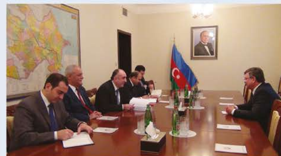
Meeting with the Minister of Foreign Affairs of the Republic of Azerbaijan H.E. Mr. Elmar MAMMADYAROV.