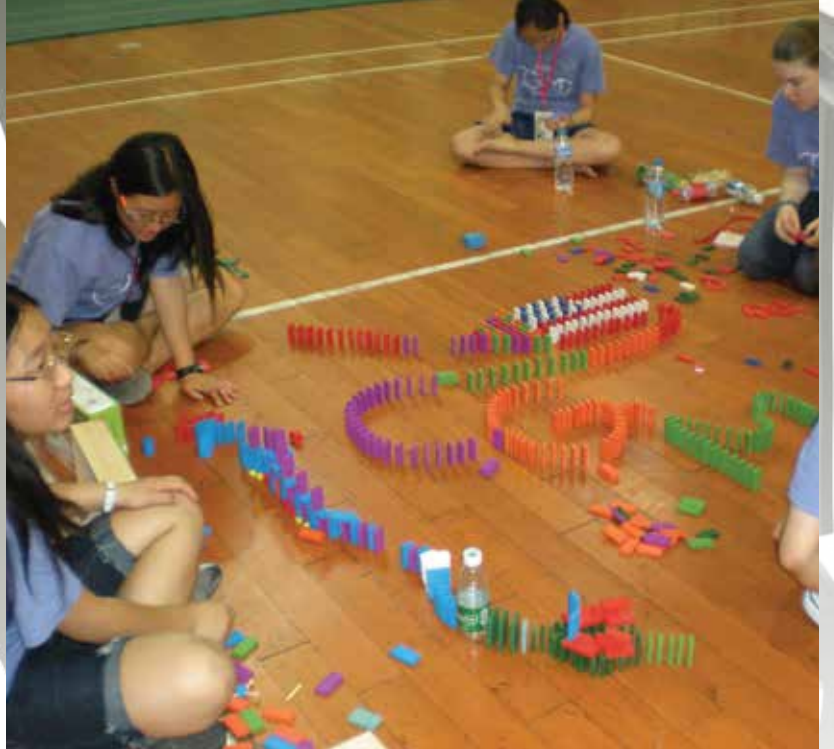
Left: Punting down the River Cam with friends from EGMO Right: Lining up tiles for the domino competition at CGMO

Cam, and feasting on authentic fish and chips—could all be a consequence of doing math? The best part, though, is the lasting friendships—cliché, maybe, but utterly true.