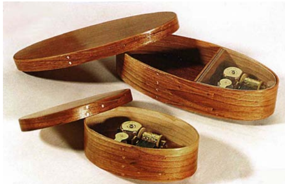
Music Box Kit, #1 (foreground) and Presentation