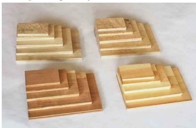
Sets of #0-4 Bands (left) and Boards (right)