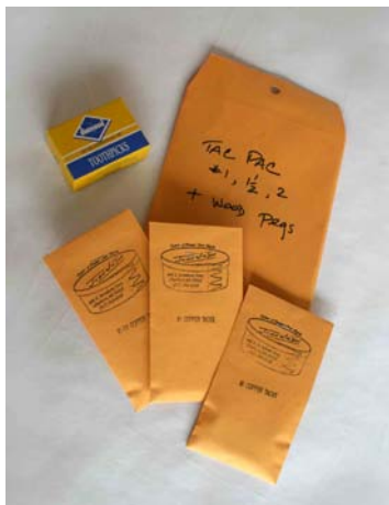
Tac Pac with pegs

SMALLER RIVET (round head x 1/2" long with washers, 24 count pkg.) SDL style carriers & very small sizes ..... $5.00/box