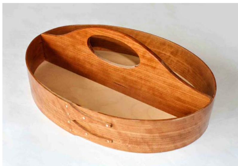
#7 Divided Carrier

Our open invoice system and payment: Your materials are sent to you with an invoice detailing your items. The total amount is due upon receipt. You enjoy the benefits of doing business “The Old Fashioned Way” by viewing your purchases before sending your personal check or money order. Please call for international payment details. Add 6% sales tax for materials sold in Michigan.