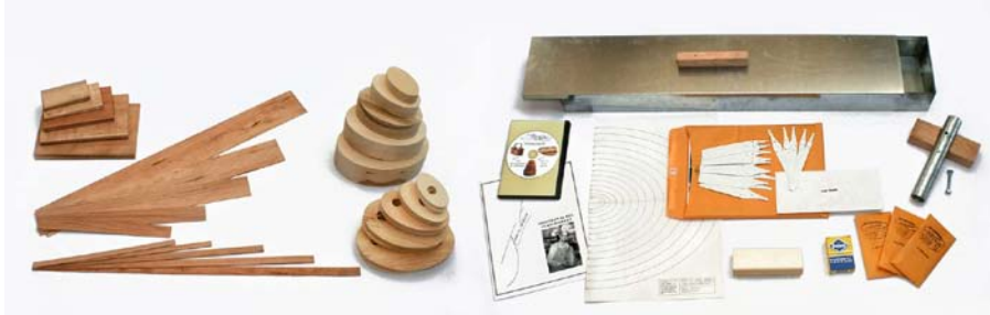
Getting Started Set - Save $50

Take $50 off when ordering getting started set : One set of five cherry or maple bands, one set of five cherry or pine tops and bottoms, size #0 - #4 cores, shapers and fingers, 32" galvanized water tray, pipe anvil, sanding block, one tac pac and one DVD SPECIAL OFFER - regularly $291.75, now $241.75*+ S/H.