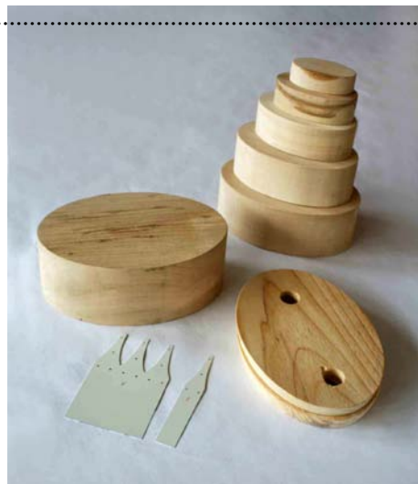
#0-4 Cores, Shapers and Finger Patterns