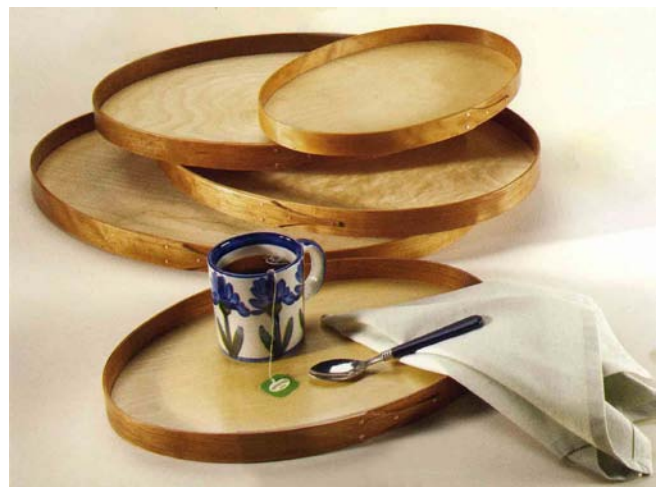
Shaker Oval Trays #7 -- 11