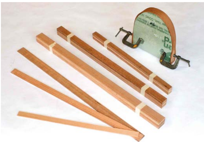
A, B, and C - Handles for Carriers

Oval trays are made according to the pdf you can download [oval trays]. Tray bands are 1 3/8" wide in sizes #7 through #12. Order bottom boards listed above for the corresponding box size, or use 1/4" birch plywood as shown in the oval tray article (60% cost of cherry boards). The 1" rigid foam board form is used for both the bending form and for drying after tacking.