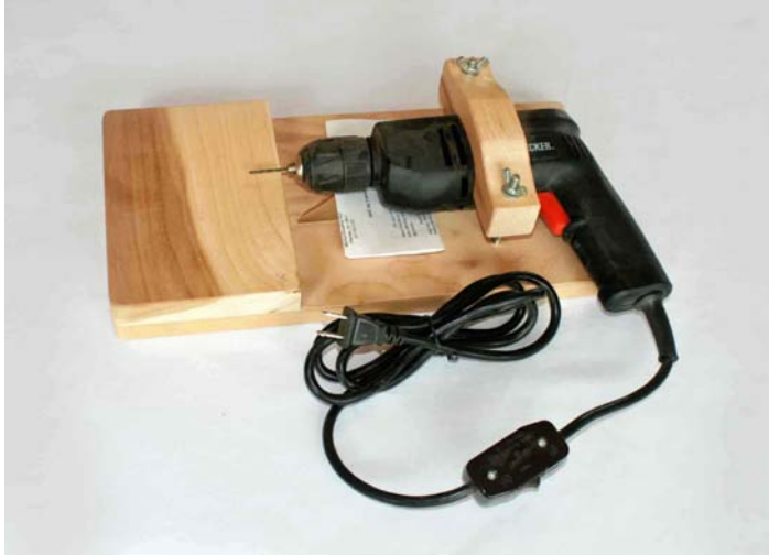
Drilling Jig for peg holes