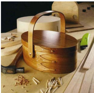
Swing Handle Carrier Kit