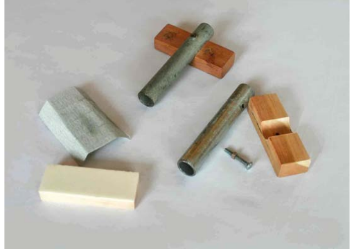
Anvils and Sanding Block

The custom drilling jig will accurately drill 5/64" holes for the wood pegs used to secure the oval top and bottom board in the Shaker box. The wood pegs are made by cutting a box of toothpicks (sold below) in half to produce 500 pegs. It also is used to drill the 1/16" holes for the copper shoe pegs as an alternative to wood pegs. (How to use a drill press for drilling perimeter holes is given in "Making Oval Boxes" pdf available to download from our web site.) The drill jig comes with a line switch for convenient operation with the trigger on the lock position.