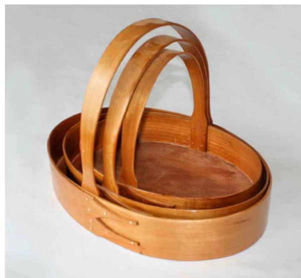
#6-7-8 Fixed Handle Carriers

Both the divided #7 carrier and the three #6-7-8 fixed handle carriers shown above make attractive and functional projects very much in the Shaker tradition. They are part of our inventory of materials as well as included in the pattern packet of information.