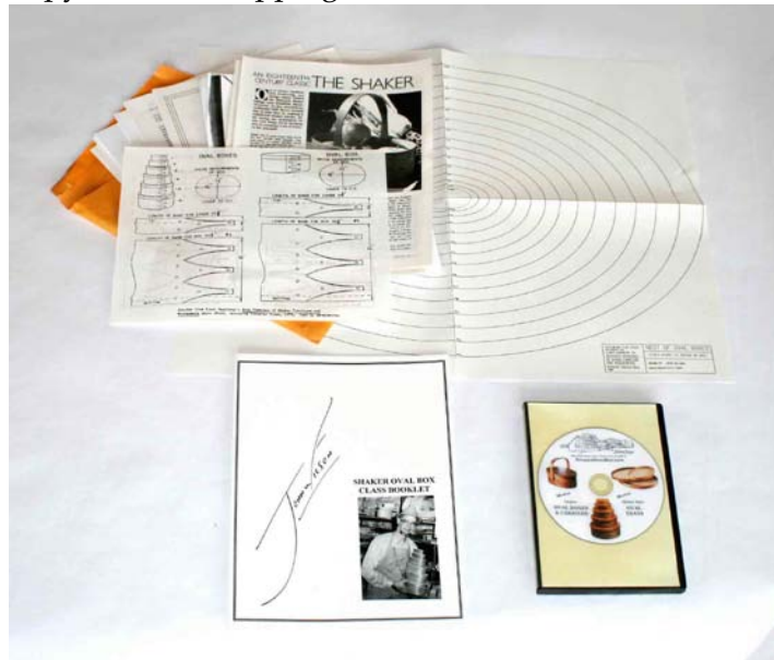
Special Offer DVD with Pattern Packet and Class Booklet

Our goal to manufacture quality box making supplies and provide concise and accurate information to enable you to make historically authentic Shaker oval boxes. You have been introduced to our inventory of box making supplies. Illustrated in this photo are the basic information sources for making a whole range of oval box projects.