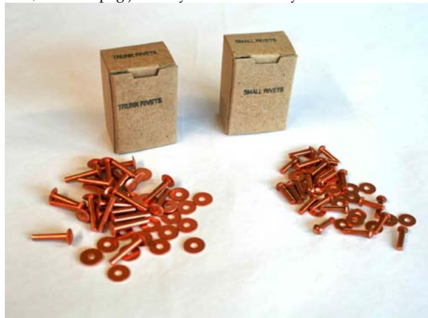
Trunk Rivets (l.) and Small Rivets (r.)

Copper tacks are the hallmark of a Shaker box. We manufacture nine sizes on 150 year old machines obtained from the W.W. Cross Co. in 1991 when they ceased operations. Several of our sizes (the #3/4, the #2 1/4, and the fixed handle tack) have been made by us specifically for the oval box trade, along with the copper shoe peg that went out of production when shoemakers stopped hand making shoes. We sell packages with one ounce (small sizes are the same approximate count as larger, but weigh less), and a collection called the TAC PAC with wood pegs to make about 80 boxes. We sell tacks in one pound quantities, and half-pounds at 1/2 the price plus $5.