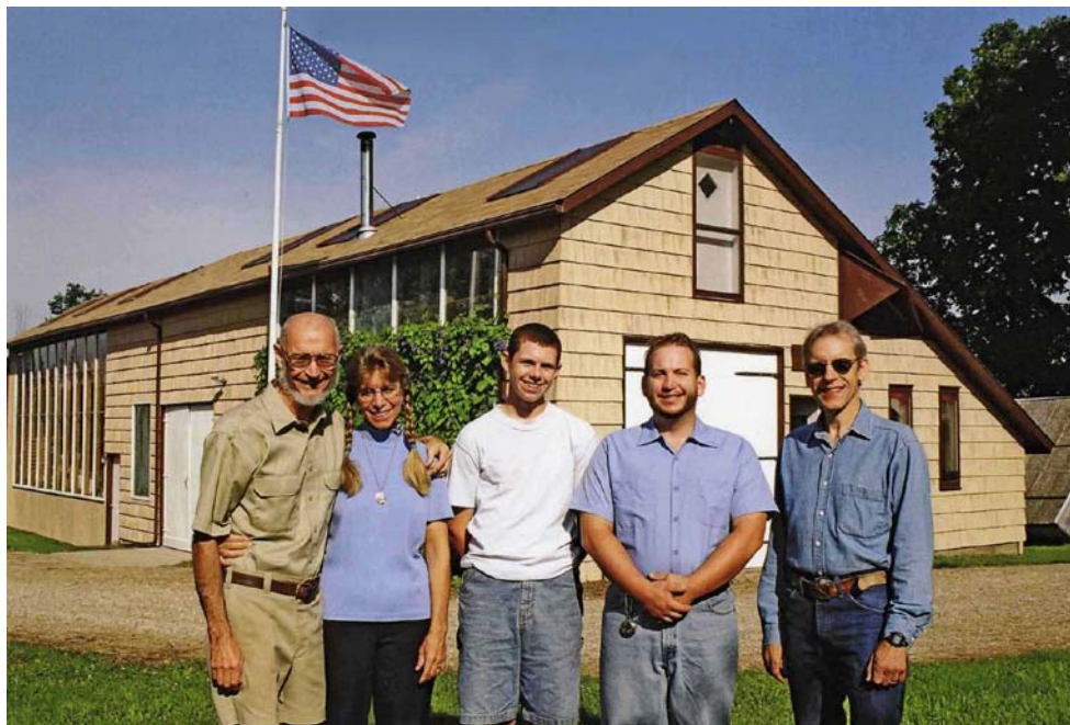
Home Shop and Staff in Charlotte, Michigan

We provide instructional materials for you to learn at home. A good way to start is to order our special offer DVD with the class booklet all students receive, plus our pattern packet of plans and instructions for the full range of sizes and styles that we offer. However you begin, know that you can call us with questions and receive helpful advice.