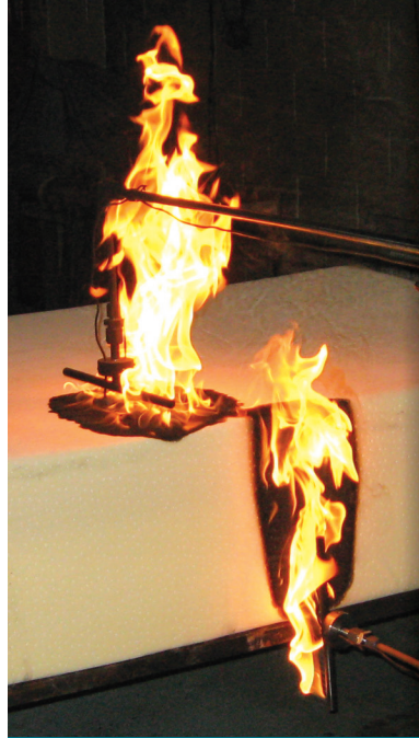
Beginning of test

Full-scale open flammability testing of cotton velour mattress cover made with Basofil.