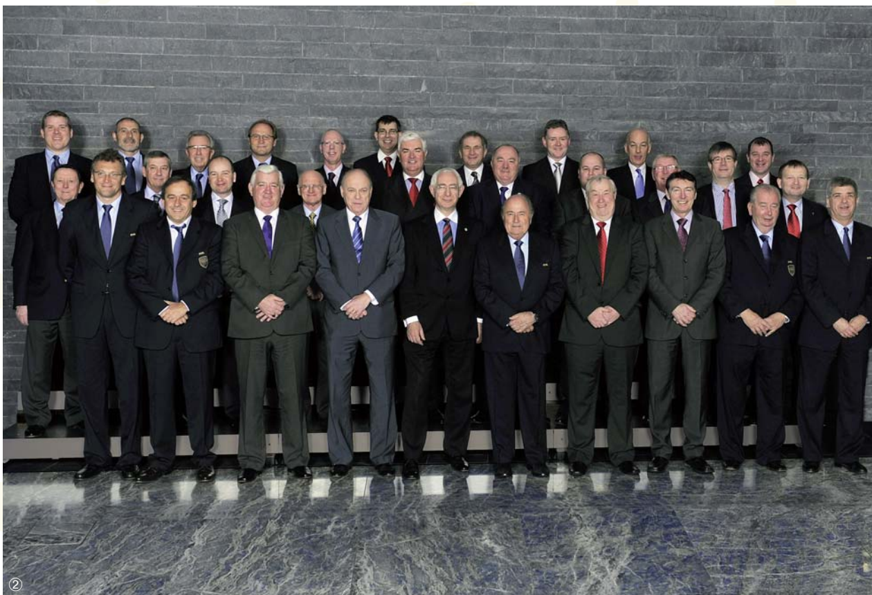
1. 1986 The 100 th anniversary of the IFAB in Mexico City 2. 124 th IFAB meeting, Home of FIFA, Zurich, Switzerland