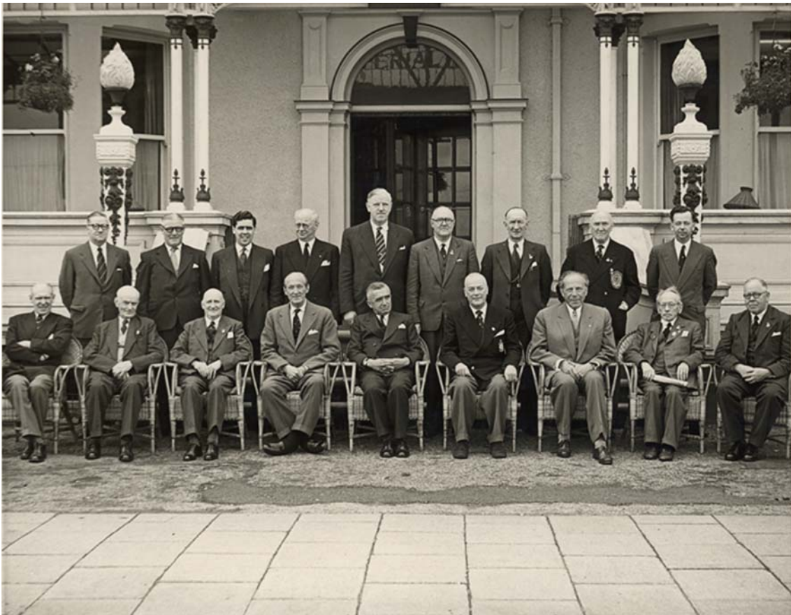
1956 IFAB meeting in Llandudno, Wales