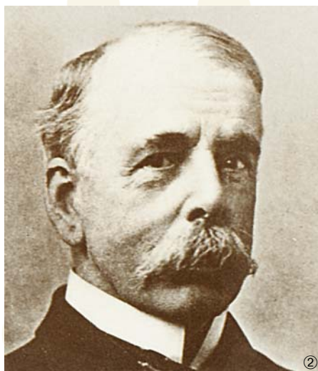
The founding members of the IFAB in 1886