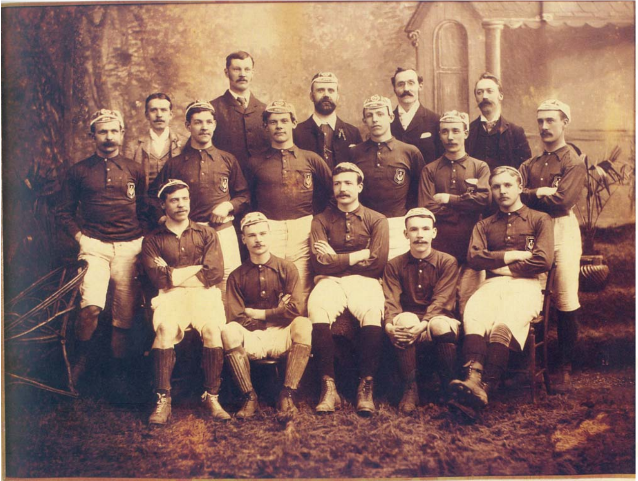
England v. Scotland, 1872, the first official football international.