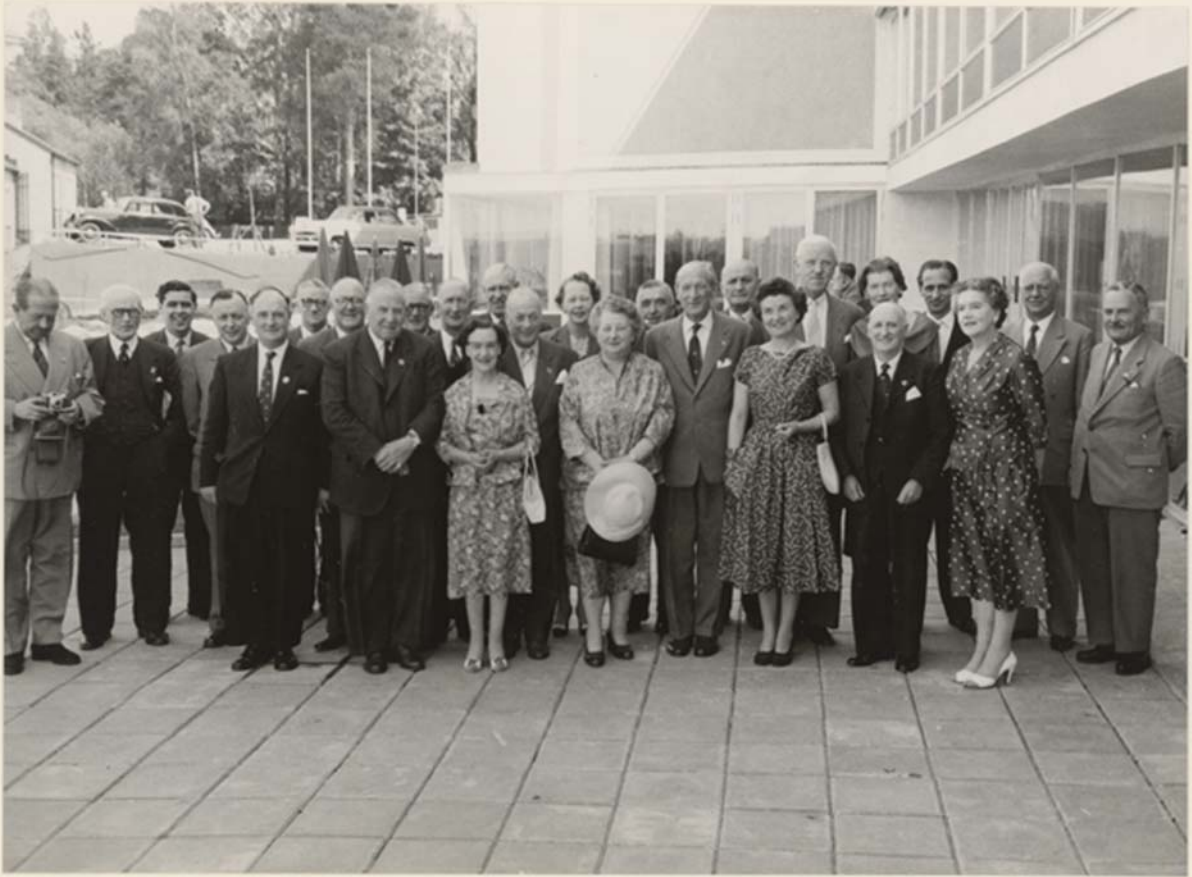
1958 IFAB meeting in Stockholm, Sweden

One such example was the 35-yard line used in the old North American Soccer League in the late 1970s in front of which no offside was given. The system was quickly shown to be flawed. In the 1990s, the Board gave the go-ahead to experiments for throw-ins to be replaced by kick-ins, another proposal that did not progress far.