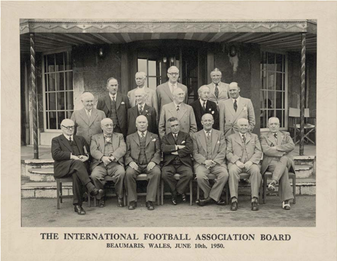
The International Football Association Board, Beaumaris, Wales