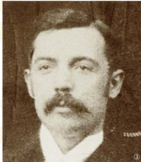
3. C.W. Alcock, Secretary of The Football Association