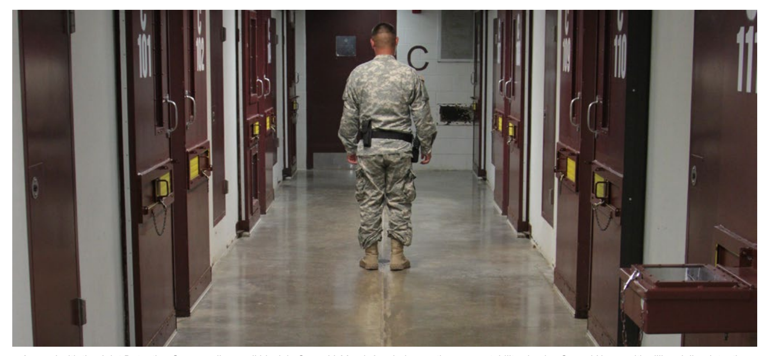
A guard with the Joint Detention Group walks a cell block in Camp V, March 25, during routine accountability checks. Camp V is a multi-million dollar detention center modeled after a correctional facility in the United States. The camp houses the JDG's non-compliant detainee population.

Editor's note: This is the first of a three part series . The identification of soldiers operating in the Joint Detention Group has been omitted due to operational security.