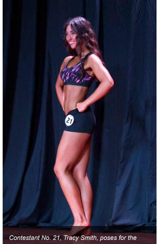
judges and hundreds of spectators during her fitness routine.