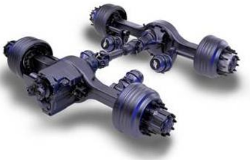
“Live Tandem” – Two Driving Axles