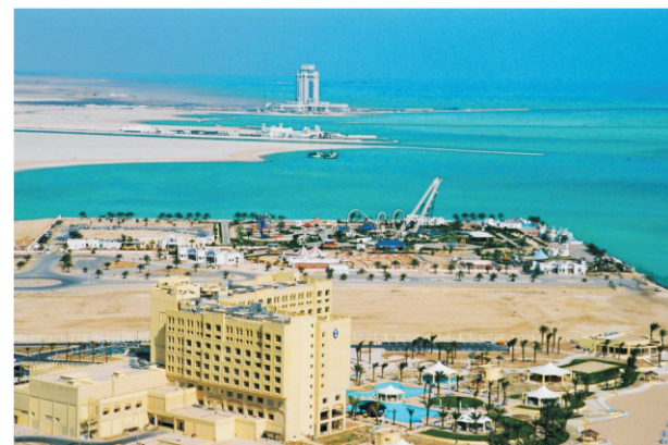
Photo D.1 : Doha North - 'Aladdin's Kingdom' Park, Intercontinental Hotel and Ritz Hotel

The South Corniche lies under the aircraft approach to Doha International Airport's main runway. A new terminal has recently been completed, offering a wide range of facilities including a duty-free shopping area, coffee shops, hotel desks and banks. Qatar Airways Group plans to invest a further USD750 million in the continued expansion of the airport. The new