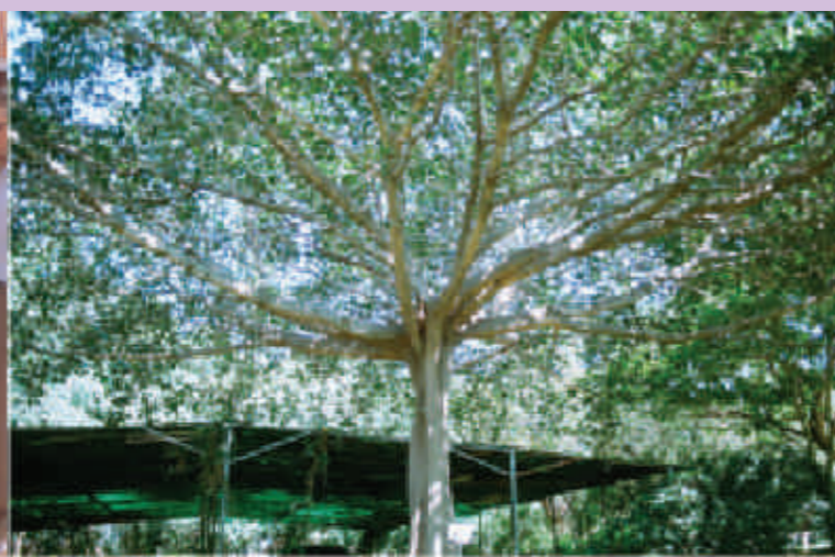
The banyan tree today...