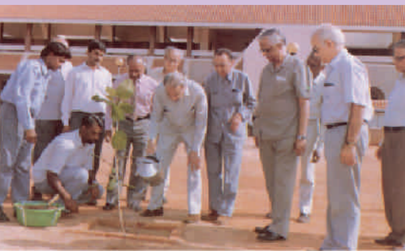
Sri JRD Tata planted a banyan sapling in the campus on 19 th March 1993.

NIAS has an active programme of public lectures, regional, national and international conferences, symposia and seminars organized independently or jointly with other institutions, that focus on topical areas of research and public concern.