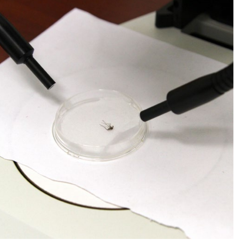
After placement of traps around the installation, members of the Preventative Medicine Department collect, examine and catalogue various species of insects, particularly mosquitoes, to identify potential disease carriers in the area.

Have you had annoying mosquitoes biting you during PT, cookouts or just being outside in general? If you have, then you are probably wondering what attracts mosquitoes, why are some people bit more than others, or what can I use to keep mosquitoes away?