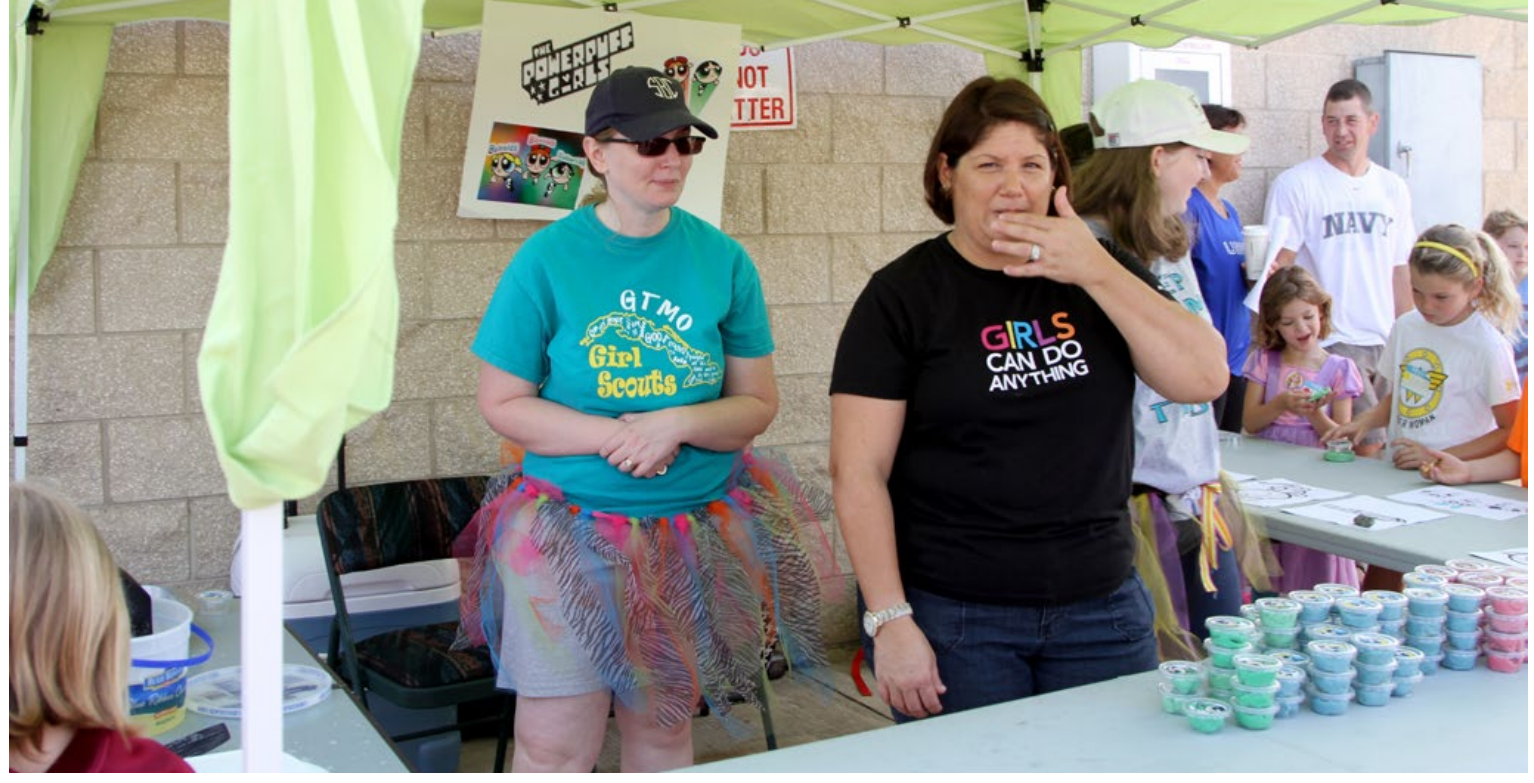
Girl Scout Cadette troop leaders passing out Play-Doh during Super Heroes Field Day, held at Cooper Field May 2. The Girl Scout troops volunteer their free time to the community in order to give back and show their support.

U.S. Naval Station Guantanamo Bay and Joint Task Force Guantanamo offer many opportunities for service members and civilian employees here to volunteer their time to help the community.