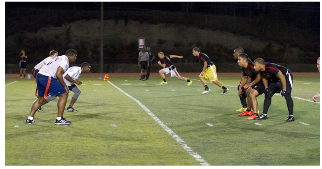
The Confusions and the Militia face off during their game at Cooper Field here, Monday at 8 p.m. The Confusions defeated the Militia, 18-0, improving their league standing from No. 3 to No. 2 overall.

The focus of our sports articles lately has been on the ever exciting Morale, Welfare & Recreation Softball Leagues, so we wanted to switch things up this week, taking a look at the Flag Football League games that have been kicking off just across the track.