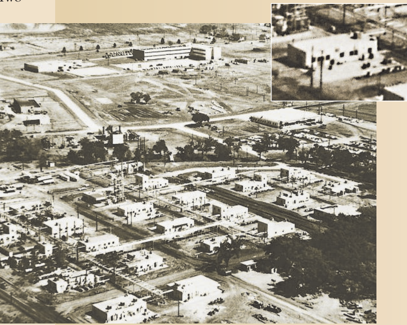
The Phillips Research Complex, Bartlesville. Inset shows the site of the development of polypropylene.