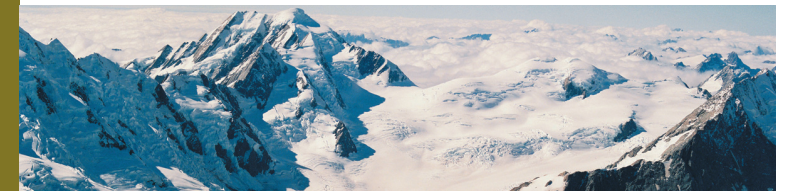
Tasman Glacier, New Zealand

Communities can then apply to use their respective place name as a website, for example, www.koonwarra.vic.au . These websites are "one-stop shops" for all information relating to the local community.