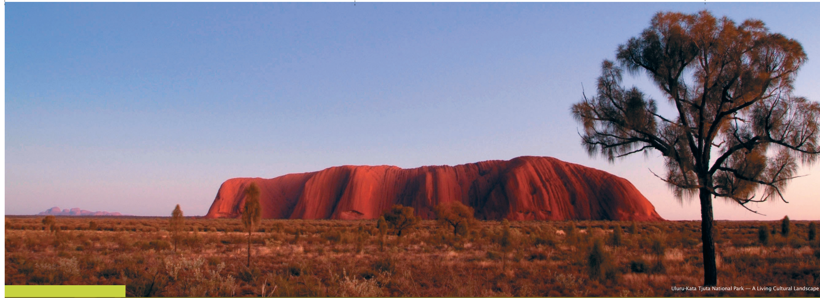
Uluru-Kata Tjuta National Park — A Living Cultural Landscape