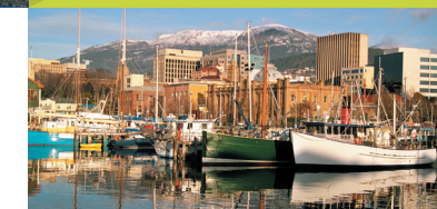
Sullivans Cove, Hobart, TAS

New Zealand and each Australian state and territory — including our Antarctic areas of interest — has a place name registrar, naming board or committee for approving or registering names. However it is the Committee for Geographical Names of Australasia (CGNA) that coordinates place-naming activities across Australia and New Zealand.