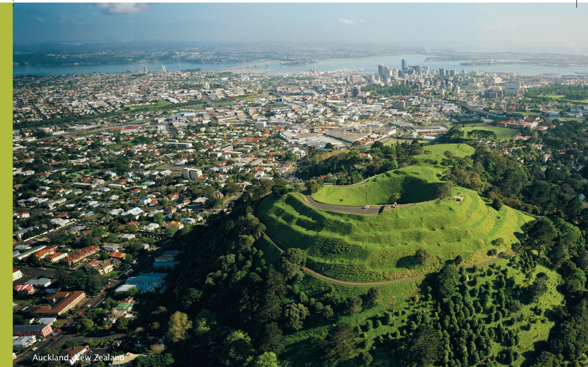
Auckland, New Zealand

We all use place names everyday to describe our surroundings, where we're going or where we've been.