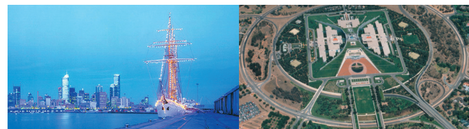
Docklands, Melbourne, VIC Parliament House, Canberra, ACT

Through CGNA, Australia and New Zealand participate in the activities of the United Nations Group of Experts on Geographical Names (UNGEGN) and contribute to world best practice in the management of place names.