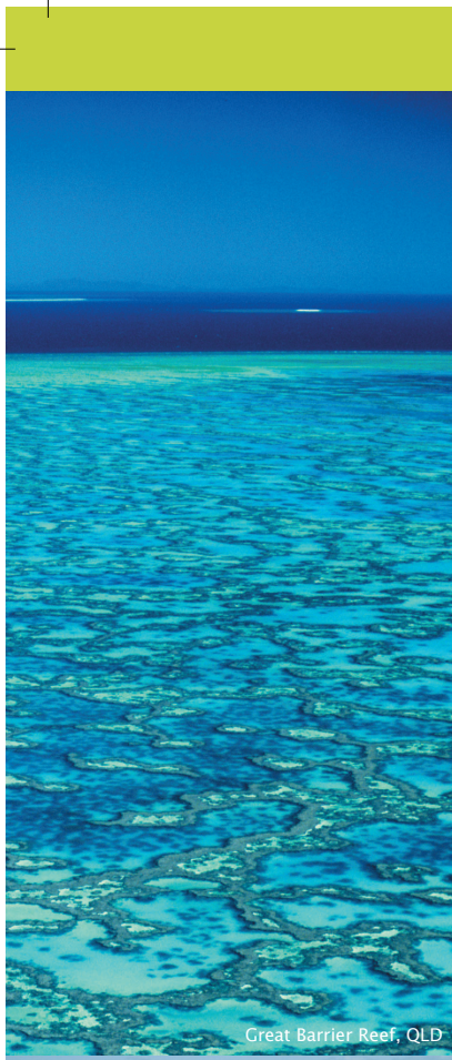
Great Barrier Reef, QLD

Whatever their status and origin, place names will continue to be preserved as records of our history and culture.