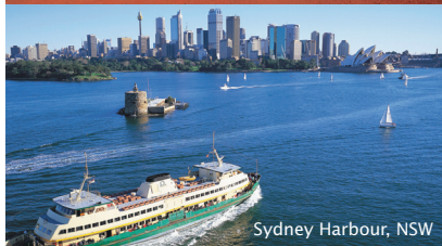
Sydney Harbour, NSW