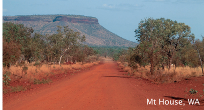
Mt House, WA