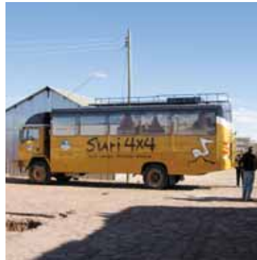
Tour bus donated to promote tourism