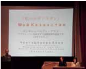
Japanese Speech Contest for CIS Students