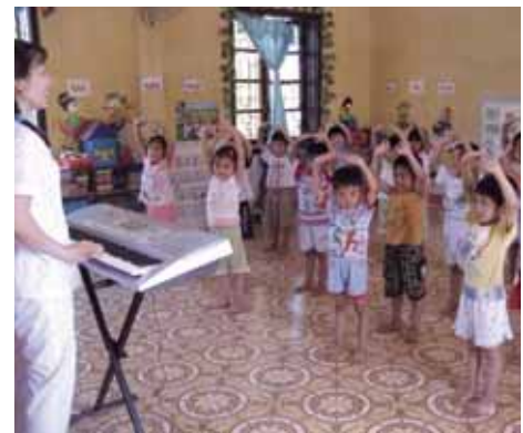
Children dancing to music played on a donated keyboard

*Thang Long Industrial Park II (TLIP-II) is an industrial park developed by Sumitomo Corporation that was completed at the end of 2009 in Hung Yen Province, east of Hanoi.