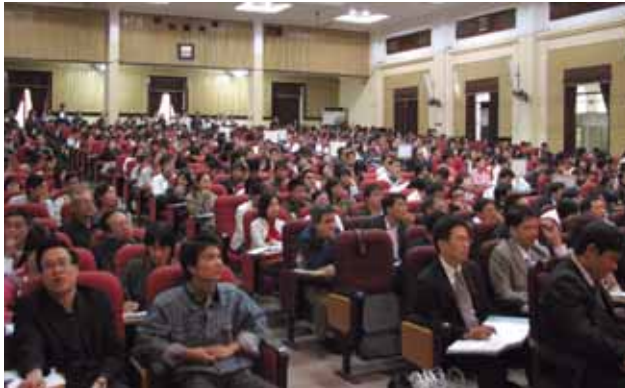
Lecture sponsored by Sumitomo Corporation at Hanoi National Economics University (Vietnam)

With a unique theme—"corporate social responsibility," "global leadership" and "management of global corporations"—for each university, the courses are all designed to develop future leaders of these two countries. The Sumitomo Corporation Group works in cooperation with the universities to plan and run these courses, which bear the Sumitomo Corporation name. These courses are popular among students and get a good evaluation from local governments and other organizations, such as the one from the Tianjin City government: "This program greatly contributes to human resources development and globalization within the region."