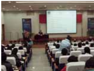
Lecture sponsored by Sumitomo Corporation at Nankai University (China)