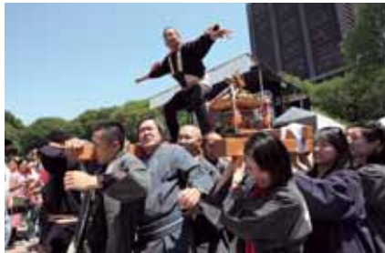
Mikoshi parade, one of the traditional Japanese performances put on for Japan Day

SCOA continues to support the annual Japan Day, which serves as a bridge between Japan and the United States.