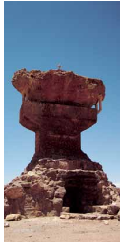
Chupana, a rock worshipped by locals