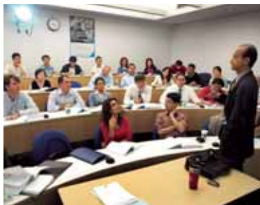
Lecture at CJEB at Columbia Business School