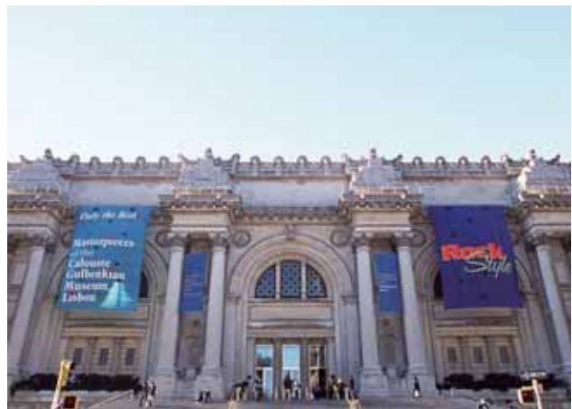
Metropolitan Museum of Arts

Through the Sumitomo Corporation of America Foundation, SCOA will continue to engage in a variety of social contribution activities, including support for relief and recovery efforts for disaster-stricken areas, with the aim of contributing to the achievement of sustainable development in local areas.