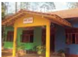
A kindergarten built in Sri Lanka

We will continue to contribute to society by fostering further links between volunteer organizations and our viewers, capitalizing on the unique characteristics of Jupiter Shop Channel, Japan's largest channel that broadcasts live home shopping programs 24 hours a day, 365 days a year.