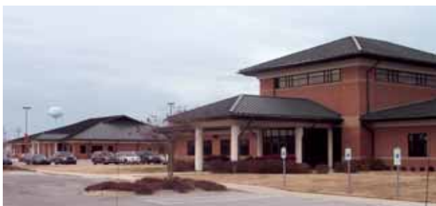
The Student Community Center (front) and the Transportation Technology Center (back)

Through the ASA Charitable Trust the company established in 1999, it has been providing financial support partially for the construction of Arkansas State University’s College Theater, Student Community Center and Transportation Technology Center. ASA also supports the university’s scholarship program and a Japanese language school in the state capital, Little Rock, through the Trust.