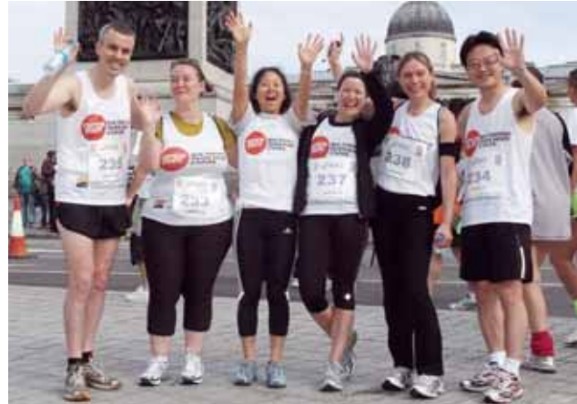
Sumitomo Corporation employees after the 10K London Run

* 10K London Run: A road-based running race through the center of London. The money raised through the race is used to help young homeless people.