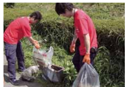
CLEAN UP OUR TOWN activities

The number of participants in CLEAN UP OUR TOWN events throughout the country increased year by year, reaching 12,000 in 2009. Jupiter Telecommunications is planning to further promote the event among its subscribers and local residents while enhancing cooperation with local governments and other organizations.