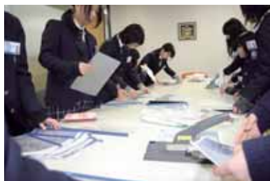
Junior high school children doing work experience

"Schools can learn a lot from how trading companies deal with changing needs of the time," (a school teacher). We will continue to implement and further develop these programs.