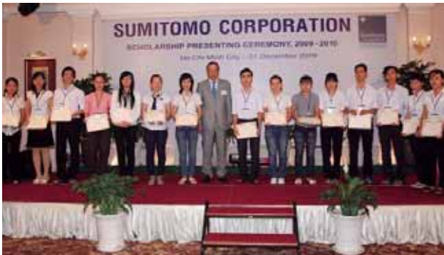
Scholarship recipients at an award ceremony

This scholarship program is unique to Sumitomo Corporation, which has business operations in every corner of the world, including in Asian countries. We will continue to contribute to human resources development in Asia for the future of the region.