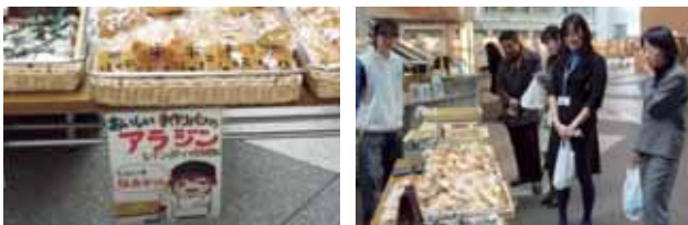
Bake sale at the St. Valentine's Day Fair