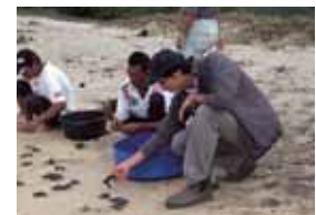
Sea turtles hatching in their natural habitat

In addition to measures to maintain the water quality around the mine, we are actively engaged in reforestation and biodiversity conservation. Partnering with an NGO, we are also helping to ensure the conditions that allow sea turtles to lay eggs and hatch in their natural habitat as it is prohibited to capture and remove them. These represent just some of our efforts to protect the local environment.