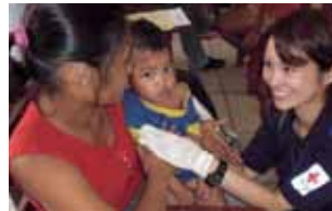
Medical services provided for victims of the typhoon in the Philippines