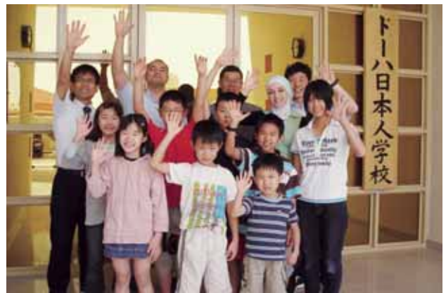
Children at Japan School of Doha

The Japan School of Doha is currently preparing to open its doors to Qatari children, a move Sumitomo Corporation supports through the Japanese Society.