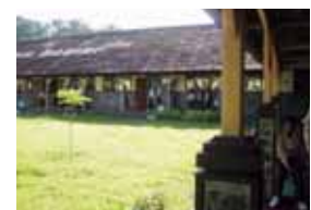
An elementary school building after repair work

Corporation is engaged in a variety of healthcare activities, including a vaccination program for locally problematic diseases, such as malaria and tuberculosis, and health education for mothers and children. We also provide support in nutritional management for infants and in building healthcare systems for the village community. Through these activities, we aim to improve the healthcare standards of the whole local society.