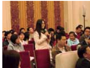
Lecture sponsored by Sumitomo Corporation at Tsinghua University (China)