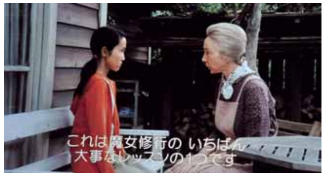
A Japanese movie with Japanese subtitles

For this project, we have been fully employing the integrated corporate strength of the Sumitomo Corporation Group, especially by taking advantage of the expertise of Asmik Ace Entertainment Inc. (movie production/distribution) and United Cinemas Co., Ltd. (cinema complex management). We look forward to many more barrier-free screenings that allow people with and without physical impairments to enjoy highly acclaimed movies together.