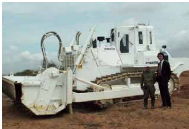
Anti-personnel land mine remover

Sumitomo Corporation continues to support the activities of JMAS aimed at contributing to economic development in safe areas where mines are removed and boosting the development of the whole country of Angola. We also plan to increase cooperation with other organizations that share the same ideals, including private companies, non-profit and non-governmental organizations, the Ministry of Foreign Affairs of Japan, and the Japan International Cooperation Agency (JICA), in order to further promote activities to help people currently living with the threat of buried land mines.