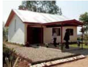
Sumitomo Corporation Library (outside)

(computers, furniture, etc.) requested by the teacher training institution, drawing upon our ability to call on a global network—our core competence as an integrated trading company—the Sumitomo Corporation Group will also obtain books that are not locally available, as well as books about Japanese education, culture and customs from foreign markets if requested in order to meet the needs of the institution, which operates in various parts of the country.