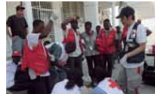
Medical services provided for victims of the earthquake in Haiti