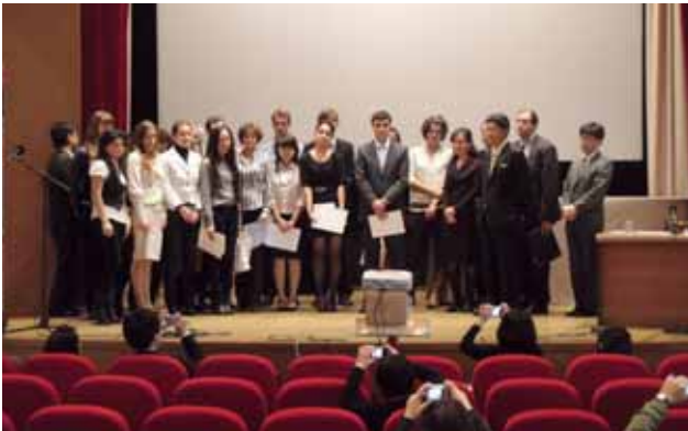
Participants in the Japanese Speech Contest for CIS Students

The Moscow Office plans to continue our support and cooperation with regard to the Japanese Speech Contest for CIS Students and the Japanese Festival for Boys and Girls in the future.