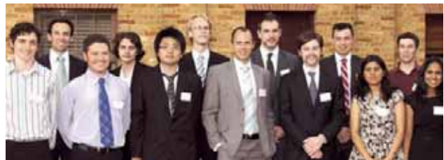
Awardees of the National Energy Essay Competition