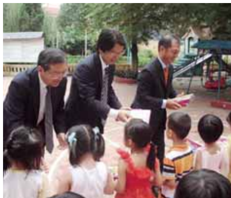
Handing out crayon boxes to kindergarten children

At Thang Long Industrial Park (TLIP) in Hanoi, Vietnam (established by Sumitomo Corporation in 1997), we set up a Social Responsibility Committee made up of representatives of tenants and TLIP to liaise with local people. The Committee also organizes activities to support local education and communication. It collects donations from tenants and purchases pianos and musical keyboards, computers, TVs and DVD players for kindergartens