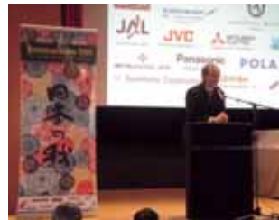
Japanese Festival for Boys and Girls