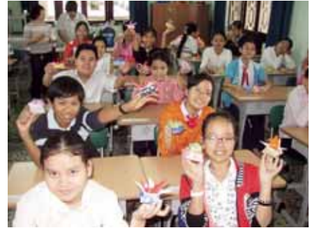
Children learning about Japanese culture

The lessons are taught by an ex-employee of Sumitomo Corporation, who has a national license to teach Japanese to a total of 120 students in eight classes. In addition to the language, many aspects of Japanese culture, including the different seasonal celebratory rituals, unique customs in daily life, and traditional children's pastimes like origami and cat's cradle, are introduced. The students also take field trips to Japanese auto parts or food factories in the suburbs to learn more about Japan through first-hand experiences.