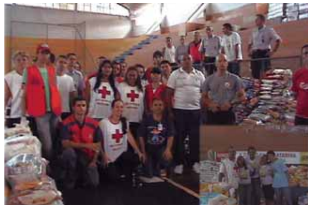
The SOS Santa Catarina Brazilia Team that provided support for flood victims

In addition to these measures to provide immediate support to disaster victims, Sumitomo Corporation do Brasil promotes a variety of activities to contribute to local communities within Brazil.