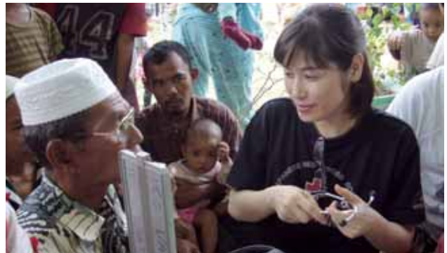
Medical services provided for victims of the earthquake off Sumatra

We also made a financial contribution to help the victims in Indonesia of the massive earthquake off Sumatra in September 2009, the victims of the typhoon that hit the Philippines in September and October 2009, and the victims of the massive earthquake that hit Haiti in January 2010. In each case, the money donated by company employees was added to the corporate contribution and sent to the affected communities via the Japanese Red Cross Society. In the event of future natural disasters, Sumitomo Corporation is ready to respond promptly with relief measures that include donations from employees. The company will continue to fulfill its responsibilities to society as a good corporate citizen.