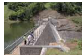
Irrigation dam constructed in a farming area

year) to three-crop farming (harvesting three times a year). We also support projects to increase the yield of rice. In aquaculture, we provide assistance to seaweed growers. In addition, the occupational skills and management training we provide is related to a broad range of areas from car repair to healthcare services. These projects are planned for many different industries with a long-term view in order to help the region thrive even after the mine is closed.