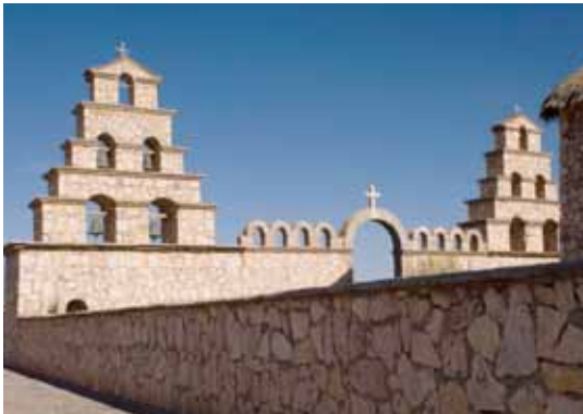
A church relocated from the old San Cristobal Village

The major challenge today, is how we could aid to build local capacities to allow them to start sustainable development processes, managing the new wealth created due to our presence and maintaining their culture based on the reciprocity.