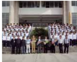
High school children from areas in Yunnan Province, China that receive support

Shanghai—an area in which a lot of emphasis is placed on different types of educational programs—in school. The money donated by employees and the company helped a total of 71 elementary, junior high school and senior high school students continue their schooling. The Sumitomo Corporation Group continues to run these programs to support the sustainable development of communities in the areas in which we do business.