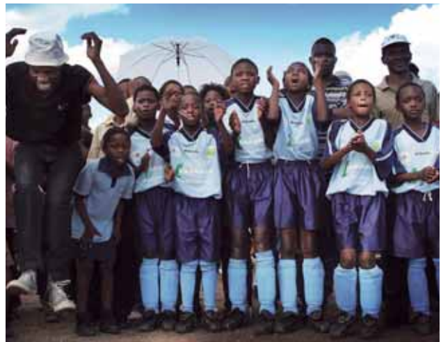
Children at a football tournament organized by a local foundation

In addition to these social contribution activities, Sumitomo Corporation is planning to initiate measures to contribute to the sustainable development of the country in cooperation with our local business partners in our iron ore, manganese, and chromium mining operations. In particular, we are aiming to implement measures to raise the standard of living of local residents, including mine workers and their families.