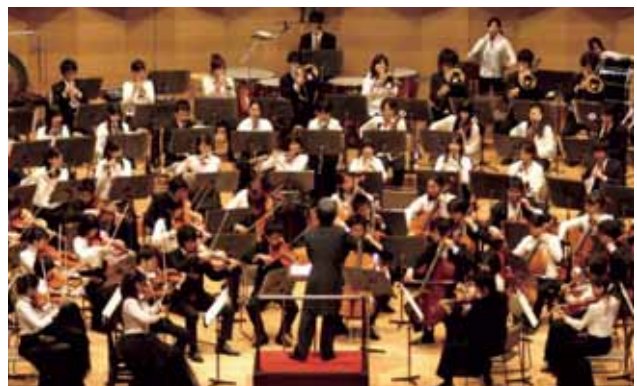
The 44th Sumitomo Corporation Young Symphony Concert (January 2010 at Suntory Hall)

By supporting the Junior Philharmonic Orchestra, Sumitomo Corporation will continue to play its part in helping young people develop both their musical talents and personal capacities.