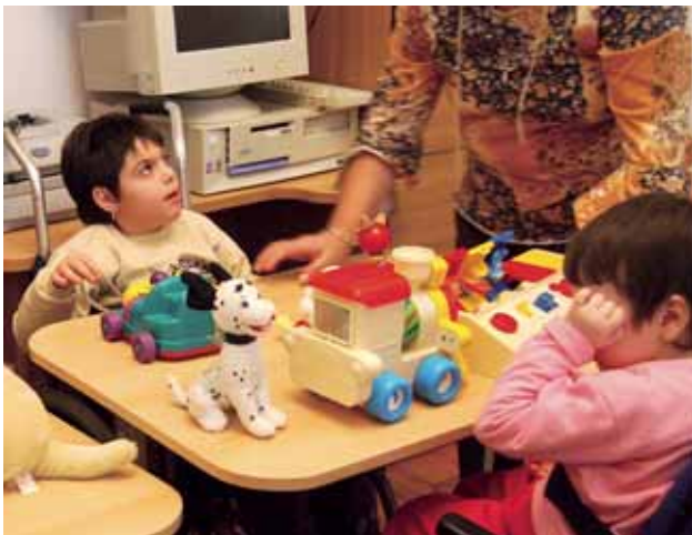
Children enjoying a game

Children with disabilities are not the only children in Romania who need assistance, however. In recent years, there have been an increasing number of Romanian children left behind by parents who have gone to Western Europe looking for work. SAROM is currently looking into how it can provide support to the orphanage that take in these children.