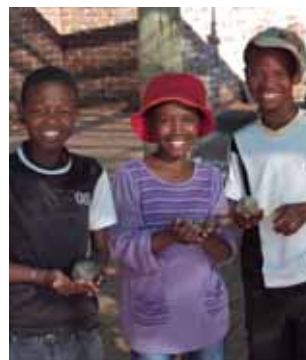
Environmental education supported by a local foundation