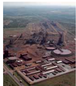
With its iron mine, Sumitomo Corporation has an investment in South Africa's future