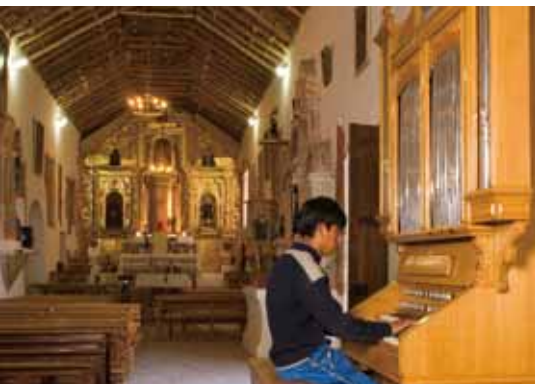
Pipe organ in the church relocated from the old site