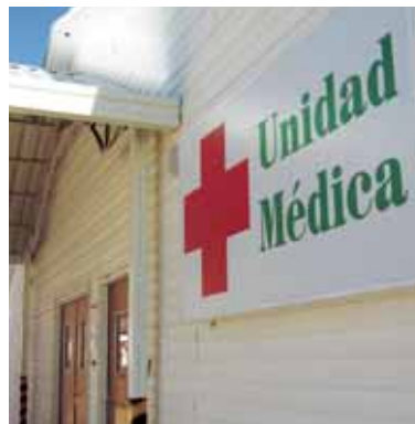
Hospital constructed in the new San Cristobal Village