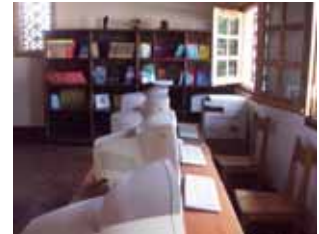
Sumitomo Corporation Library (inside)