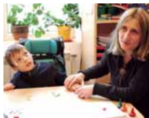
During a lesson