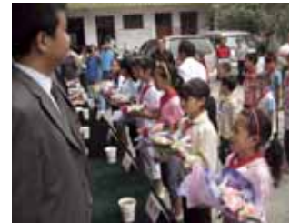
Elementary school children from areas in Anhui Province, China that receive support