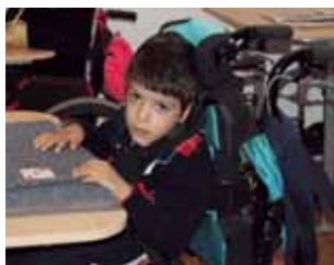
A child studying arithmetic