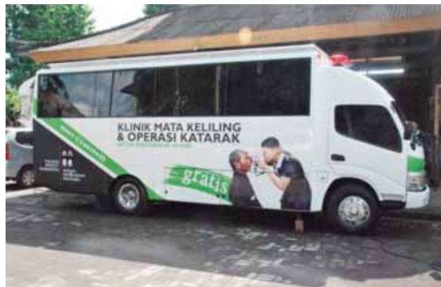
Mobile eye clinic donated by HMSI

Before giving away the trucks, HMSI fits them out for specific purposes. For example, one is used as a mobile library to deliver books to poor children living in slum areas, one is transformed into a mobile eye clinic for people with visual impairments who cannot afford to pay the medical fee, and another is used as a campaign vehicle for the conservation program to protect Sumatran tigers on the Sumatra island of Indonesia.