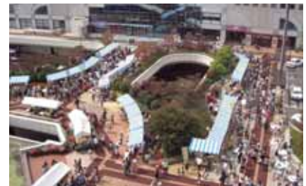
Izumi Marché 2009 held in front of Izumi-chuo Station in Sendai

Based on its success, Sumisho Urban Kaihatsu plans to continue running this event over longer periods and with more frequency.