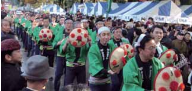
Suginami Hanagasa Festival organized by Sumit

With some 20,000 people attending the festival each year, the event has become an early winter tradition for the local community.