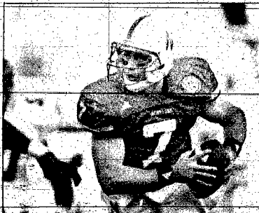
IN AGAIN: Nebraska didn't waste time Saturday against Kansas, scoring on six of its first seven possessions. At left, Eric Crouch moves down the line on a 3-yard run for his third of four first-half touchdowns.