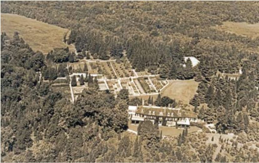
Fenno Estate, 1950. Presently SeaView Retreat, courtesy of Sea View Retreat and the Comley family

Falling between the full sheet formats and the small ones, were the half sheets measuring approximately 21" x 17". Harrison Roses (plate 9, pg. 20), Night Blooming Cereus (plate 12, pg. 22), White Phlox in Sunshine (plate 11, pg. 22), Summer Roses (plate 10, pg. 21), and White Azaleas (plate 3, pg.8) illustrate Hills' versatility with varying compositions and color combinations. From the simple and soft palette of White Phlox in Sunshine and White Azaleas to the lively color combinations of Harrison Roses and Summer Roses , Hills worked swiftly laying down colors and using her pinky for selective blending.