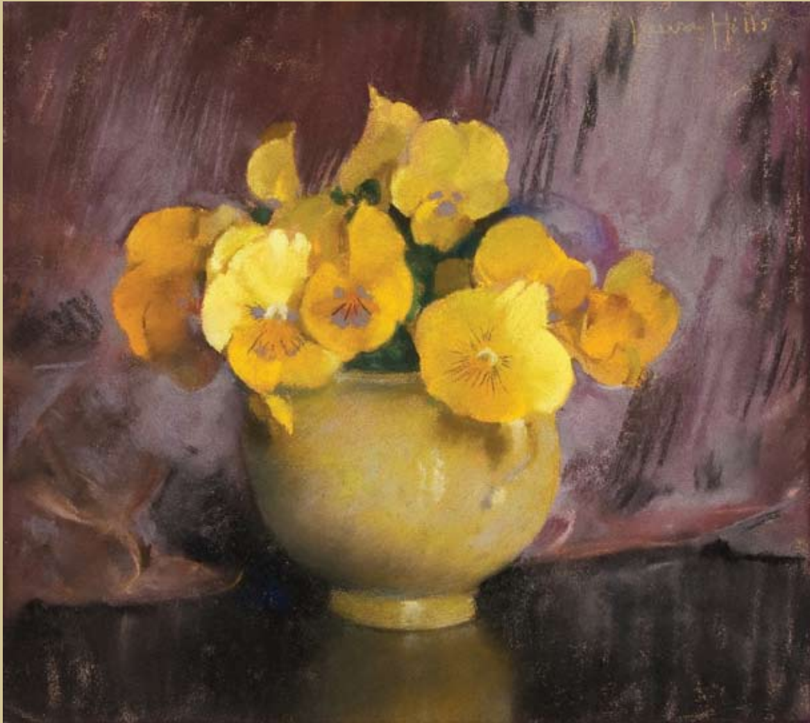
13. Pansies Circa 1935 Pastel on paper 10 5 / 8 x 11 3 / 8 inches Signed upper right