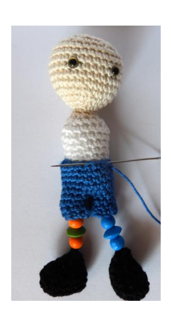
Sew the arms to the body

Sew the pants to the body and then pull up the shirt from below