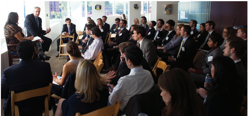
Term members participating in the annual conference.

The Stephen M. Kellen Term Member Program, established to cultivate the next generation of foreign policy leaders, encourages promising young men and women from diverse backgrounds to engage in a sustained conversation on international affairs and U.S. foreign policy. Each year a new class of term members between the ages of thirty and thirty-six is elected to serve a five-year term. Term members enjoy a full range of activities, including events with high-profile speakers, an annual Term Member Conference, roundtables, trips to various sites, including military bases, international organizations, and U.S. governmental agencies, and one weeklong study trip abroad every two years.