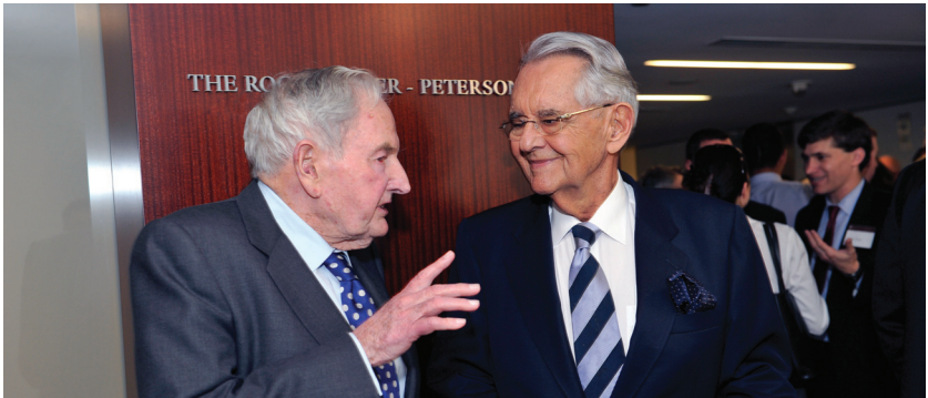
David Rockefeller and Peter G. Peterson, former chairs of the CFR Board of Directors, at a CFR event.

Peter G. Peterson, Chairman Emeritus David Rockefeller, Honorary Chairman Maurice R. Greenberg, Honorary Vice Chairman Leslie H. Gelb, President Emeritus