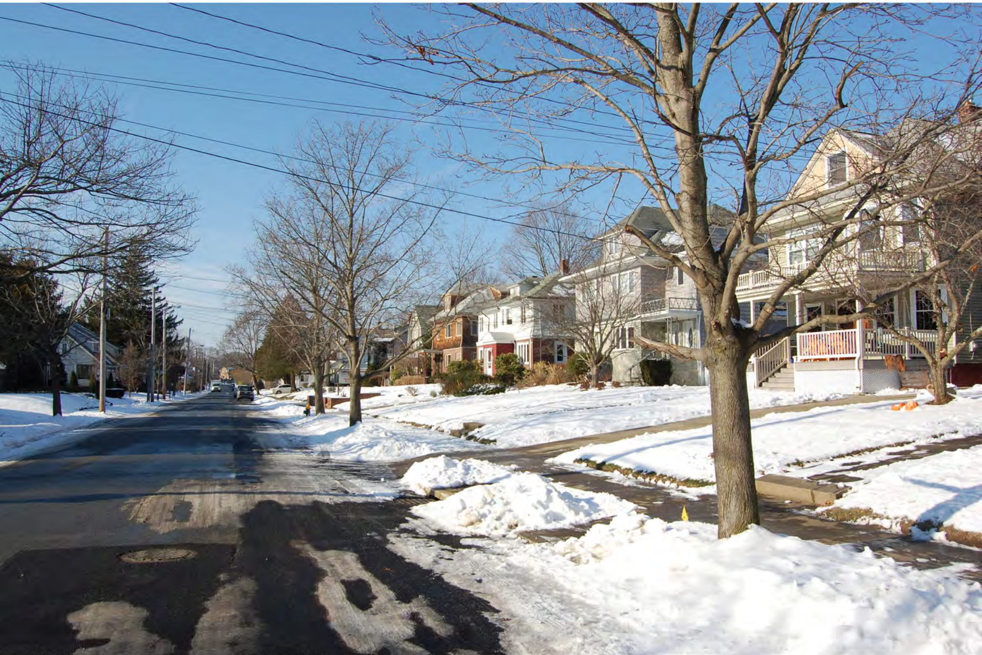
Edgewood Historic District - Anstis Greene Estate Plats Providence Co., RI Photo 2 of 13