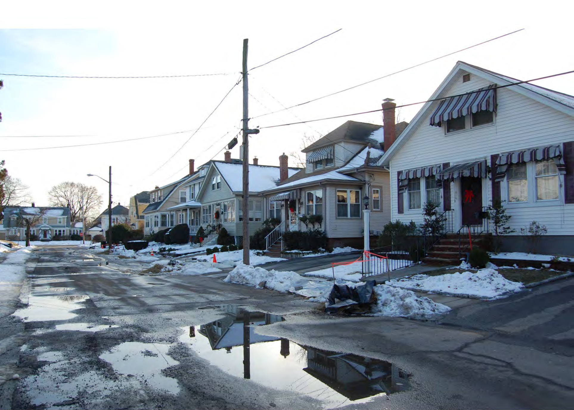
Edgewood Historic District - Anstis Greene Estate Plats Providence Co., RI Photo 9 of 13