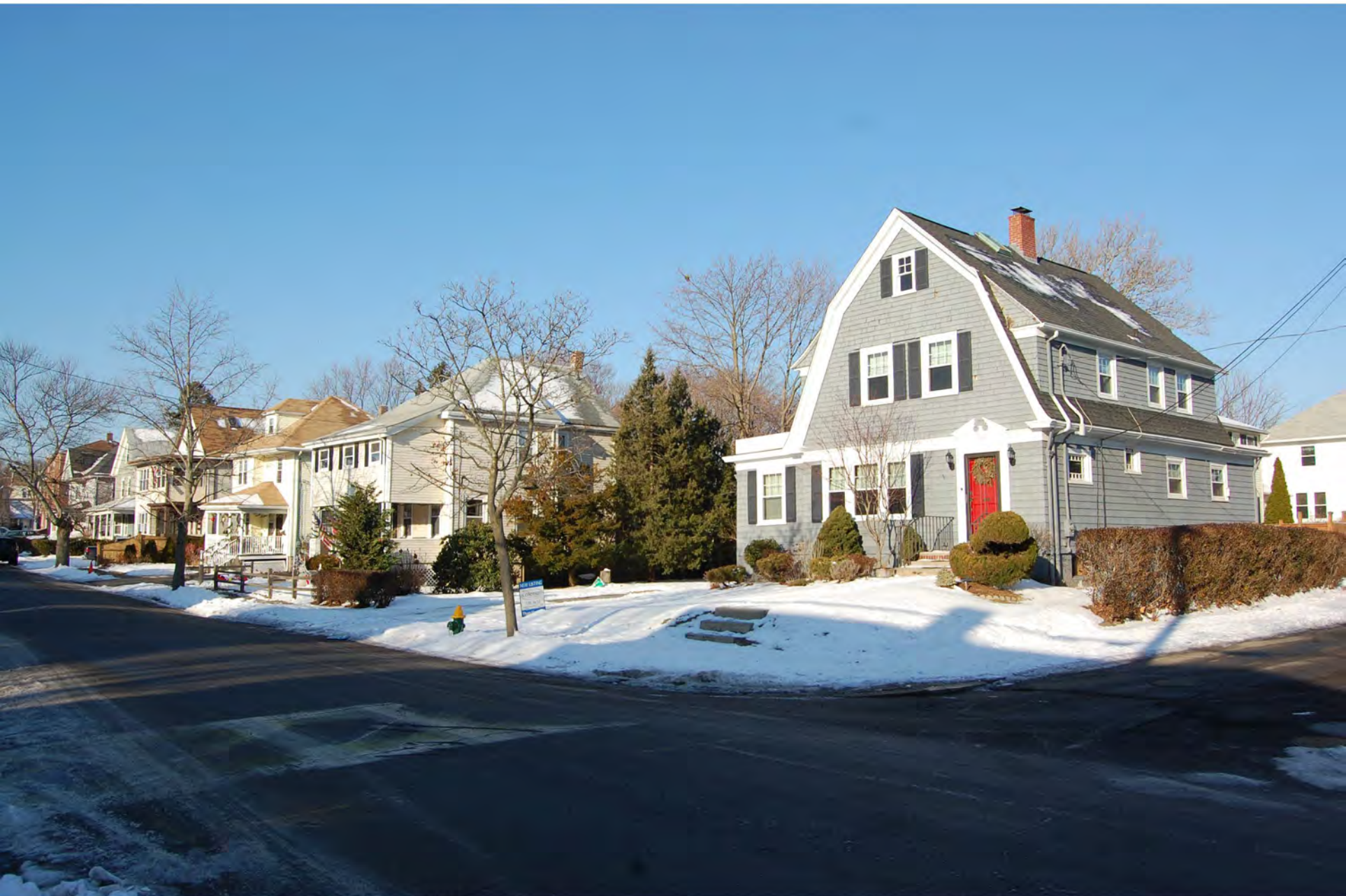
Edgewood Historic District - Anstis Greene Estate Plats Providence Co., RI Photo 11 of 13