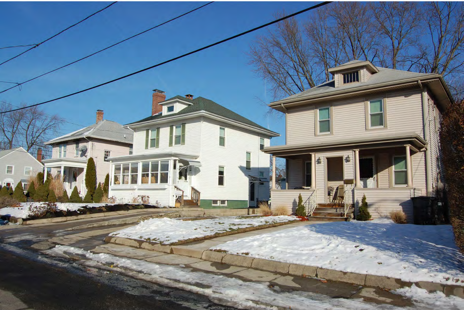
Edgewood Historic District - Anstis Greene Estate Plats Providence Co., RI Photo 13 of 13