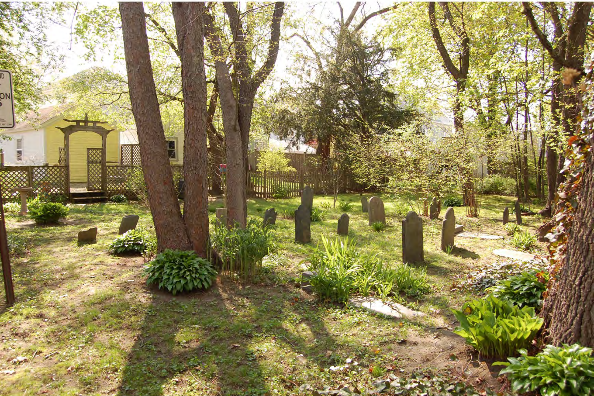
Edgewood Historic District - Anstis Greene Estate Plats Providence Co., RI Photo 5 of 13