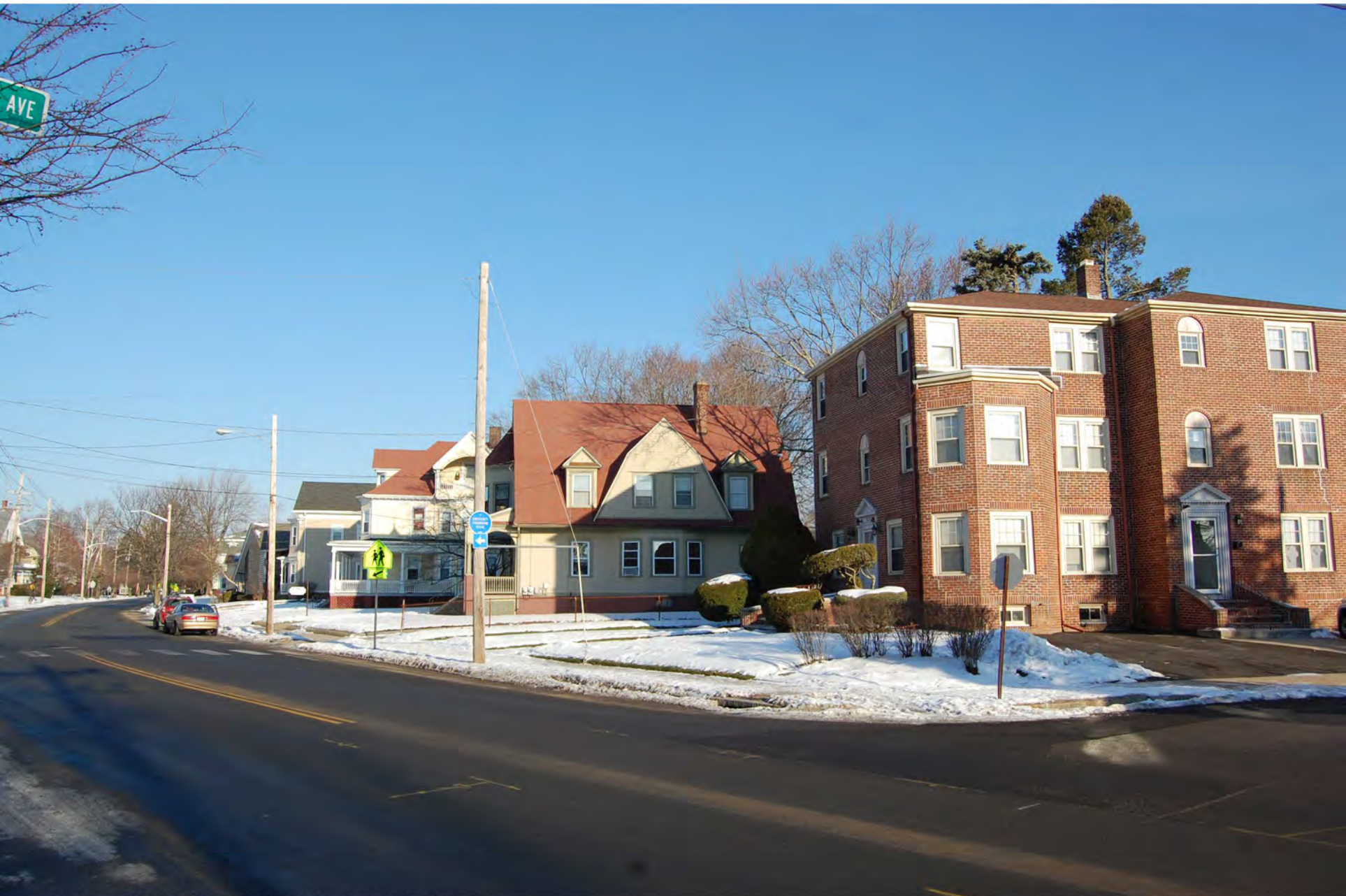
Edgewood Historic District - Anstis Greene Estate Plats Providence Co., RI Photo 3 of 13