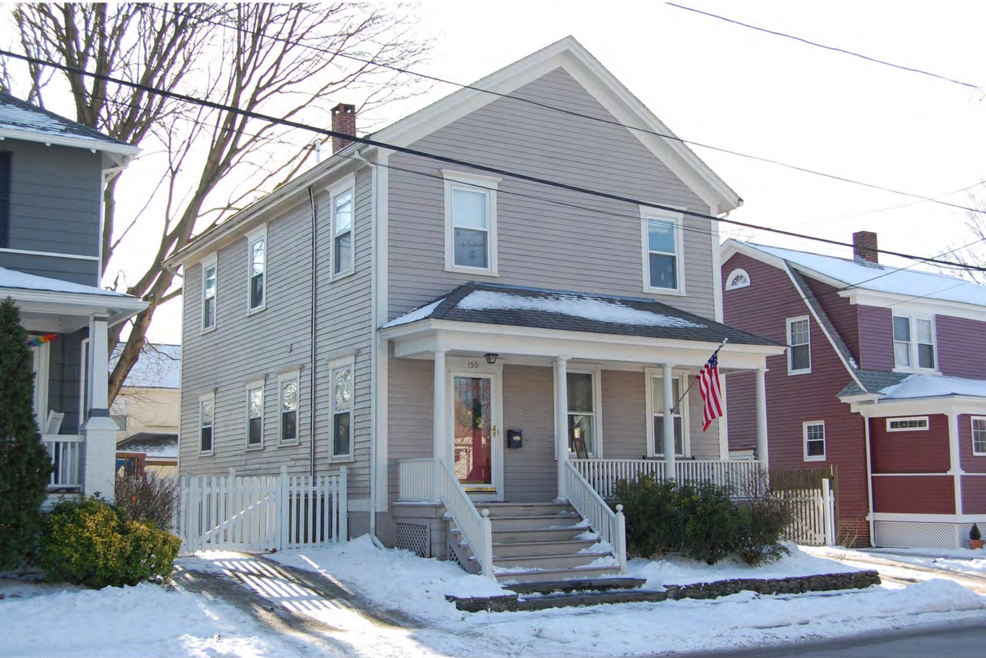
Edgewood Historic District - Anstis Greene Estate Plats Providence Co., RI Photo 6 of 13