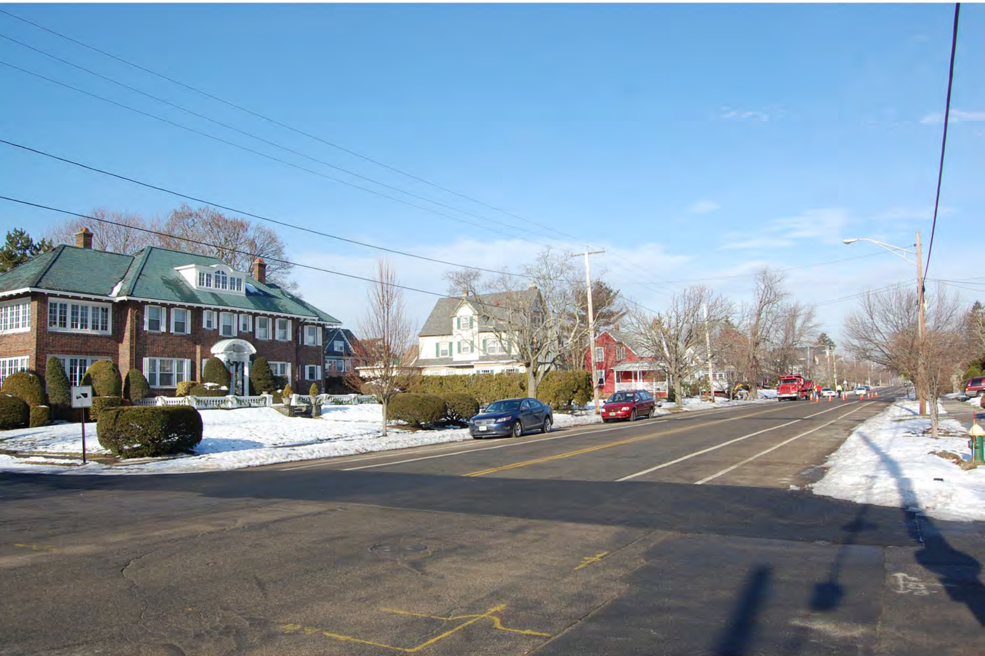
Edgewood Historic District - Anstis Greene Estate Plats Providence Co., RI Photo 4 of 13