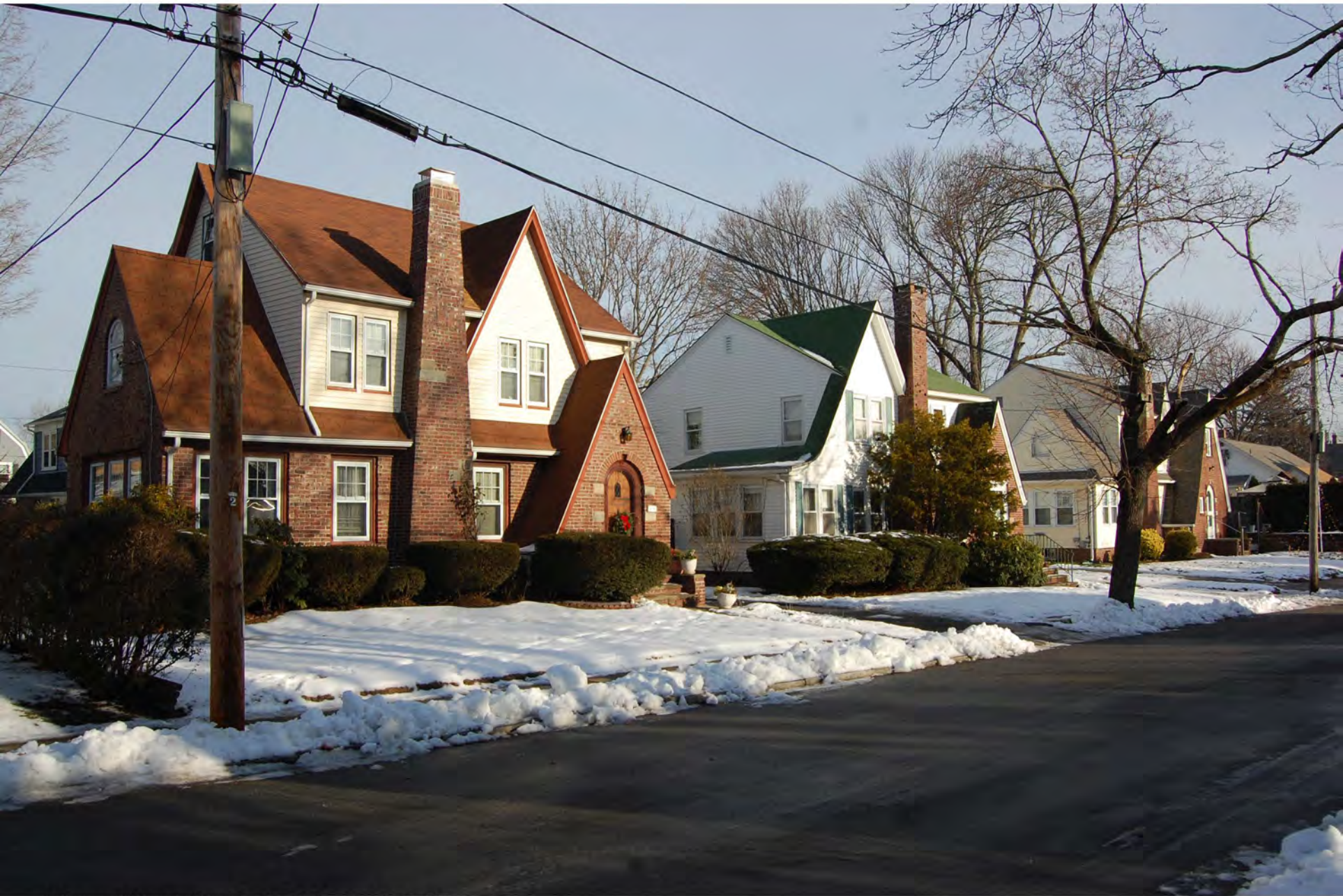
Edgewood Historic District - Anstis Greene Estate Plats Providence Co., RI Photo 10 of 13