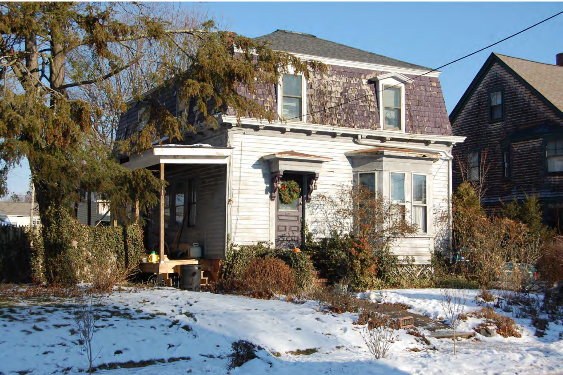
Edgewood Historic District - Anstis Greene Estate Plats Providence Co., RI Photo 7 of 13