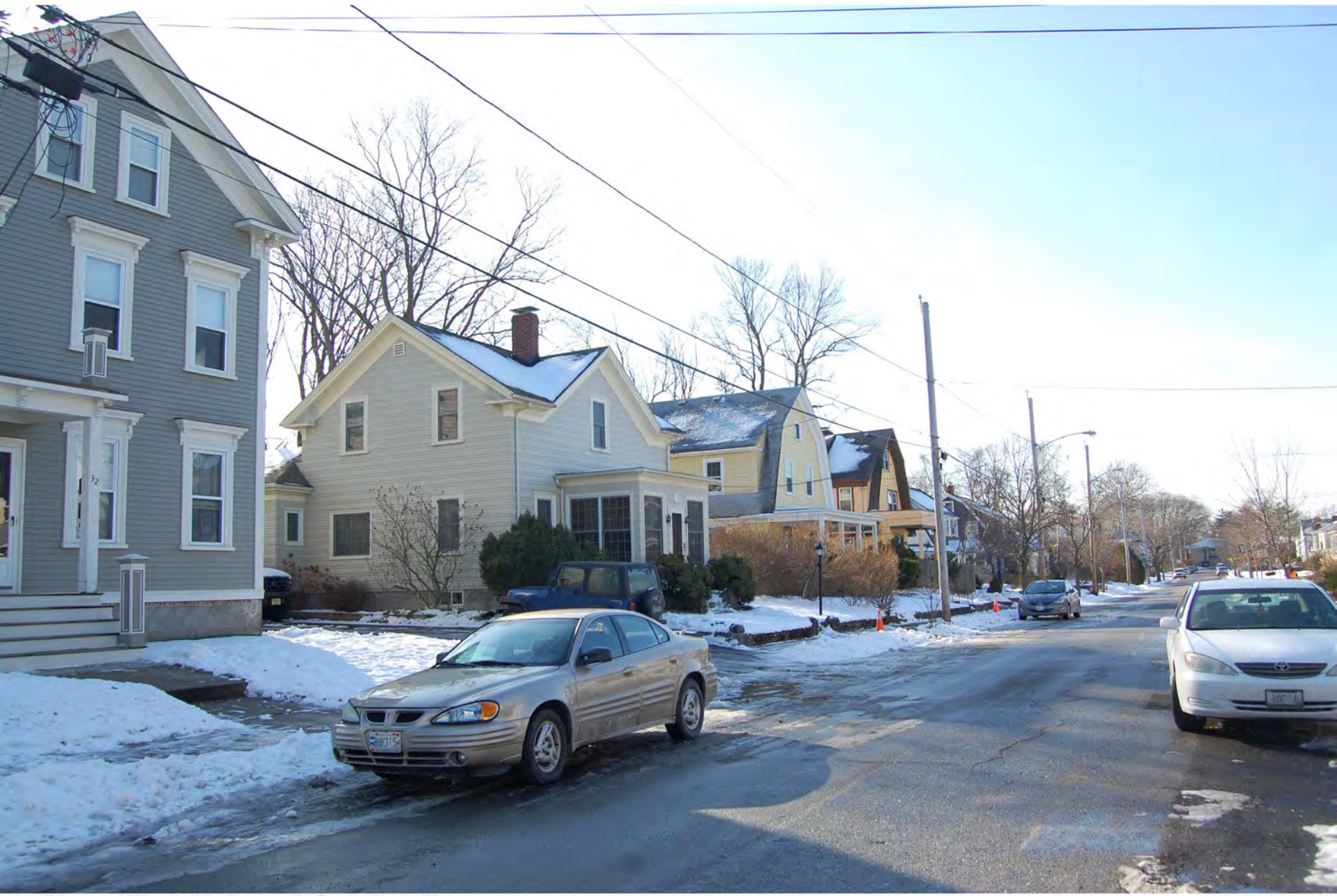
Edgewood Historic District - Anstis Greene Estate Plats Providence Co., RI Photo 12 of 13