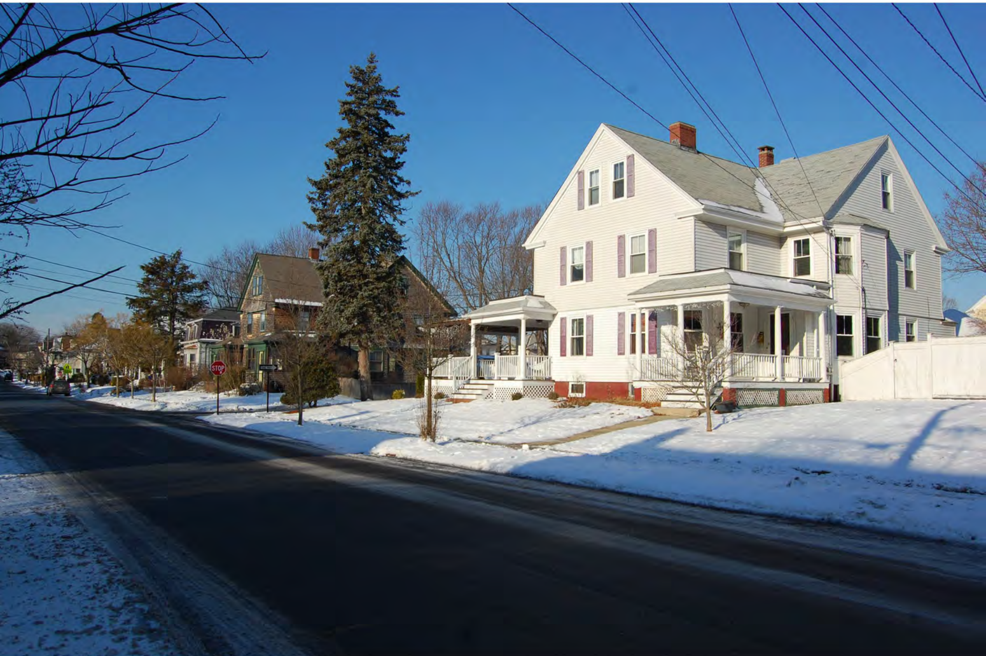
Edgewood Historic District - Anstis Greene Estate Plats Providence Co., RI Photo 1 of 13