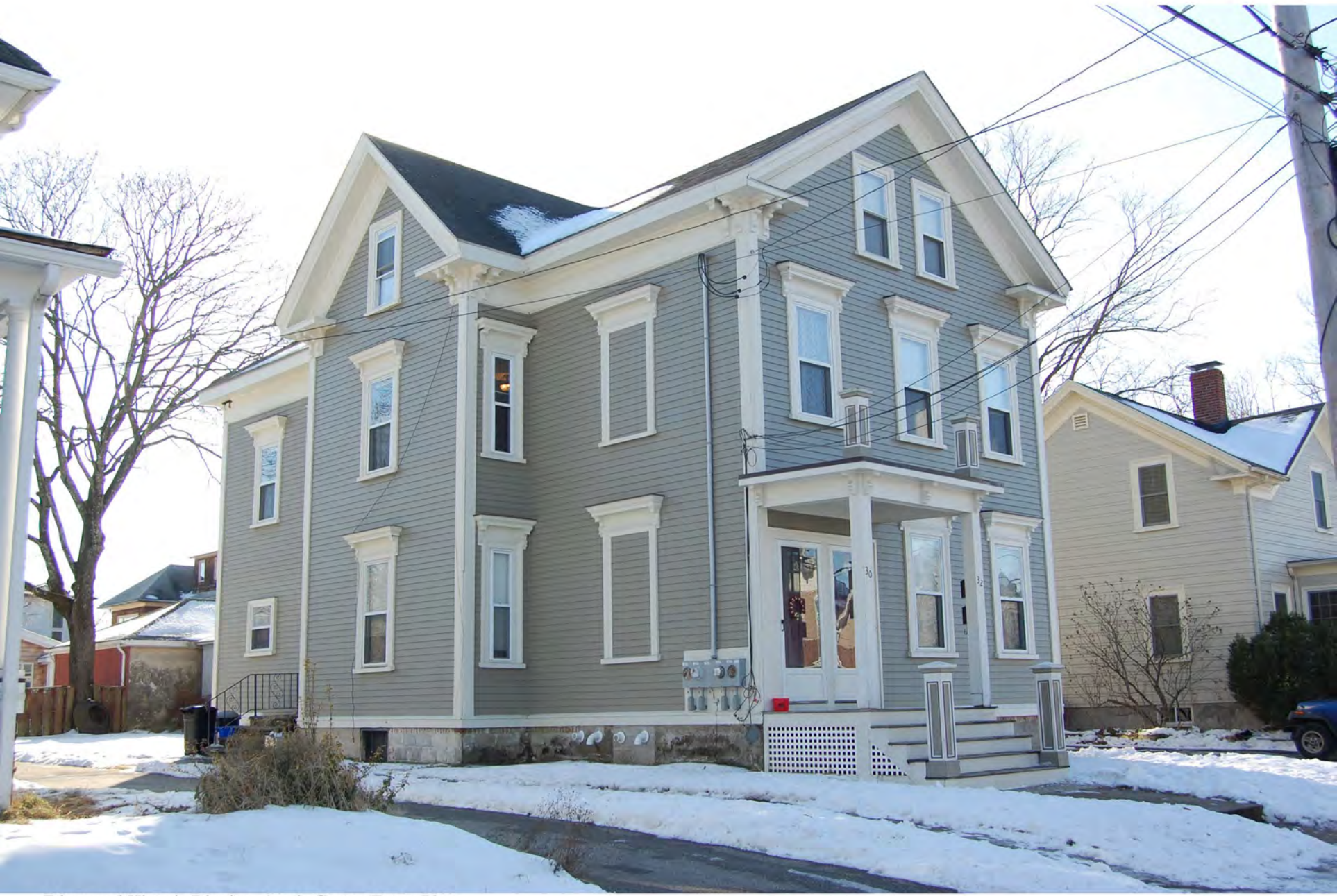
Edgewood Historic District - Anstis Greene Estate Plats Providence Co., RI Photo 8 of 13