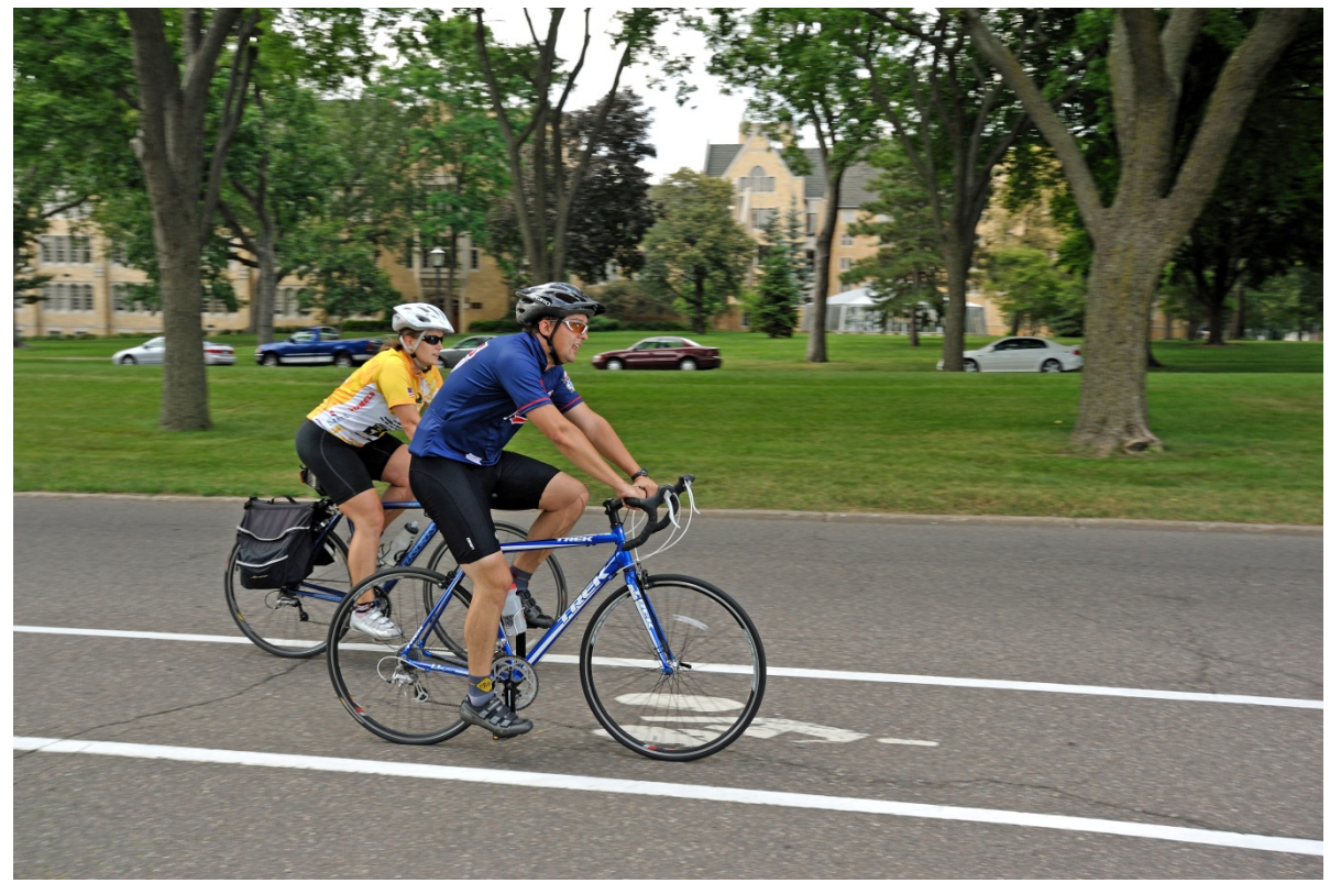
Bicyclists in marked bike lane

How can we safely accommodate bicycle transportation?