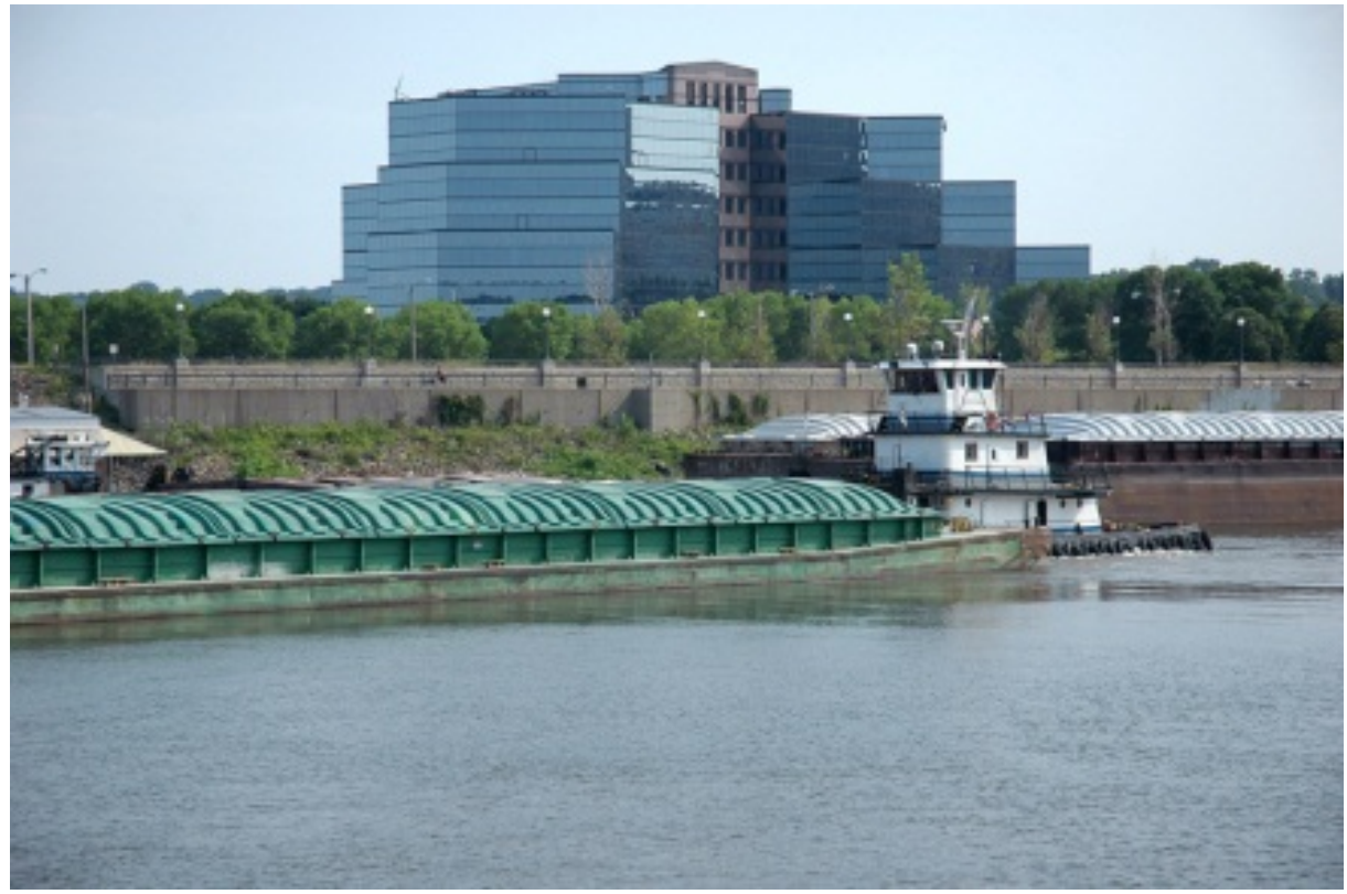
Barge on Mississippi River

What is the economic value of barge traffic to Minnesota?