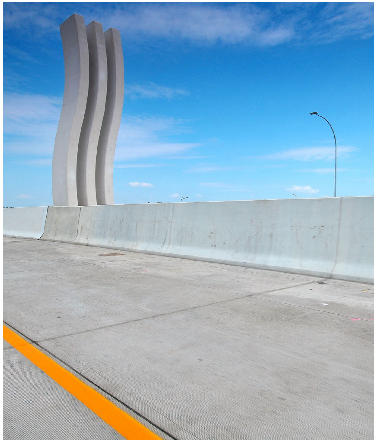
Roadway with tall concrete median barrier

• I need information on the safety aspects of extra tall concrete median barriers.