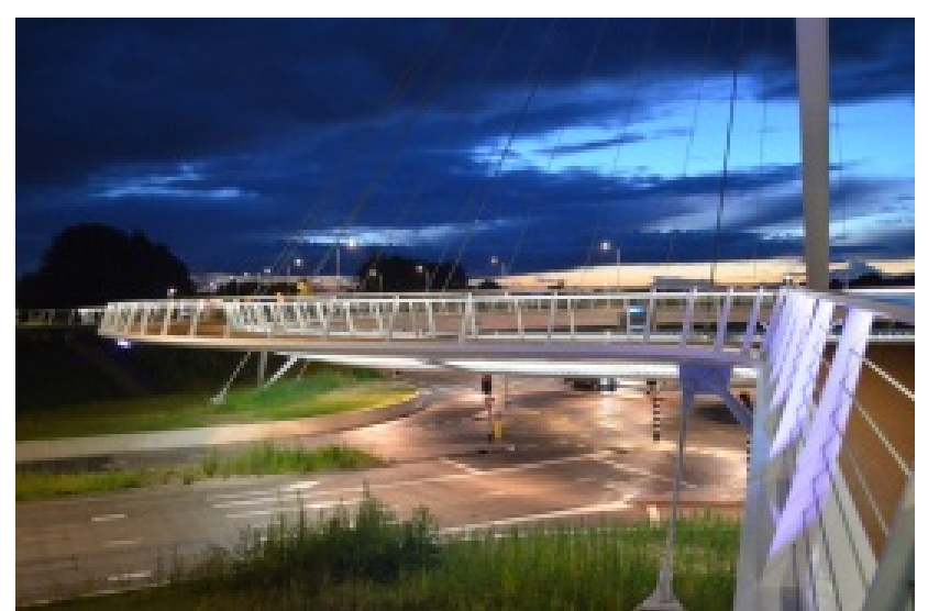
Hovenring elevated bicycle and pedestrian roundabout

I need information on elevated bicycle roundabouts. http://en.wikipedia.org/wiki/Hovenring