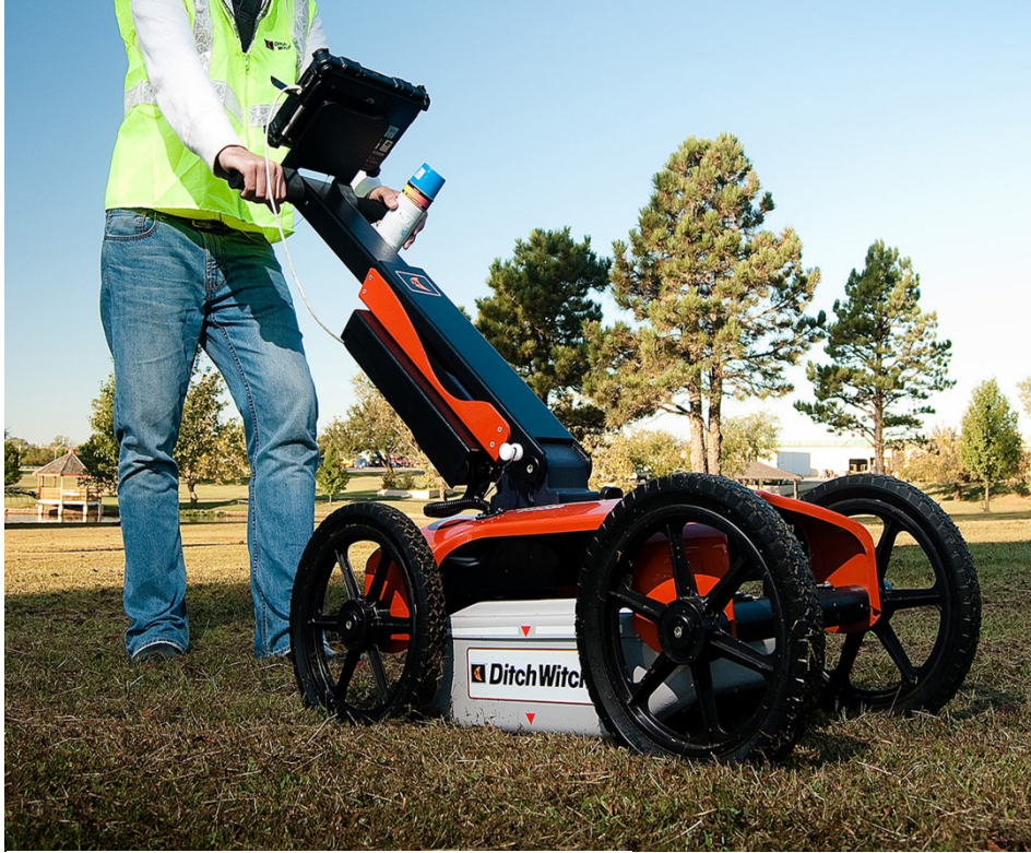
Ground penetrating radar

• Can we use ground penetrating radar to measure variations in overlay thickness?