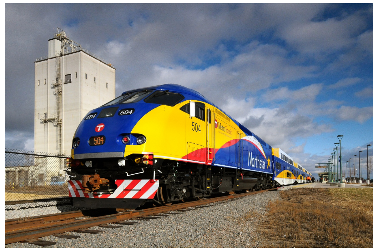
Northstar commuter train

• We need information on commuter rail programs at other states.