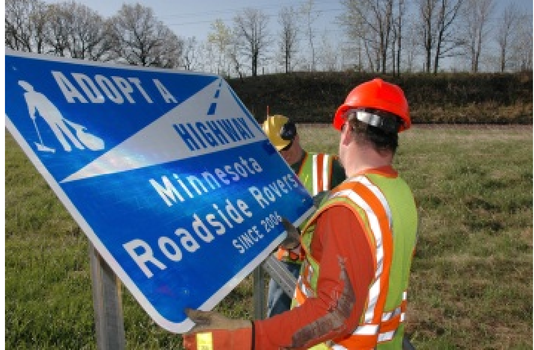
Adopt a highway sign

What are other states doing to develop their "adopt-a-highway" like programs?