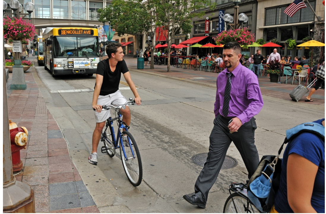
Mixed use street design

What are the best practices for "complete streets?" Video - <a href="http://youtu.be/eybnVOMEX6w">http://youtu.be/eybnVOMEX6w</a>