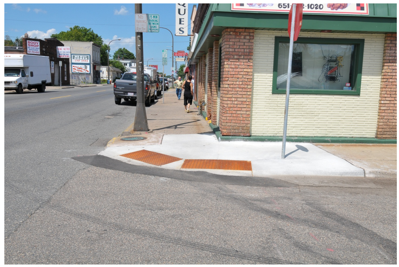
ADA compliant curb cut

• What do we need to know about ADA compliance?