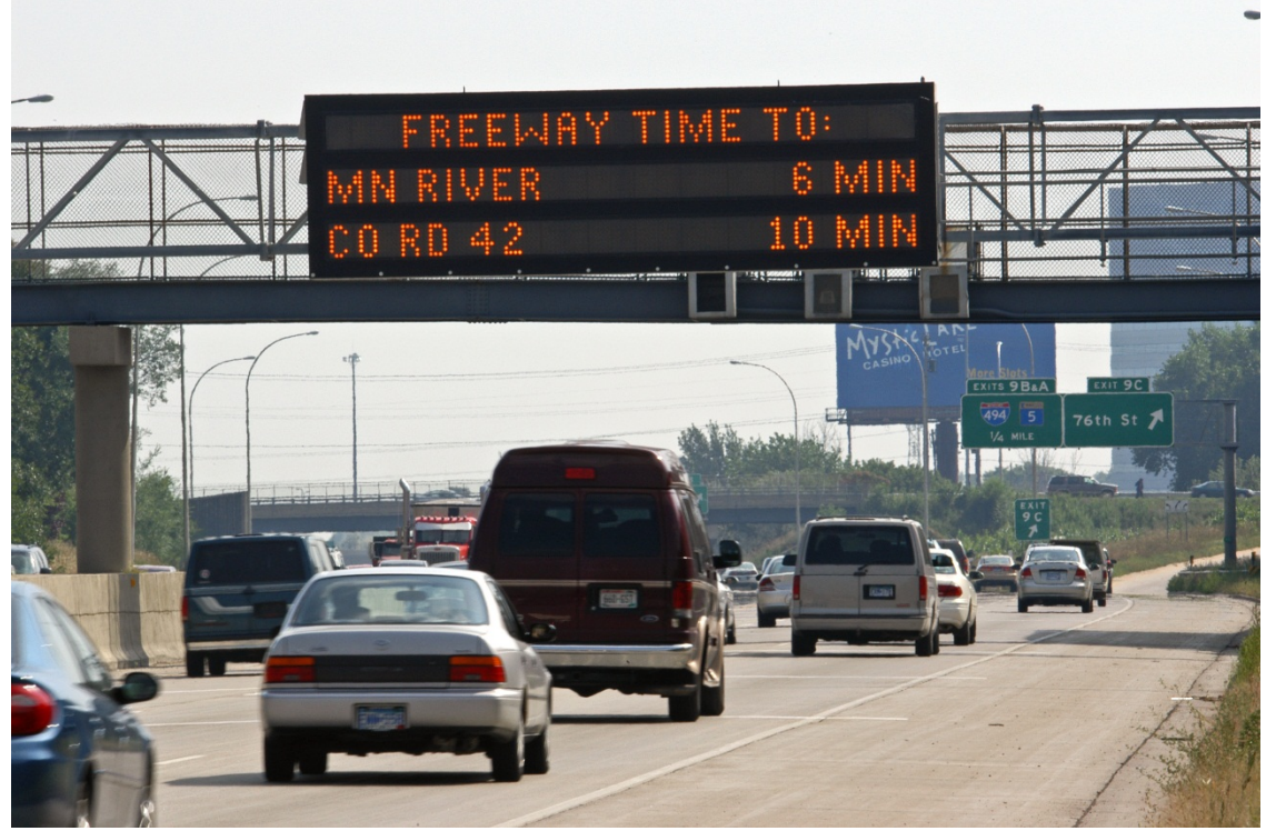
Variable message sign

• What are the safety and traffic impacts of changeable/variable message signs?