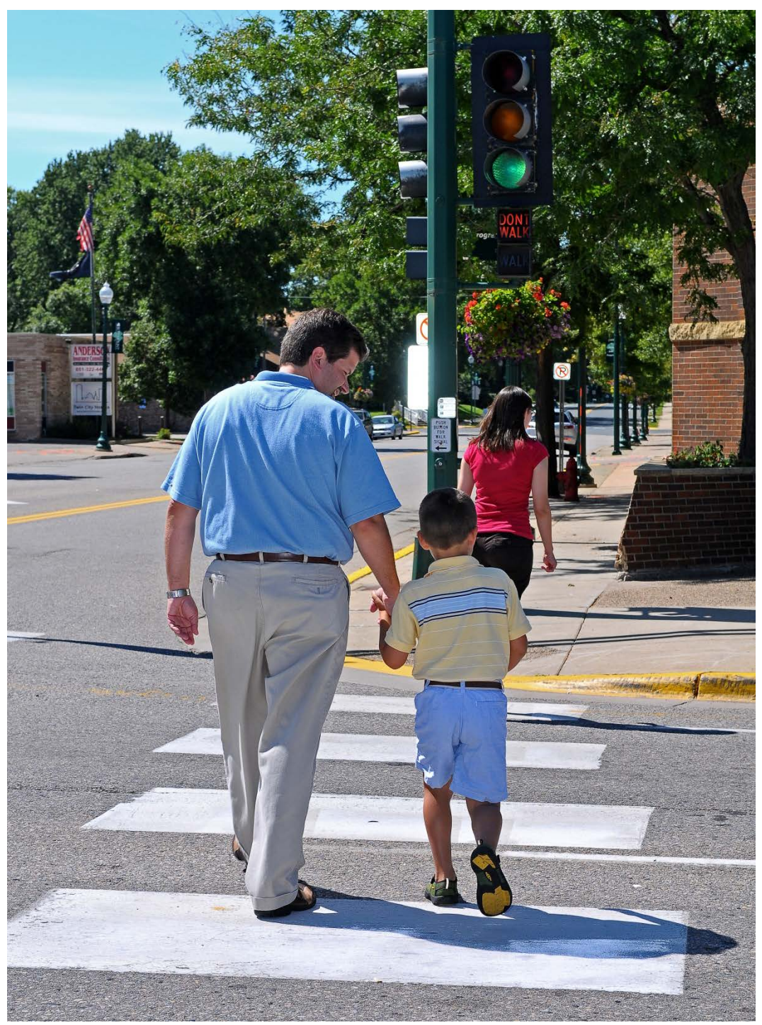
Pedestrians in crosswalk