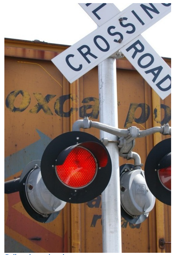
Railroad crossing sign

• Safety treatments for at-grade railway crossings