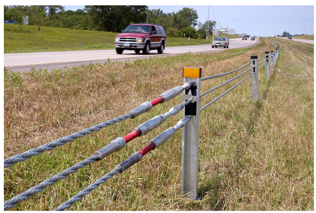
Cable median barrier

• I need information about the safety and cost benefit impacts of cable median barriers. Video at <a href="http://youtu.be/JKoLkzDWUCM">http://youtu.be/JKoLkzDWUCM</a>