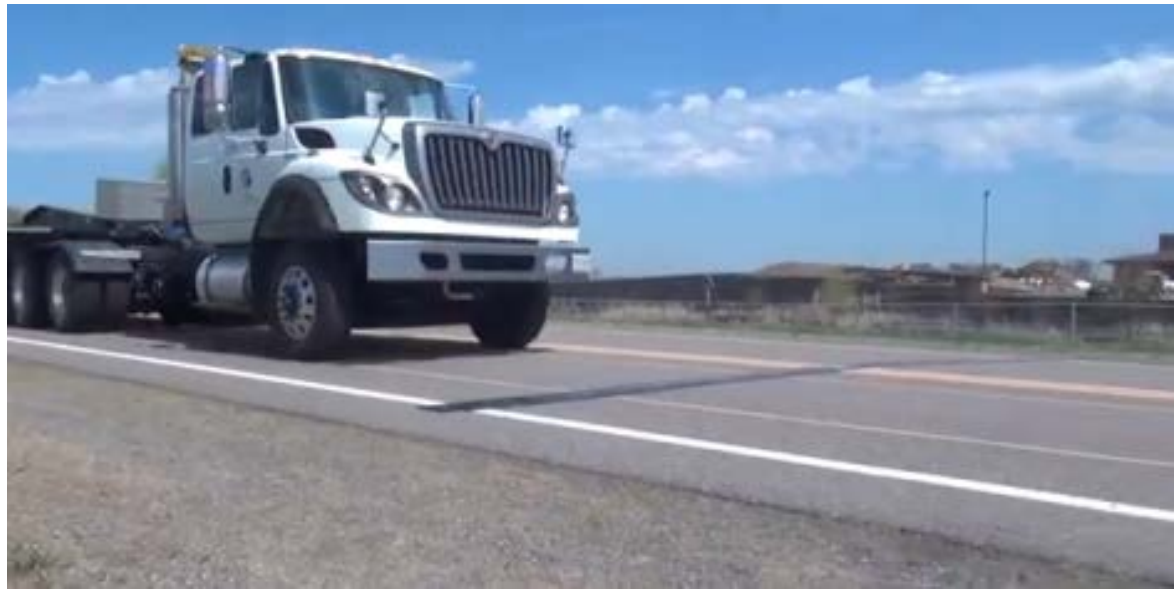
Weigh in motion device on road

We need information on weigh in motion implementation. Video - <a href="http://youtu.be/eLlyKiiEfaY">http://youtu.be/eLlyKiiEfaY</a>