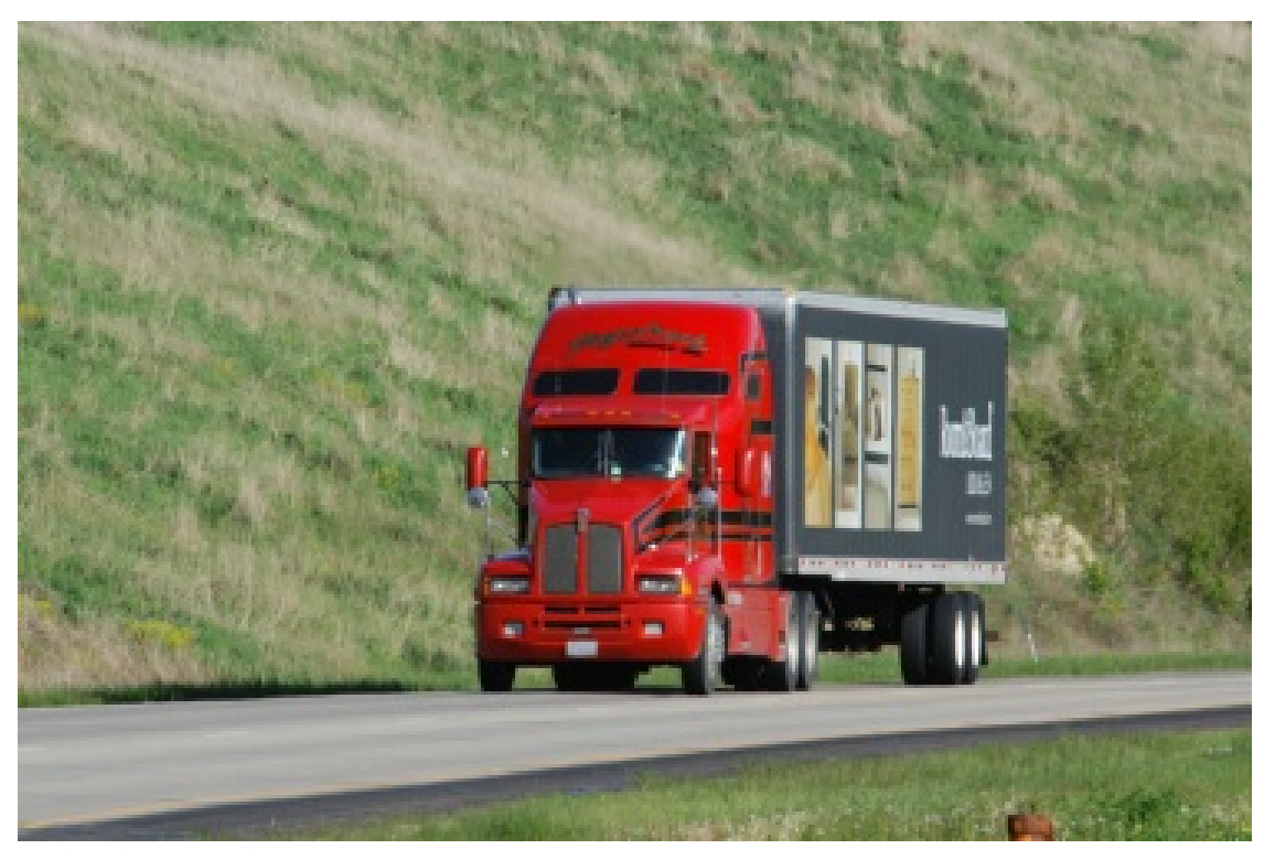
Truck with super single tires

What are the cost/benefits of super single truck tires?