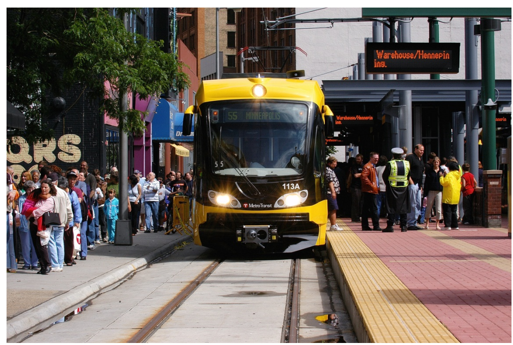
Light rail car

• We need to know about light rail (LRT) systems; cost, effectiveness, safety, planning, etc.