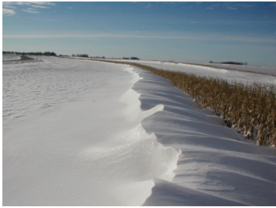
Drifts created by living snow fence

• I need to know about using plants as snow fences; living snow fences.