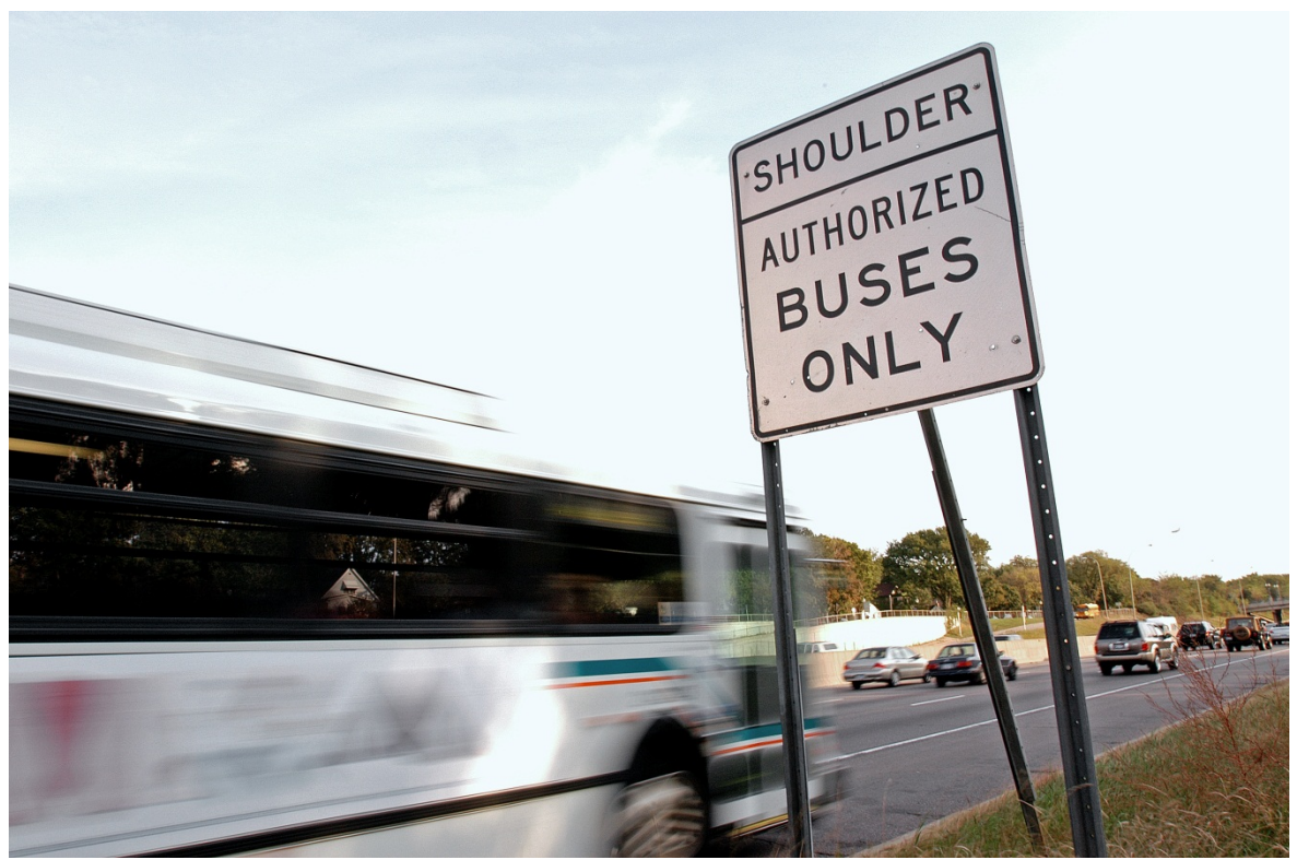
Bus running on road shoulder

What are the impacts of bus only shoulders on traffic congestion and safety?