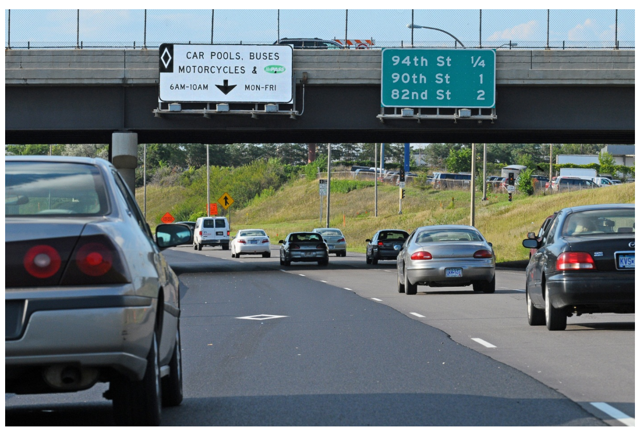
High occupancy vehicle lane

What are the impacts of HOV (high occupancy vehicle) lanes?