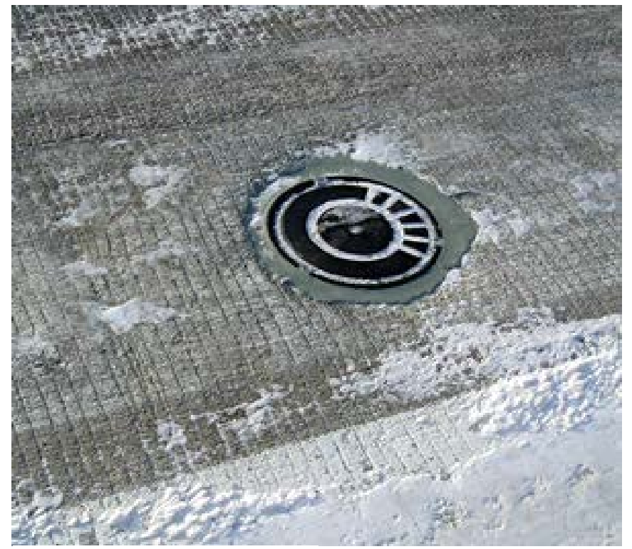
Spray head in bridge deck

• Automated Deicing of Bridges; safety, effectiveness, cost.