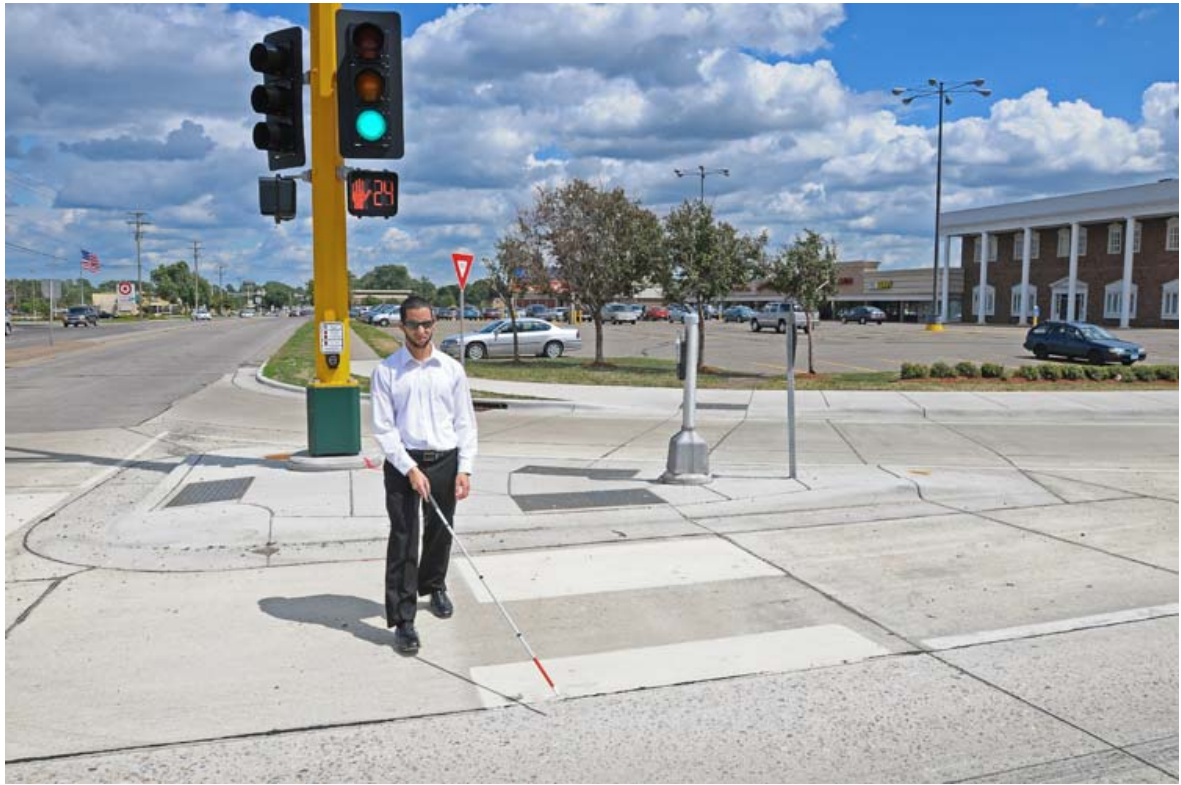
Man using ADA compliant crosswalk

• I need to know more about travel patterns and behavior of visually impaired travelers. (ADA)